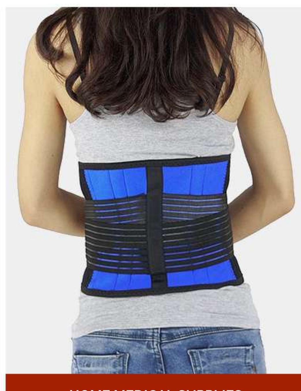
HOME MEDICAL SUPPLIES