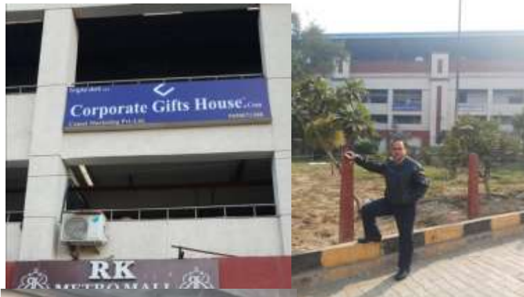
Delhi Office Exterior