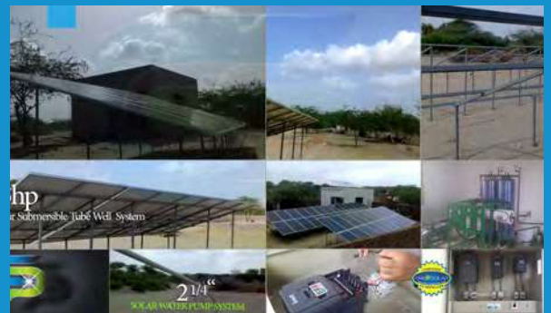
SOLAR RO PLANT (the very first successful project in Pakistan)

PAKSOLAR is a leading vertically integrated solar energy company. Founded in Karachi in 2012 as freelance project consultant and initiator and in 2015 established for own projects. Please visit www.paksolarservices.com to learn more about PAKSOLAR.