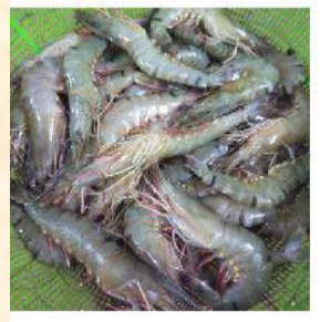
Shrimps & Prawn