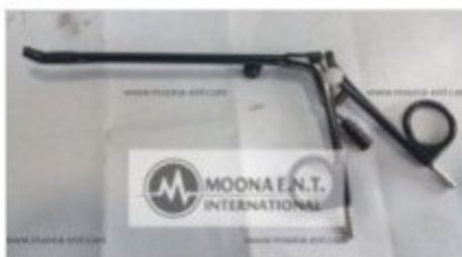
Biopolar Suction, 45 degree upturned, with suction channel, working length 12.5 cm