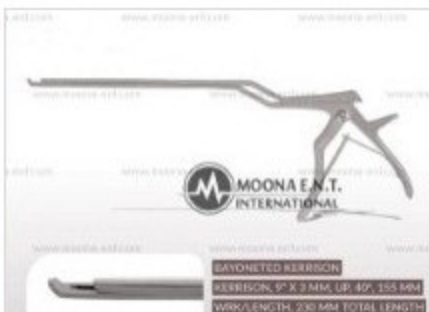
BAYONETED KERRISON Rongeur