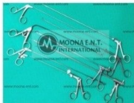
Laparoscopic Surgical Instruments