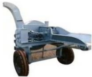
TRACTOR OPERATED CHAFFCUTTER