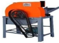
CHAFFCUTTER 5 HP SINGLE BLOWER WITH MOTOR