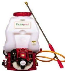
4 STROKE KNAPSACK SPRAYER