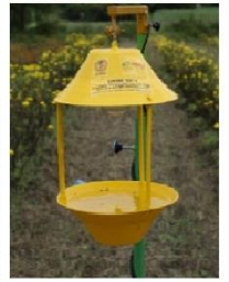
SOLAR TRAP MODEL 3