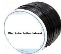
FLAT INLINE LATERAL TUBE