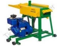
CHAFFCUTTER 3 HP MINI WITH ENGINE