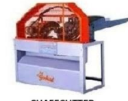
CHAFFCUTTER 2/3 HP FLAT FACE & MOTOR