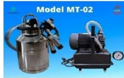
MILKING MACHINE CAPACITY 100 LPM