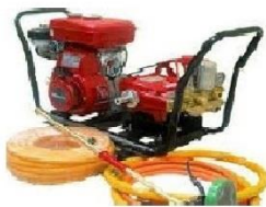
HTP PUMP WITH DEISEL ENGINE