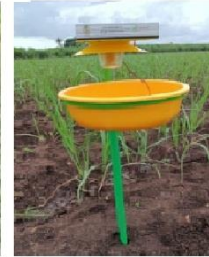
SOLAR TRAP MODEL 2