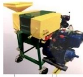
CHAFFCUTTER 3.5 HP, 2 IN 1 WITH ENGINE