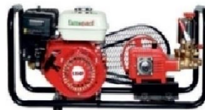
HTP PUMP WITH PETROL ENGINE