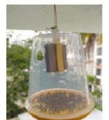
FLY TRAPS FOR FRUITS AND VEGETABLES