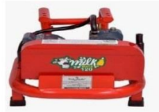
MILKING MACHINE CAPACITY 120 LPM