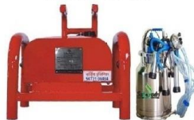
MILKING MACHINE CAPACITY 350 LPM