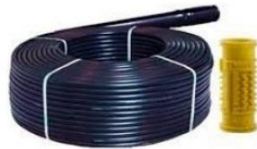
INLINE LATERAL TUBE