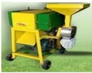
CHAFFCUTTER 3.5 HP, 2 IN 1 WITH MOTOR