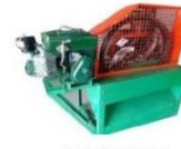
CHAFFCUTTER 3 HP FLAT FACE & ENGINE