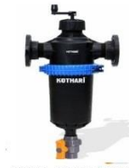
SEMI AUTOMATIC SCREEN FILTER