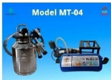
MILKING MACHINE CAPACITY 200 LPM