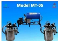
MILKING MACHINE CAPACITY 300 LPM