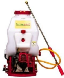
2 STROKE KNAPSACK SPRAYER