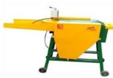
CHAFFCUTTER 2/3 HP MINI WITH MOTOR