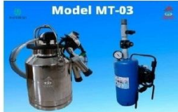
MILKING MACHINE CAPACITY 150 LPM