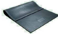
RUBBER CATTLE MAT TRIANGLE