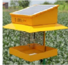
SOLAR TRAP MODEL 1