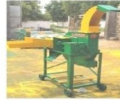
CHAFFCUTTER 3 HP WITH LONG BLOWER