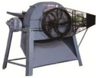
CHAFFCUTTER 3 HP HEAVY DUTY & MOTOR