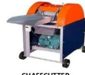
CHAFFCUTTER 2/3 BOX TYPE WITH MOTOR