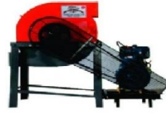
CHAFFCUTTER 5 HP CHAFFCUTTER WITH ENGINE