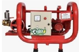
MILKING MACHINE CAPACITY 350 + LPM