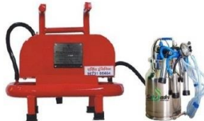
MILKING MACHINE CAPACITY 180 LPM