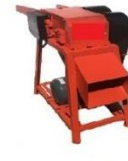
CHAFFCUTTER MINI HIGH SPEED WITH MOTOR