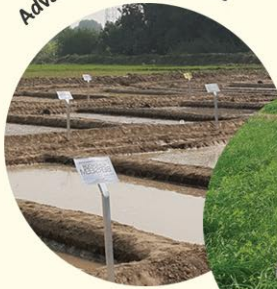
Advance R&D Programs