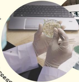
In-house Quality Assessment Lab