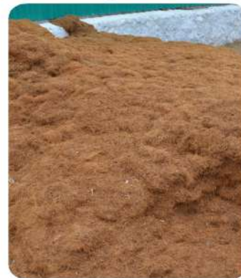
Removal of baby fibre