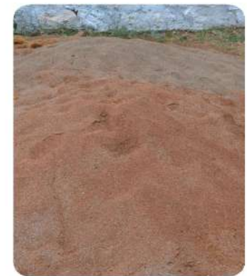
Removal of fine sand