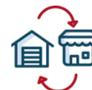
Last Mile Delivery