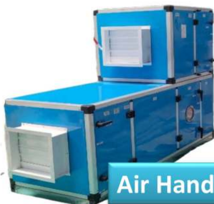
Air Handling Unit

We have been able to successfully establish a glowing reputation in the market as quality conscious supplier of HVAC & R equipment that finds wide usage in varied industry sectors. With our commitment in providing quality products & services, we ensure maximum product value is provided to our customers. In this, our well-defined Quality Management System assists us to stand true to our commitment of delivering quality products.