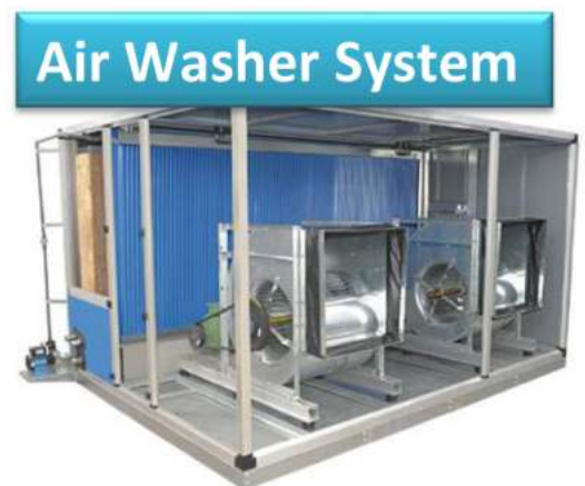
Air Washer System