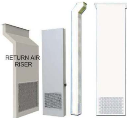
RETURN AIR RISER