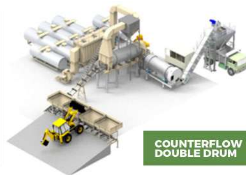
COUNTERFLOW DOUBLE DRUM