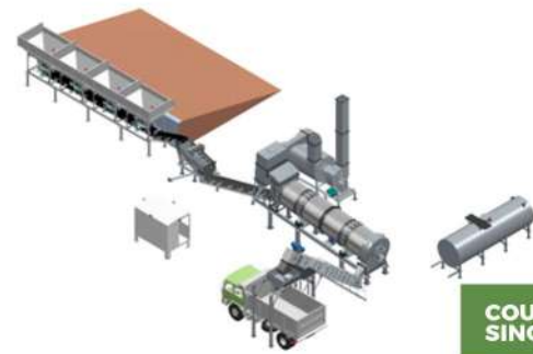
COUNTERFLOW SINGLE DRUM

world class equipments with globally sourced components