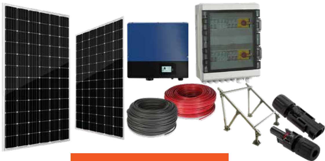
Solar Power System