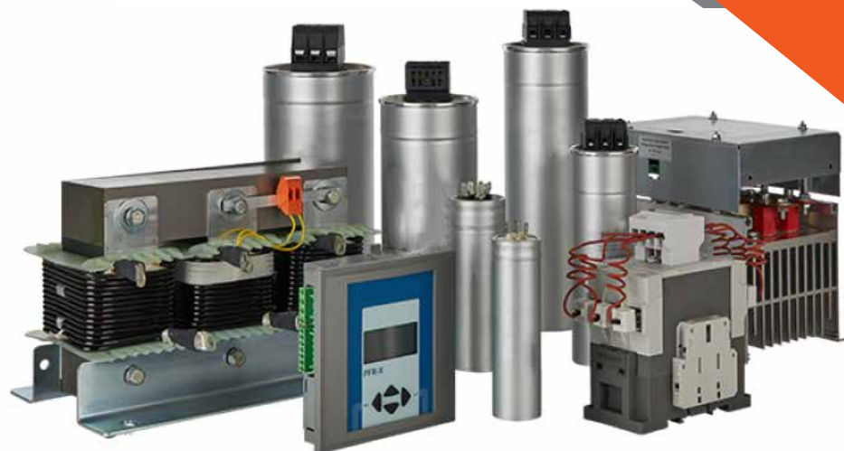
Power Factor correction Equipment