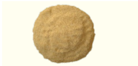
Lemon Peels Teabag Cut

Available Qualities: Coarse Cut, Square Cut, Fine Cut (Tea Bag Cut), Powder, Whole