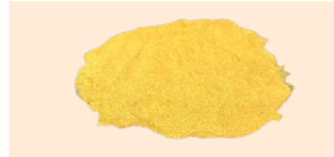
Orange Peels Powder

Available Qualities: Coarse Cut, Square Cut, Fine Cut (Tea Bag Cut), Powder, Whole