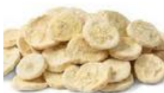
Banana Slices(10 mm) Powder