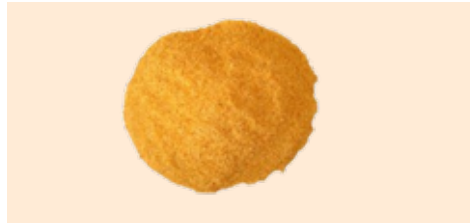
Orange Peels Teabag Cut

Available Qualities: Coarse Cut, Square Cut, Fine Cut (Tea Bag Cut), Powder, Whole