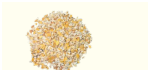
Lemon Peels Coarse Cut

Available Qualities: Coarse Cut, Square Cut, Fine Cut (Tea Bag Cut), Powder, Whole