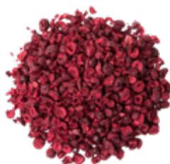
Sour Cherry Slices