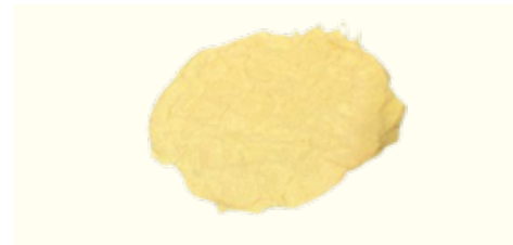
Lemon Peels Powder

Available Qualities: Coarse Cut, Square Cut, Fine Cut (Tea Bag Cut), Powder, Whole