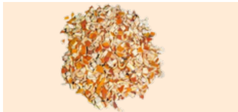
Orange Peels Coarse Cut

Recommended use: Bakery, brewery, beverages, snacks, dressings, dairy formulas, culinary creations