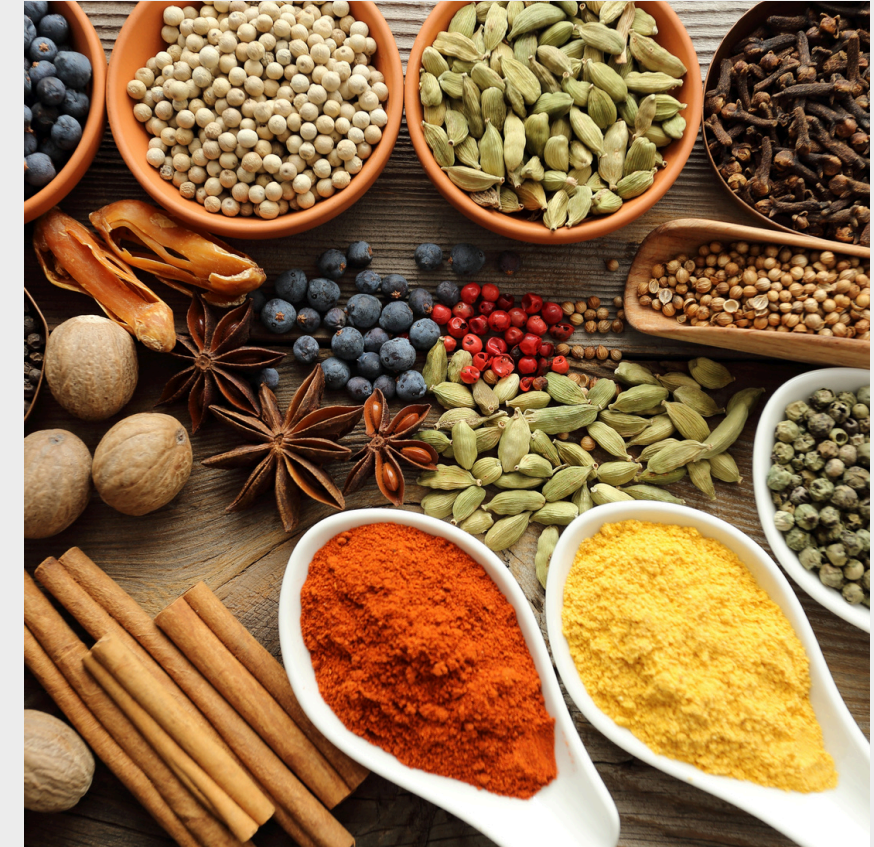
HERBS & SPICES