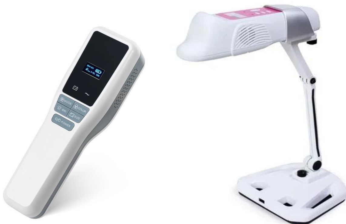
VEIN FINDING MACHINE