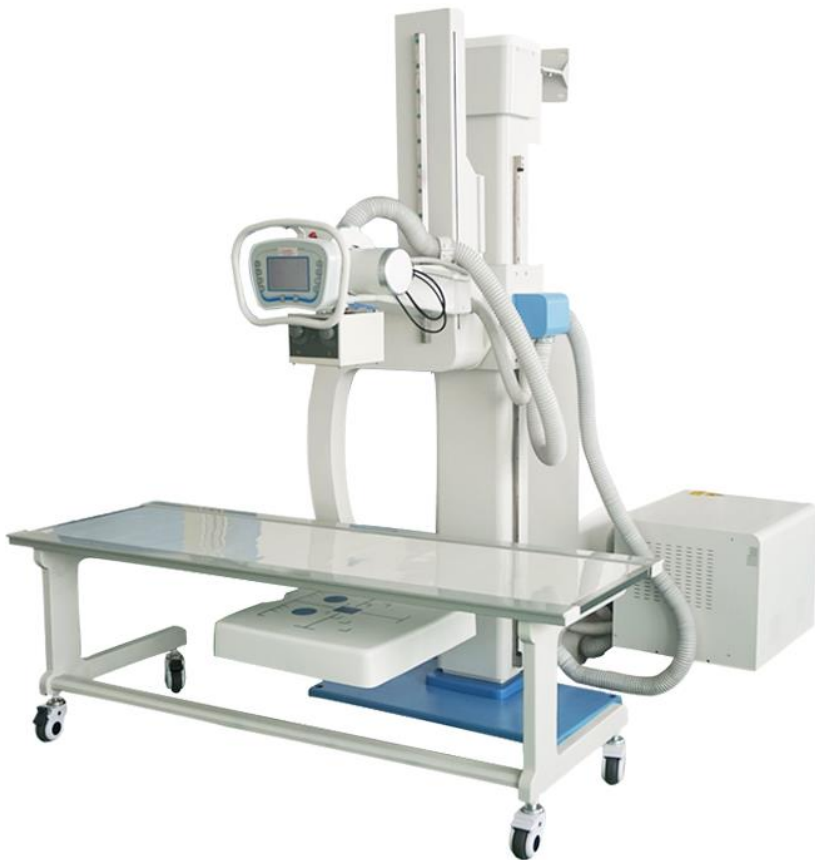
DIGITAL X-RAY MACHINE