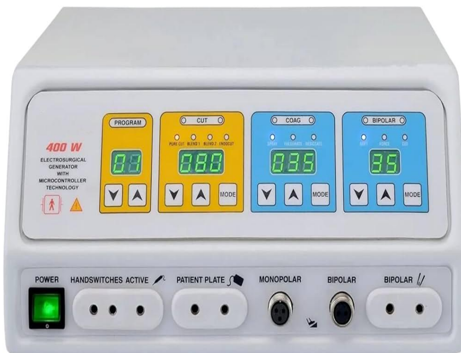
ELECTROCAUTERY (DIATHERMY) MACHINE