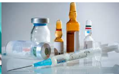
Syringes & Needles