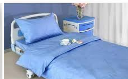
ICU Bed & Hospital Furniture