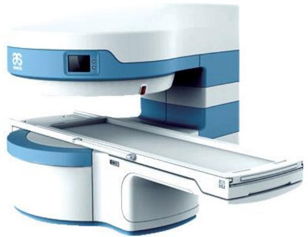
OPEN MRI MACHINE