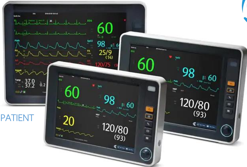
MULTI PARAMETER PATIENT MONITOR