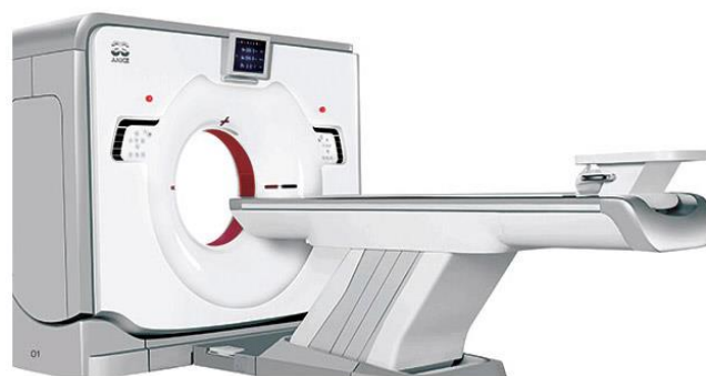
C.T SCAN MACHINE