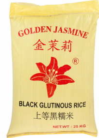
Black Glutinous 黑糯米