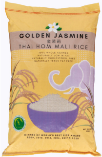
100% Thai Hom Mali 100% 泰国 香米