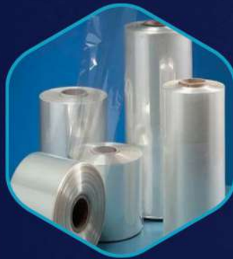
LDPE Shrink Film