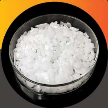
Caustic Soda Flakes