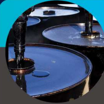
Bitumen (All Grades)