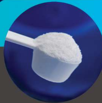
Soda Ash (Light & Dense)