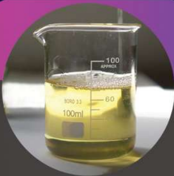
Hydrocarbon (Light & Heavy)