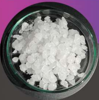
Micro Crystalline Wax