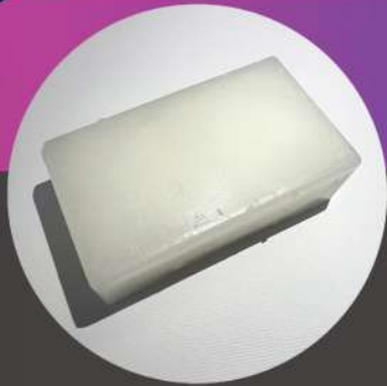
Paraffin Wax (Semi & Fully Refined)