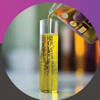
Base Oil (Virgin & Recycled)