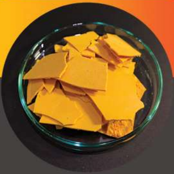
Sodium Sulfide Flakes