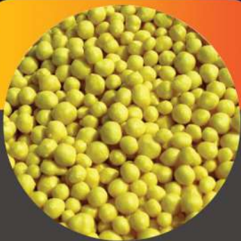
Sulphur (Lump & Granular)