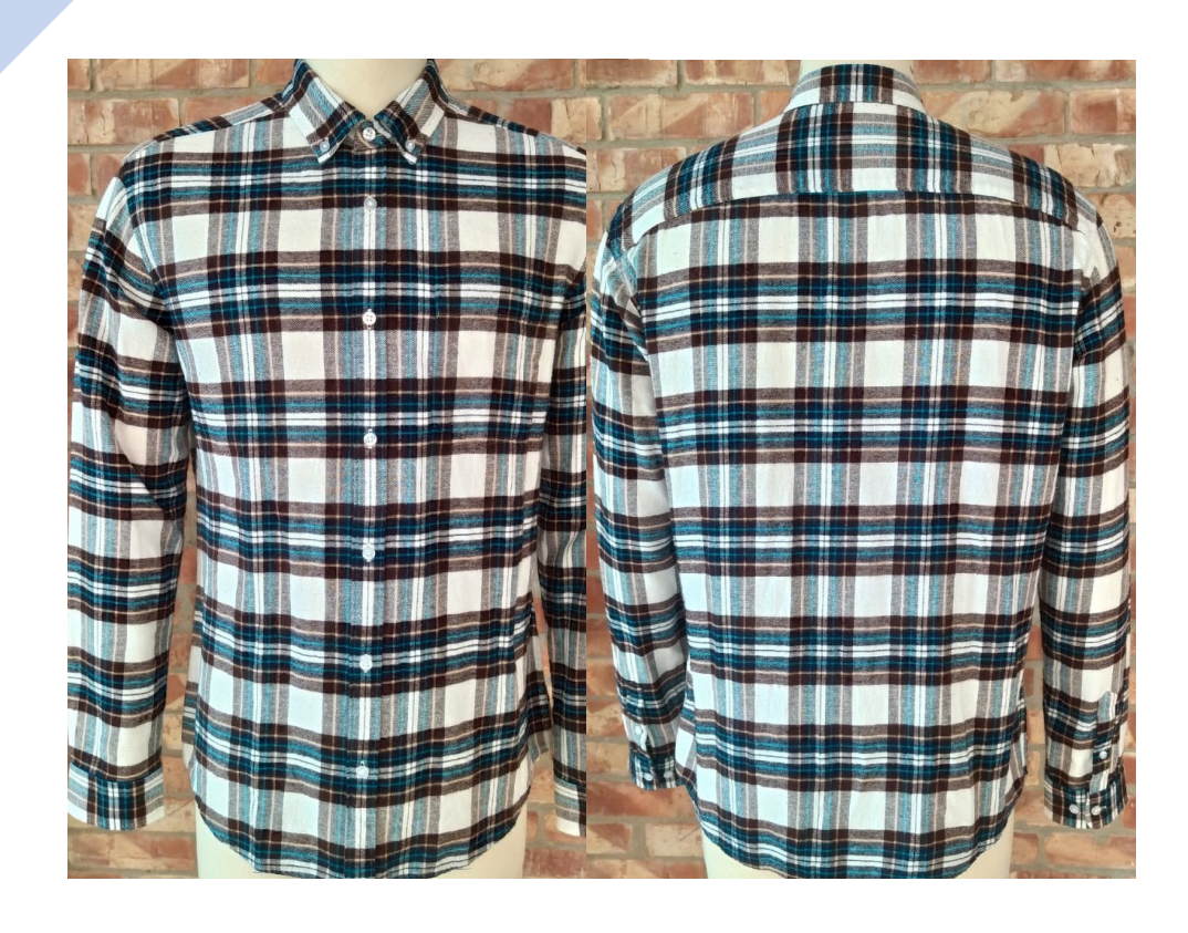
THIS IS SGBD Classic Flannel Check 100% Cotton Y/D 160 gms Both side Brushed Garment Washed