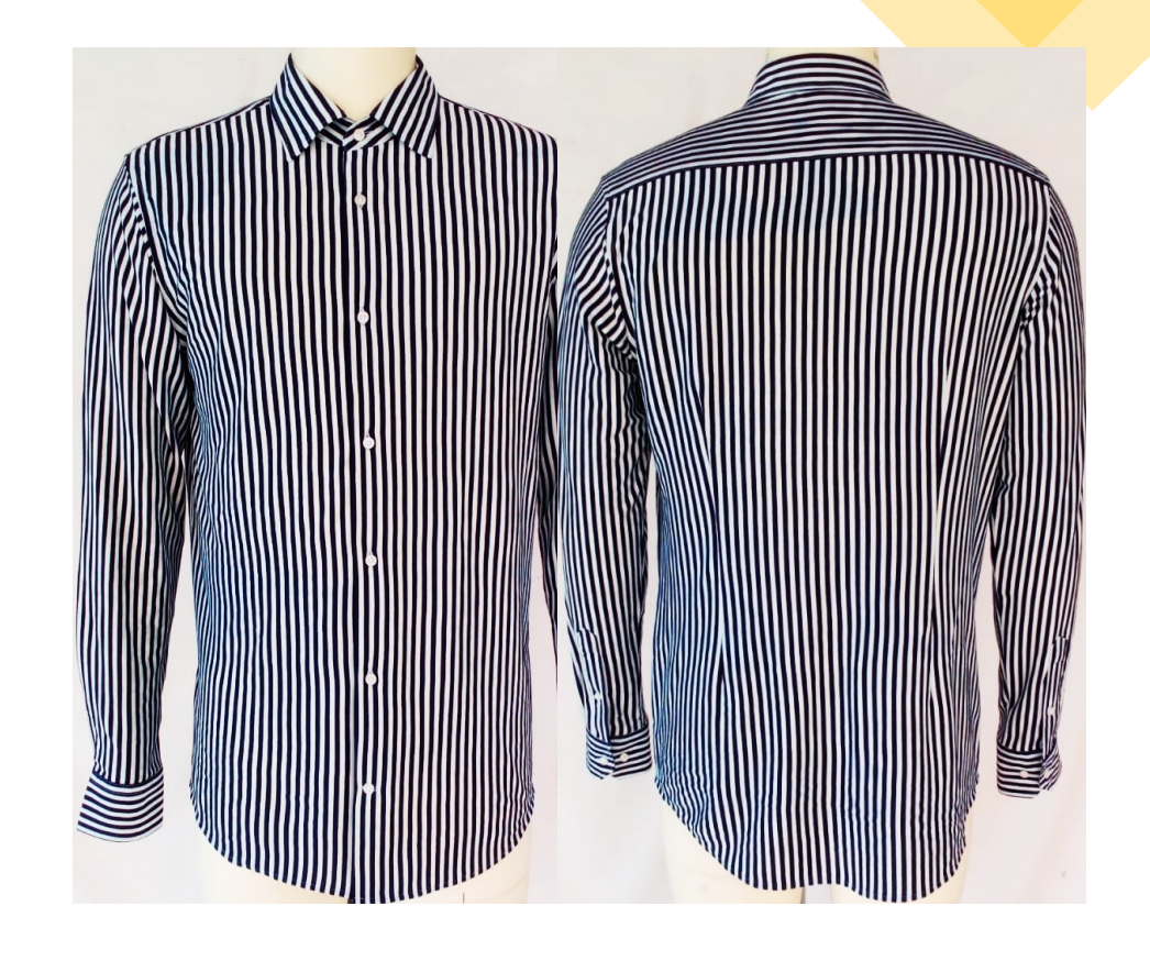
THIS IS SGBD Classic Knitted Shirt 50% Cotton 50% Poly Yarn Dyed Single Jersey

GSM- 160 gms Wash- Heavy Bleach Western Pocket and Yoke