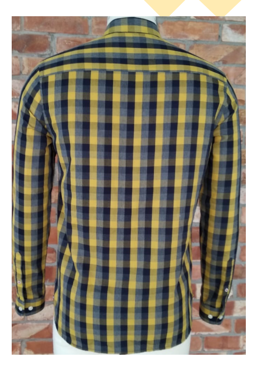
THIS IS SGBD CLASSIC SHIRT 100% cotton / 40x40/120x80