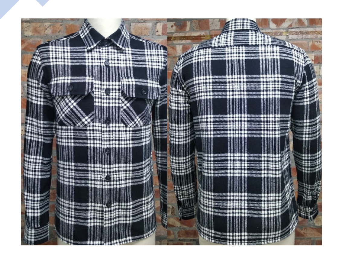
THIS IS SGBD Classic Heavy Flannel 100% Cotton Y/D 245 gms Heavy Brushed , Garment Washed