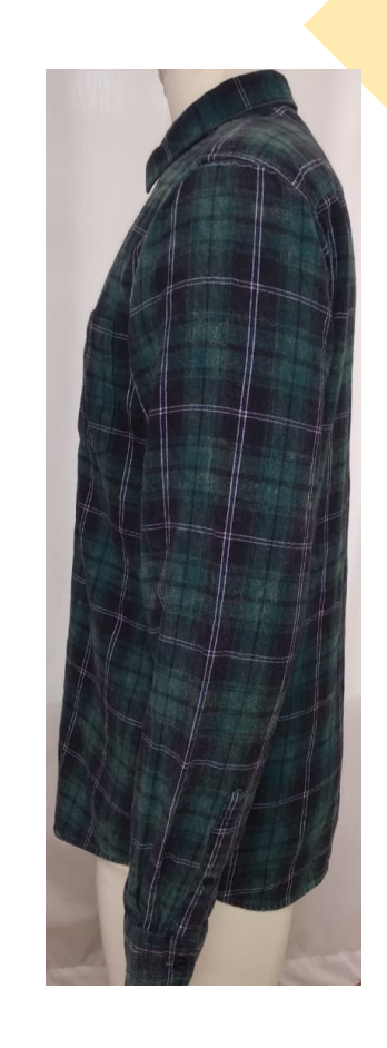
THIS IS SGBD CLASSIC SHIRT