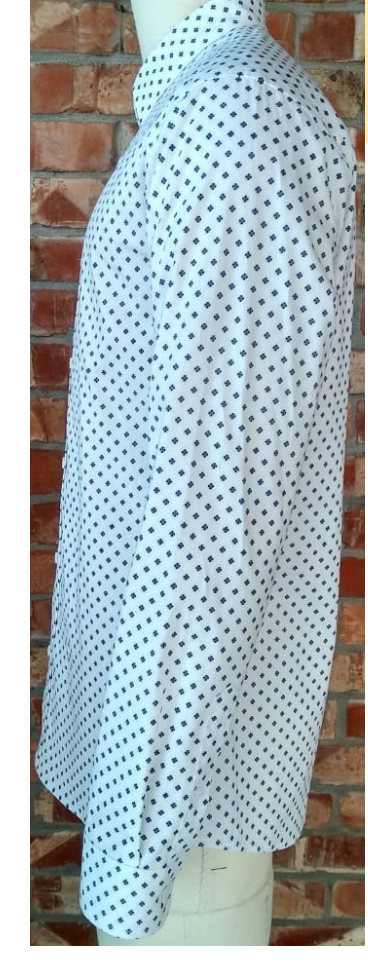
THIS IS SGBD Classic AOP 100% Cotton AOP 120 gms Garment Washed