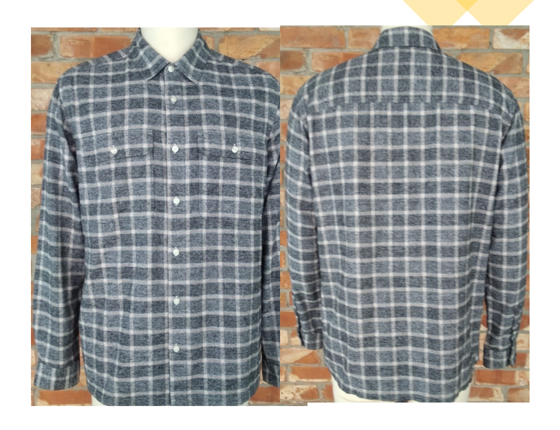
THIS IS SGBD Classic Grindle Check 100% Cotton Y/D 190 gms Light Peached, Garment Washed