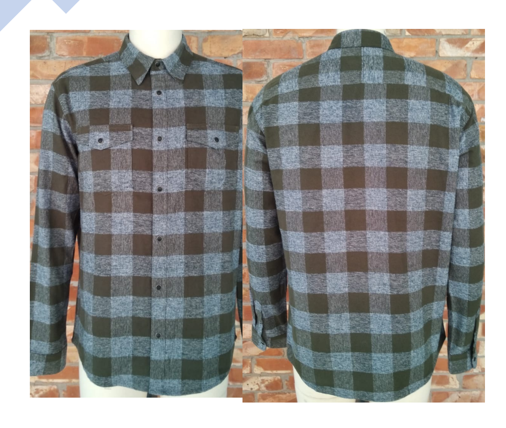
THIS IS SGBD Classic Grindle Check 100% Cotton Y/D 190 gms Light Peached, Garment Washed