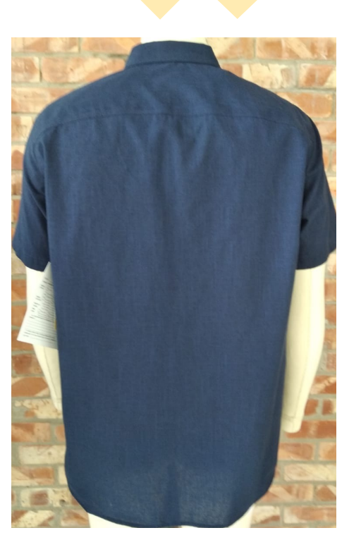
THIS IS SGBD Classic Chambery 100% Cotton Chambray Both side brushed