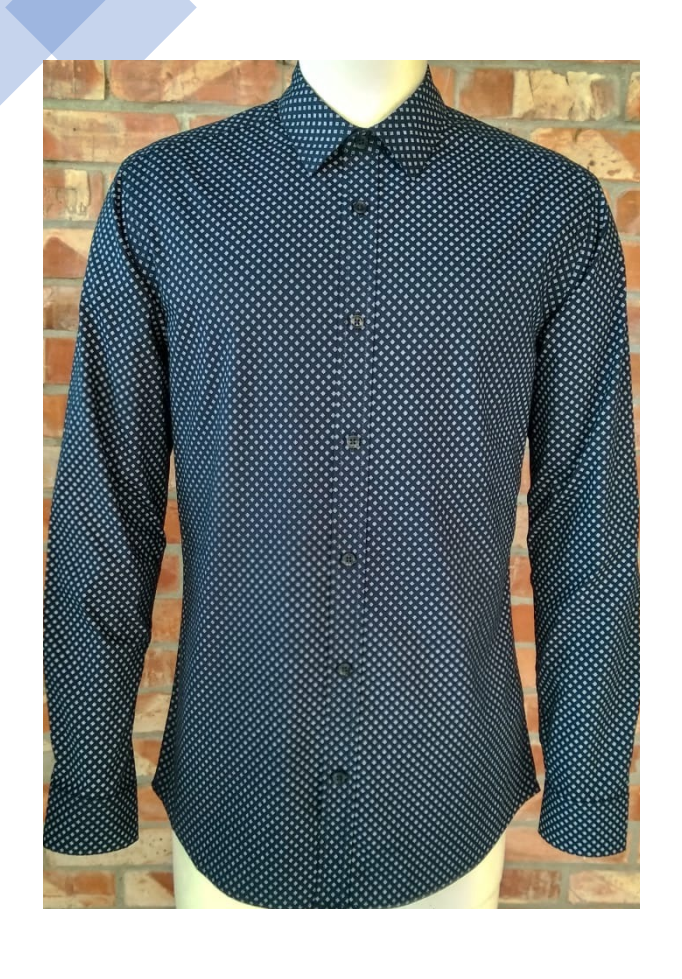
THIS IS SGBD Classic AOP 100% Cotton AOP 120 gms Garment Washed