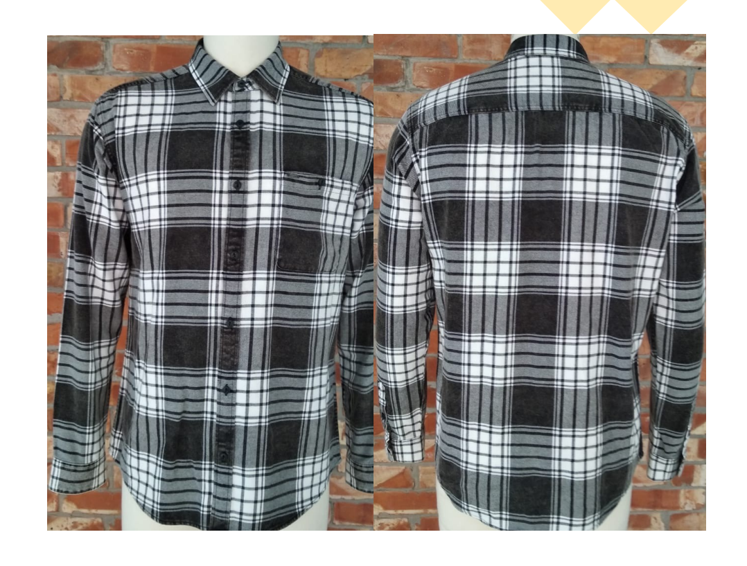
THIS IS SGBD Classic Flannel Check 100% Cotton Y/D 160 gms Both side Brushed Garment Washed