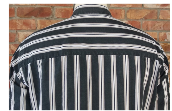
THIS IS SGBD Classic Stripe 100% Cotton Y/D 160 gms Both side Brushed Garment Washed