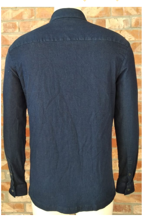
THIS IS SGBD Classic Flannel 100% Cotton fennel Both side brushed