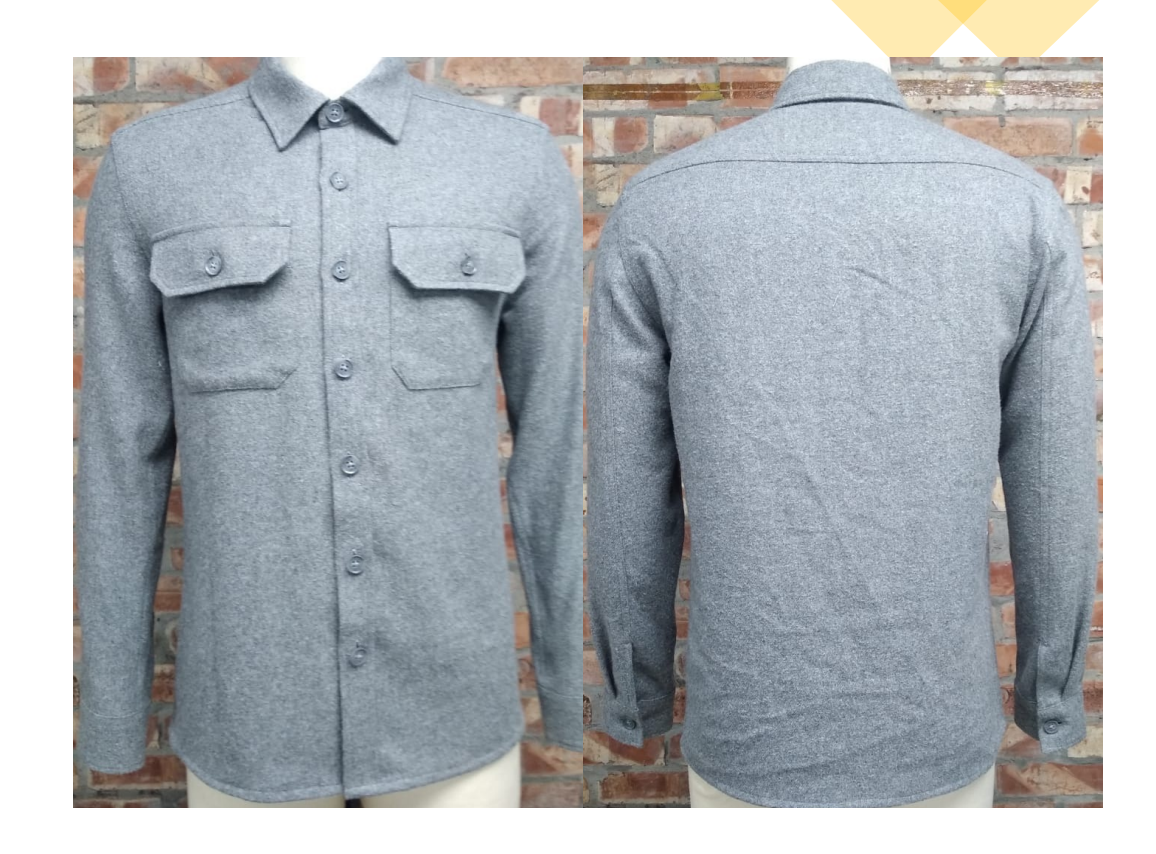
THIS IS SGBD Classic Heavy Flannel 100% Cotton Y/D, 245 gms Heavy Brushed, Garment Washed