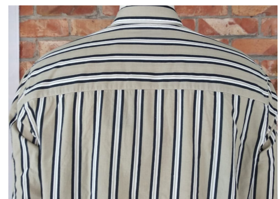
100% Cotton Y/D 160 gms Both side Brushed Garment Washed