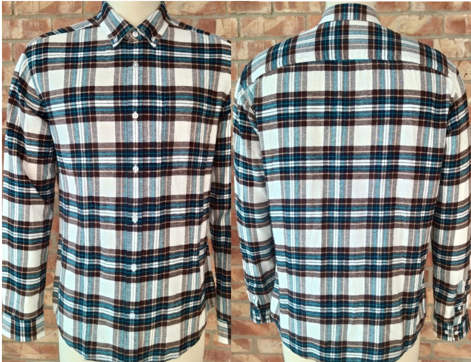
THIS IS SGBD Classic Flannel Check 100% Cotton Y/D 160 gms Both side Brushed Garment Washed