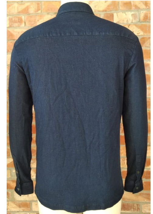
THIS IS SGBD Classic Flannel 100% Cotton fannel Both side brushed