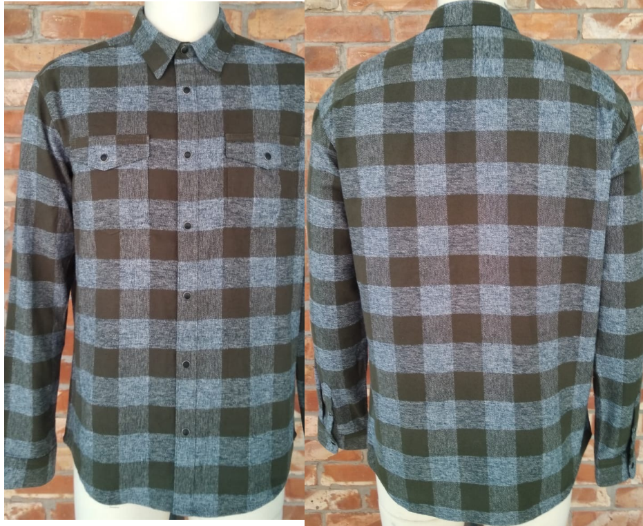
THIS IS SGBD Classic Grindle Check 100% Cotton Y/D 190 gms Light Peached , Garment Washed