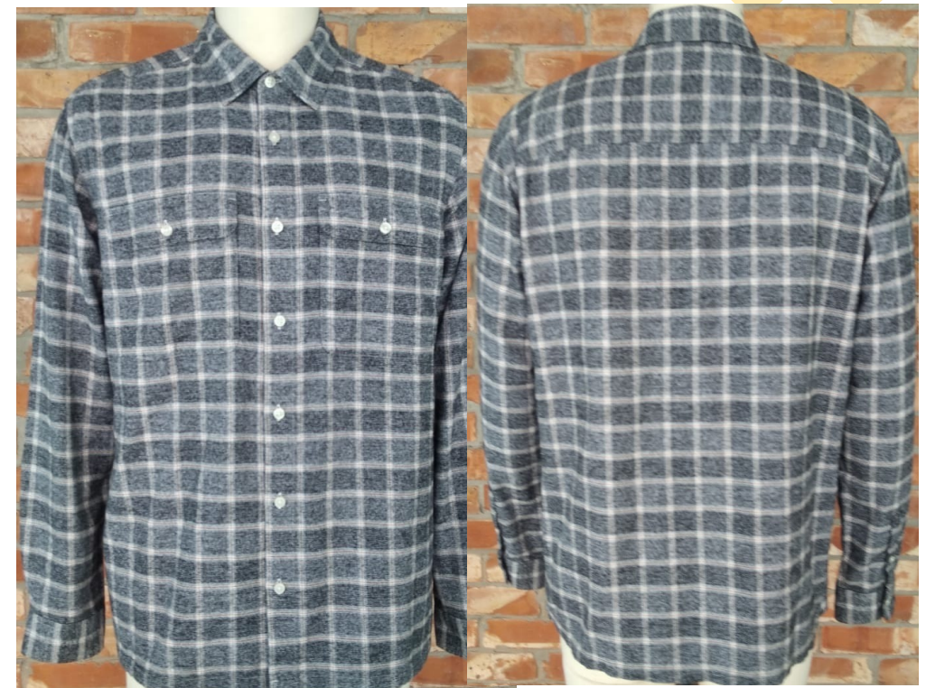
THIS IS SGBD Classic Grindle Check 100% Cotton Y/D 190 gms Light Peached , Garment Washed