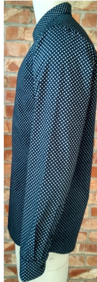
THIS IS SGBD Classic AOP 100% Cotton AOP 120 gms Garment Washed