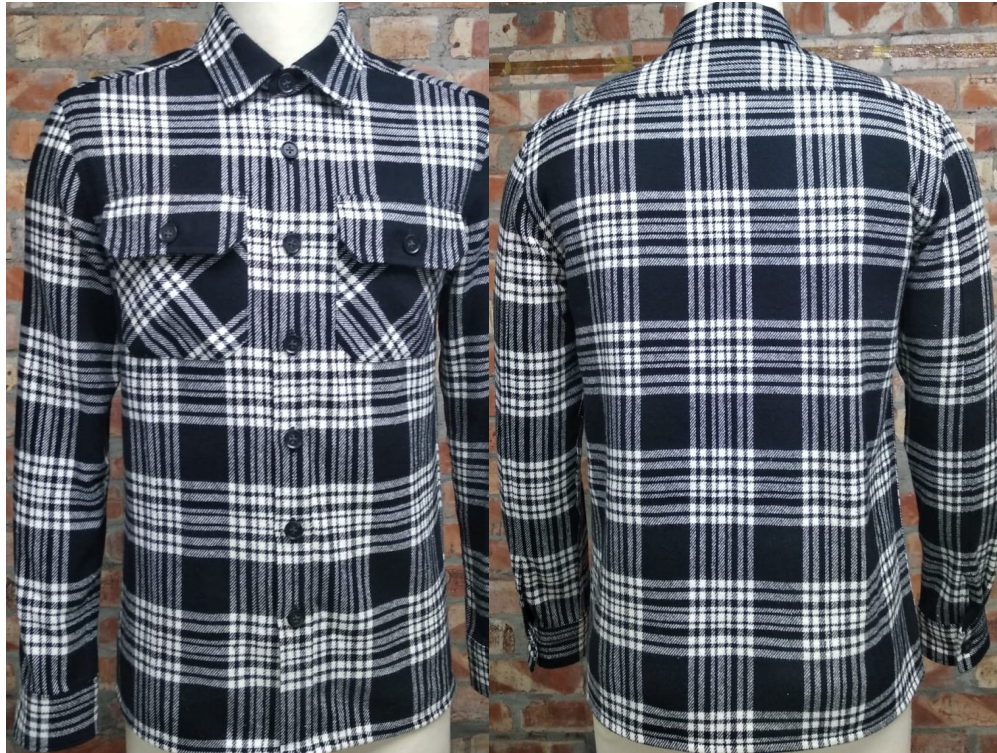
THIS IS SGBD Classic Heavy Flannel 100% Cotton Y/D 245 gms Heavy Brushed , Garment Washed