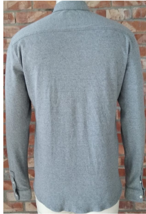
THIS IS SGBD Classic Flannel 100% Cotton fannel Both side brushed