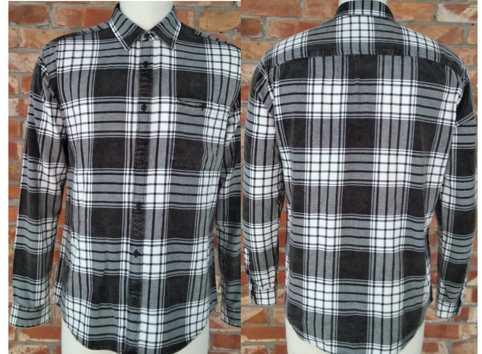
THIS IS SGBD Classic Flannel Check 100% Cotton Y/D 160 gms Both side Brushed Garment Washed