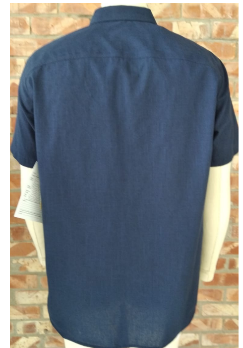
THIS IS SGBD Classic Chambray 100% Cotton Chambray Both side brushed