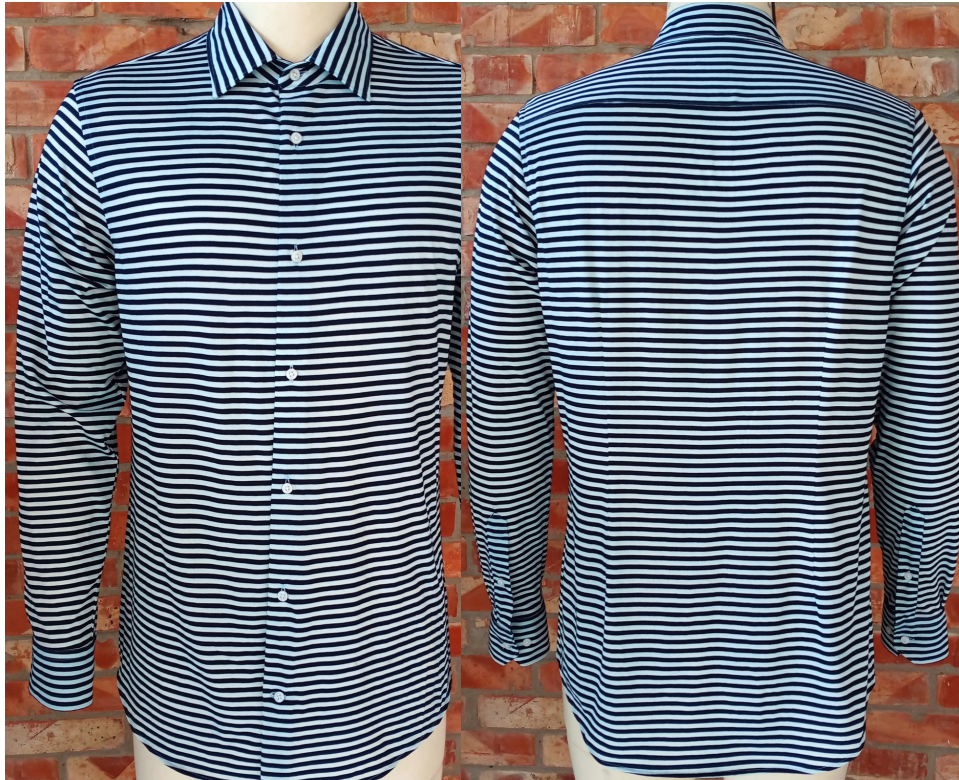
THIS IS SGBD Classic Knitted Shirt 50% Cotton 50% Poly Yarn Dyed Single Jersey GSM- 160 gms Wash- Heavy Bleach Western Pocket and Yoke