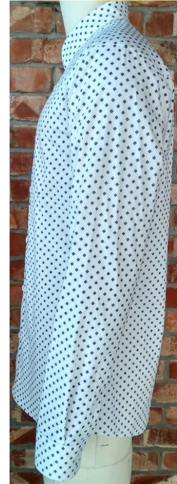
THIS IS SGBD Classic AOP 100% Cotton AOP 120 gms Garment Washed