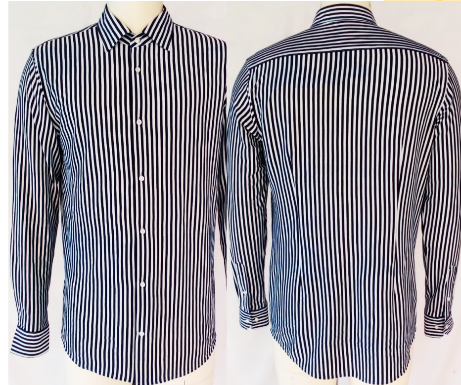
THIS IS SGBD Classic Knitted Shirt 50% Cotton 50% Poly Yarn Dyed Single Jersey GSM- 160 gms Wash- Heavy Bleach Western Pocket and Yoke