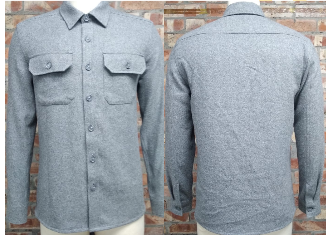
THIS IS SGBD Classic Heavy Flannel 100% Cotton Y/D, 245 gms Heavy Brushed , Garment Washed