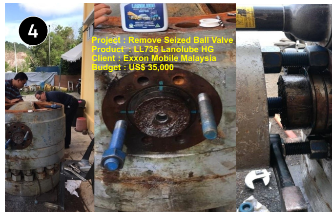
Lanolube HG735 used to release the seized ball and release the bearing.

Project : Remove Seized Ball Valve Product : LL735 Lanolube HG Client : Exxon Mobile Malaysia Budget : US$ 35,000