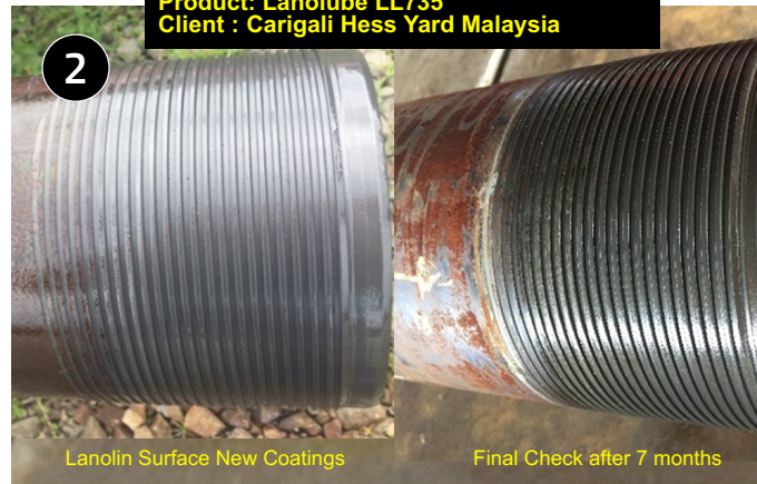
Drill thread cap removed monthly checks for corrosion. No visual signs after 7 months.

Project : Drill Thread Protection in Storage Product: Lanolube LL735 Client : Carigali Hess Yard Malaysia