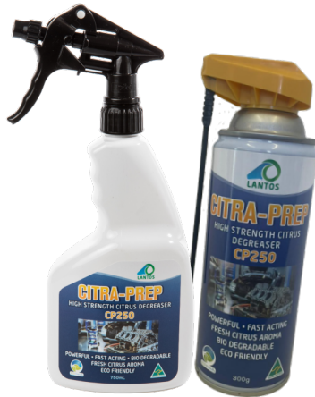
Cleaner | Degrease

Citra-Prep CP250 as Quick Break Degreaser is an industrial versatile cleaning solution suitable for cleaning electrical components, motors, windings, and contaminants like silicon, tar, bitumen, and waxes. It is safe for aluminium alloys and stainless steel and separates oil from water, making it easy to recover.