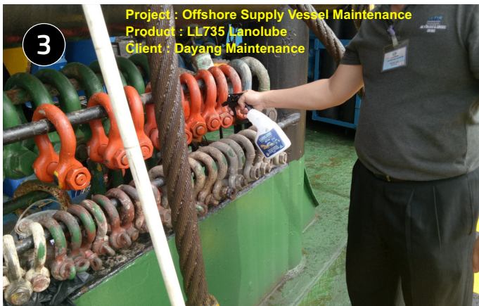
Lanolube HG735 used on the oil rig support vessel (regular maintenance)

Project : Offshore Supply Vessel Maintenance Product : LL735 Lanolube Client : Dayang Maintenance