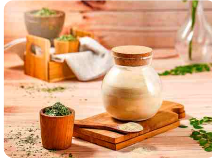
Moringa Leaf Powder Extract