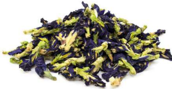
Dried Butterfly Pea Flowers

Butterfly Pea has been consumed for centuries as a memory enhancer, brain booster, anti-stress and calmative agent. Known for its luminous indigo color, it has traditionally been used as a vegetable in cooking, to color deserts or to make a strikingly vibrant colored tea.