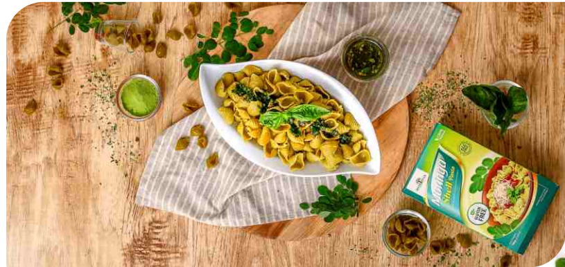
Moringa Shell Pasta