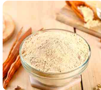
Moringa Seed Cake Fine Powder