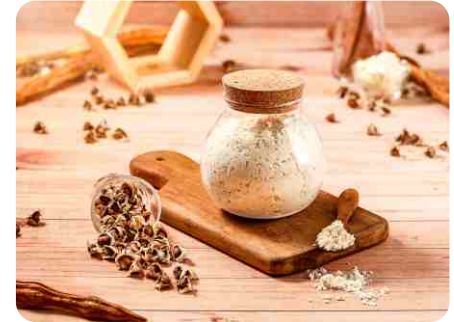
Moringa Seed Powder Extract