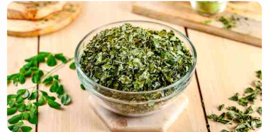
Moringa Dried Leaves