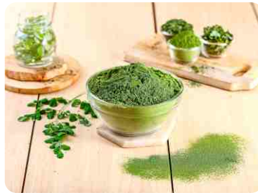
Moringa Leaf Powder 200 mesh