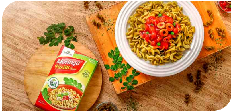
Moringa Fussili Pasta