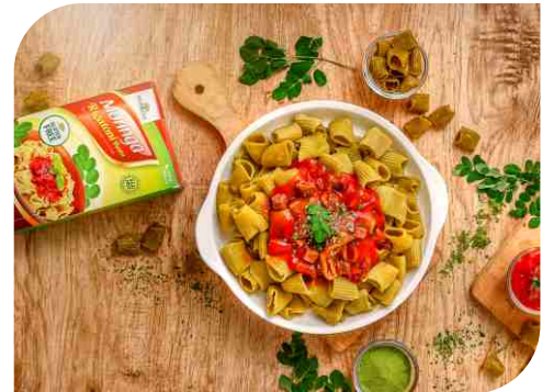
Moringa Rigatoni Pasta