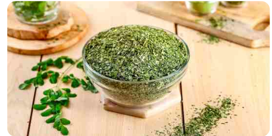
Moringa Leaves Teacut