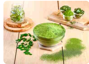
Moringa Leaf Powder 500 mesh