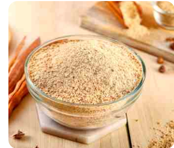
Moringa Seed Cake Powder