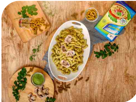
Moringa Macaroni Pasta