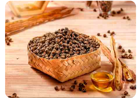
Moringa Seeds Without Wings