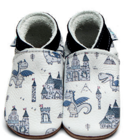
Dragon Colour: White ID: 4398