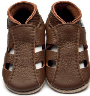
Colour: Chocolate Plain: 0266 Milky Way: 2615 Moccasin: 2484 Sandal: 4088