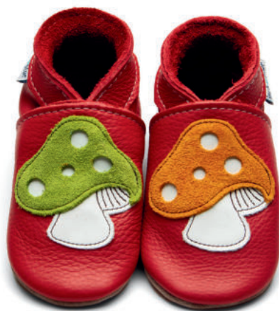
Toadstool Colour: Red ID: 4376