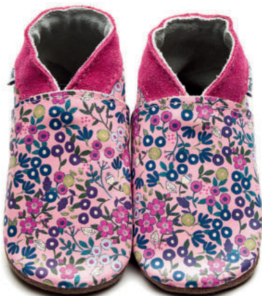
Wild Meadon Colour: Pink ID: 4210