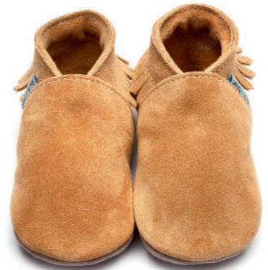
Colour: Tan Suede Plain: 3340 Milky Way: 3343 Moccasin: 1733 Sandal: 4404