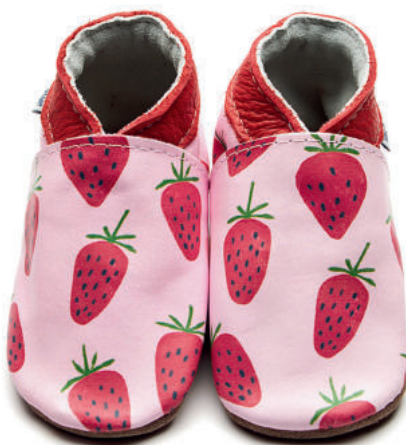
Merry Berry Colour: Pink ID: 4214