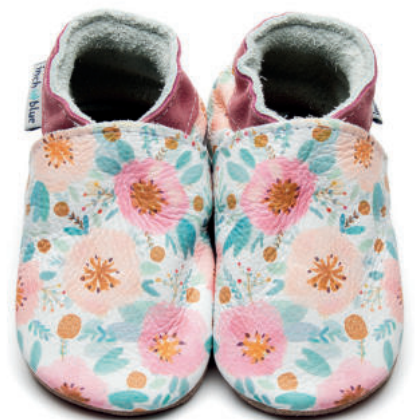
Wild Roses Colour: White ID: 3966