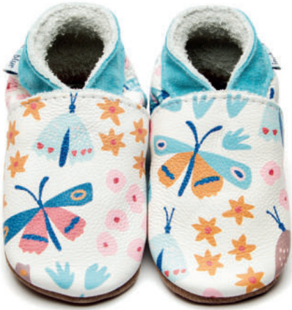
Gypsy Colour: White ID: 4062