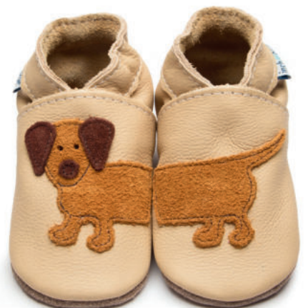
Dash Colour: Cream ID: 2935