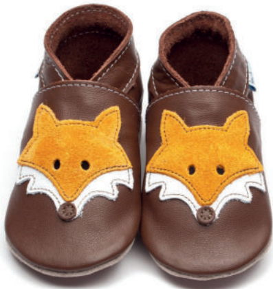
Mr Fox Colour: Chocolate ID: 2634