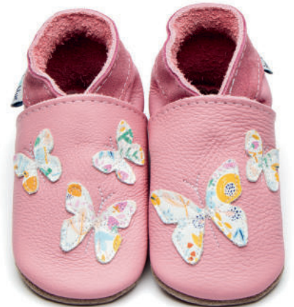
Kaleidoscope Colour: Baby Pink ID: 4171