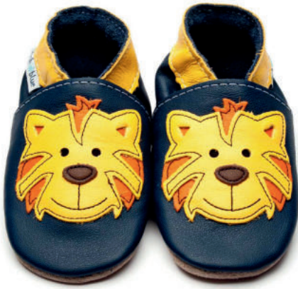
Tommy Tiger Colour: Navy ID: 3635