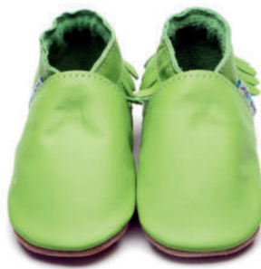
Colour: Green Plain: 0802 Milky Way: 2621 Moccasin: 2682 Sandal: 4410