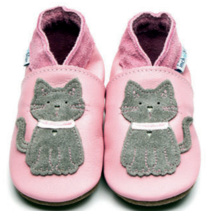
Meeow Colour: Baby Pink ID: 2124