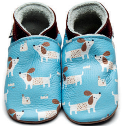
Scout Colour: Blue ID: 4400