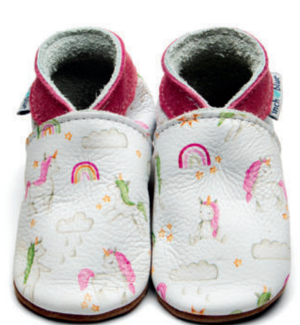
Little Unicorn Colour: White ID: 4397