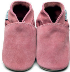
Colour: Dusky Pink Plain: 4243 Milky Way: 4240 Moccasin: 4246 Sandal: 4408