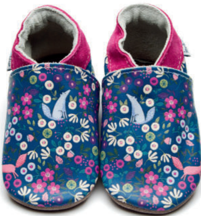
Meadow Fox Colour: Blue ID: 3984