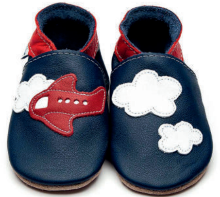
Aeroplane Clouds Colour: Navy ID: 3637