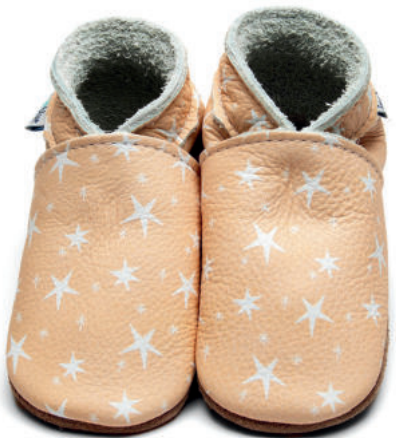
Celestial Colour: Taupe ID: 4394