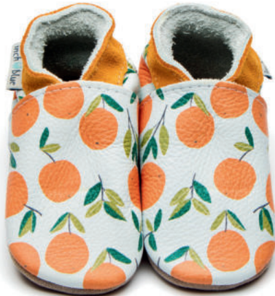
Clementine Colour: Green ID: 3935