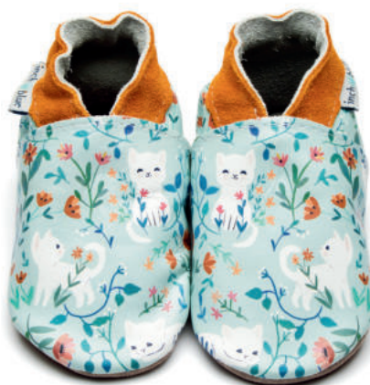
Floral Kitty Colour: Green ID: 4113