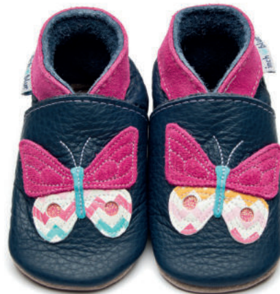
Papillion Colour: Navy ID: 4169