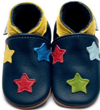
Stardom Colour: Navy ID: 4379