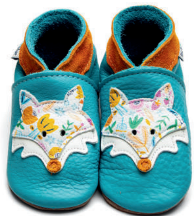
Mr Fox Colour: Turquoise ID: 4377