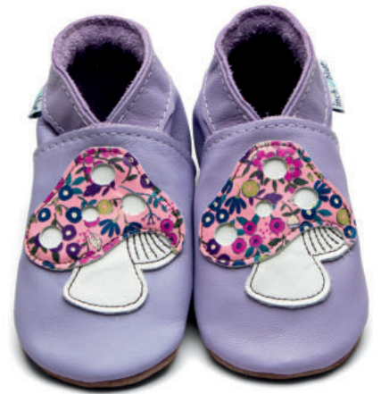
Toadstool Colour: Lilac ID: 4374