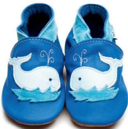
Whale Colour: Blue ID: 2891