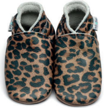
Colour: Leopard Plain: 0129 Milky Way: 3458 Moccasin: 2676 Sandal: 4142