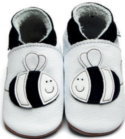
Buzzy Colour: Monochrome ID: 4382