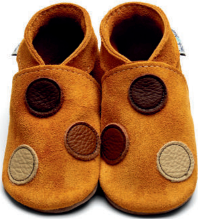
Spots Colour: Tan Suede ID: 4388