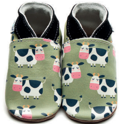
Moo Colour: Green ID: 4207