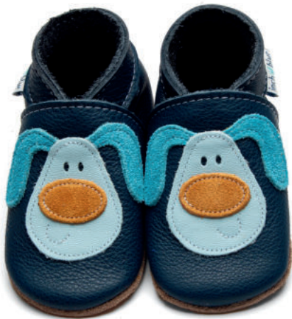
Mucky Puppy Colour: Navy ID: 1349