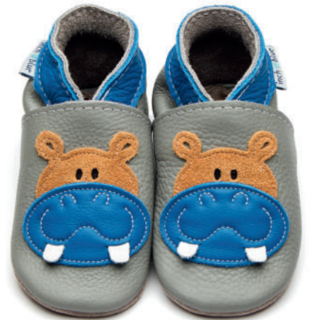
Hippo Colour: Grey ID: 4177