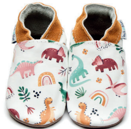
Dino Rainbow Colour: White ID: 4055