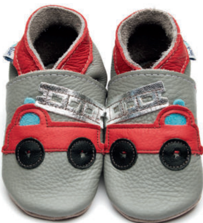
Firetruck Colour: Grey ID: 4175