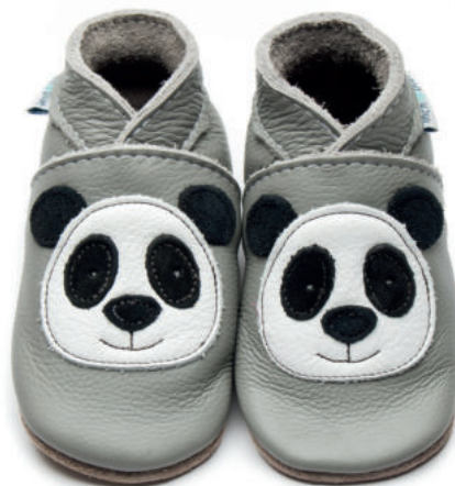
Panda Colour: Grey ID: 2688