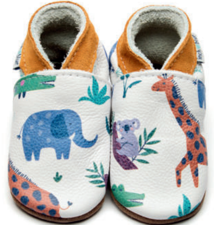
Safari Colour: Off White ID: 4187