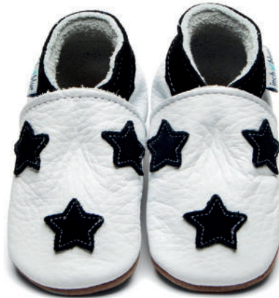
Stardom Colour: Monochrome ID: 4385