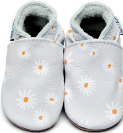
Daisy Colour: Grey ID: 3782