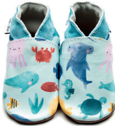
Marine Friends Colour: Blue ID: 4212