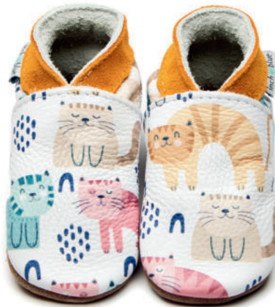
Kitty Club Colour: White ID: 4213