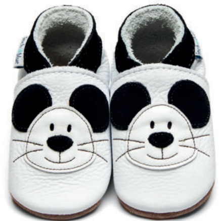
Squeak Colour: Monochrome ID: 4384