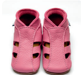
Colour: Rose Pink Plain: 1889 Milky Way: 3001 Moccasin: 1738 Sandal: 4263