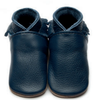
Colour: Navy Plain: 0006 Milky Way: 0121 Moccasin: 1756 Sandal: 3481