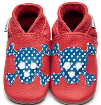
Skull Colour: Red ID: 4166