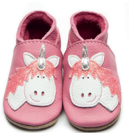
Unicorn Colour: Rose Pink ID: 2880