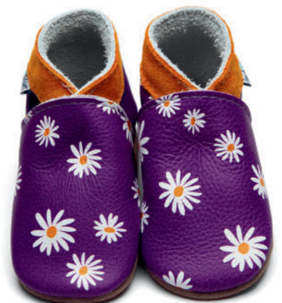
Daisy Colour: Purple ID: 4380