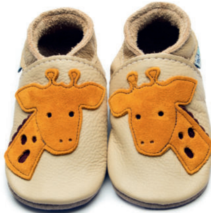
Giraffe Colour: Cream ID: 2727