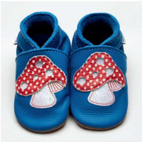
Toadstool Colour: Blue ID: 4366