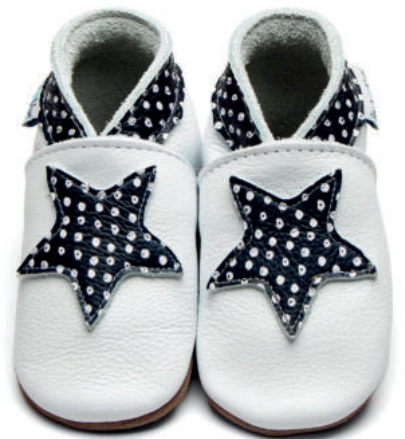
Starry Colour: Monochrome ID: 4383