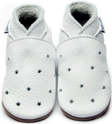
Colour: White Plain: 0001 Milky Way: 0119 Moccasin: 2683 Sandal: 3484