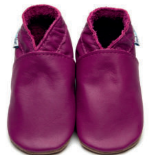
Colour: Grape Plain: 2614 Milky Way: 2785 Moccasin: 2681 Sandal: 4275