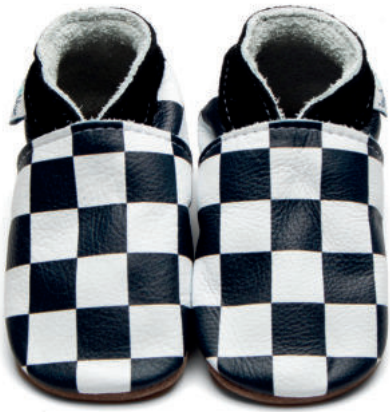
Chequers Colour: Midnight ID: 4321