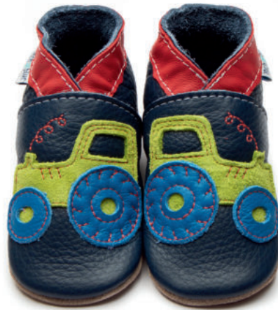
Tractor Colour: Navy ID: 2649