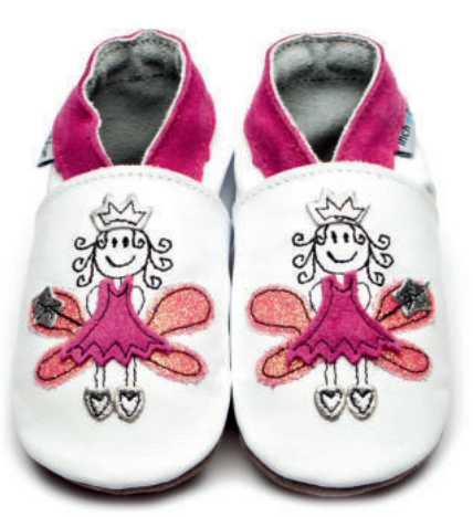
Fairy Princess Colour: White ID: 1435