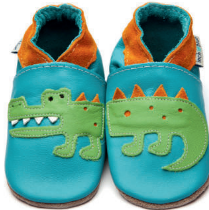
Crocodile Colour: Turquoise ID: 2719