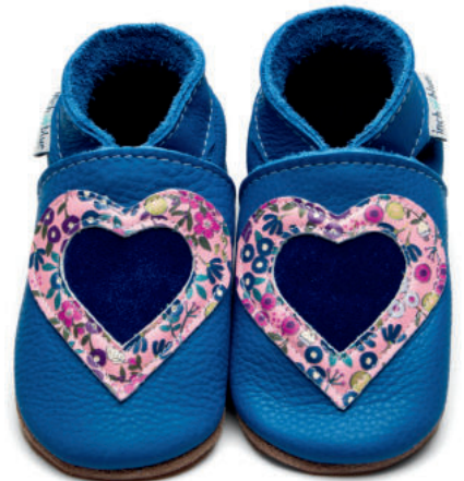
Love Retro Colour: Blue ID: 4378