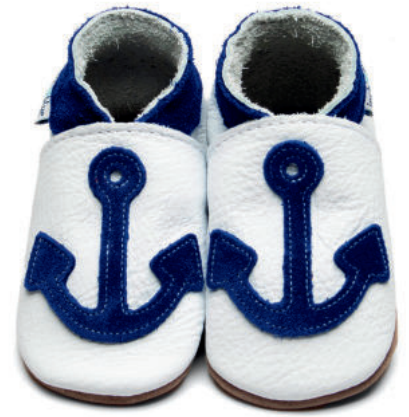
Anchor Colour: White ID: 4390