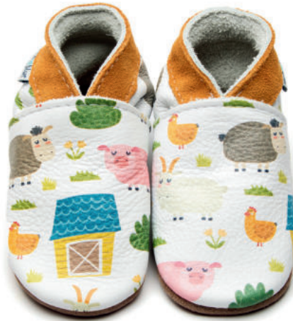
Farmyard Colour: White ID: 4202