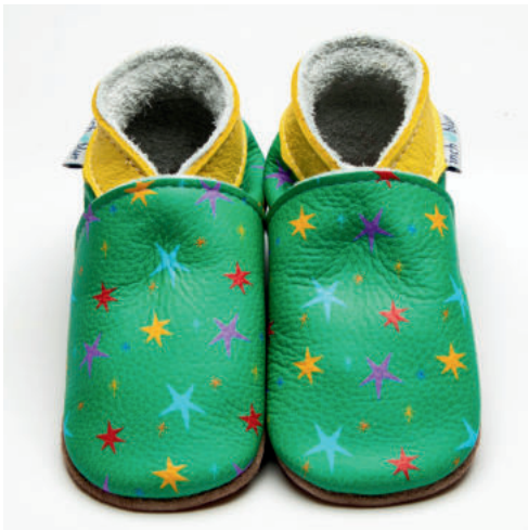
Stargazer Colour: Green ID: 4401