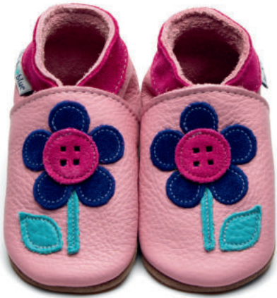
Button Flower Colour: Baby Pink ID: 4372