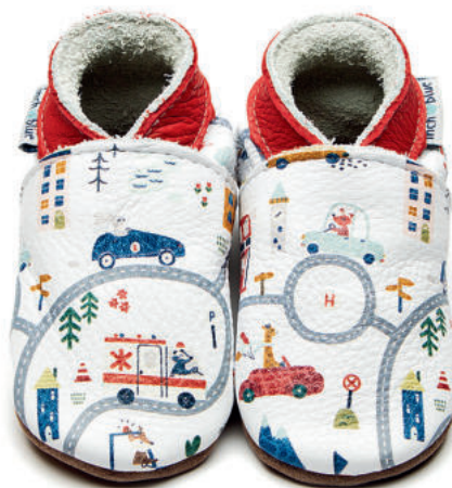
Traffic Jam Colour: White ID: 4194