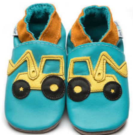
Digger Colour: Turquoise ID: 2742