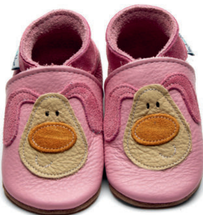
Mucky Puppy Colour: Baby Pink ID: 4371