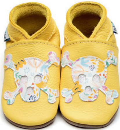
Skull Colour: Yellow ID: 4162