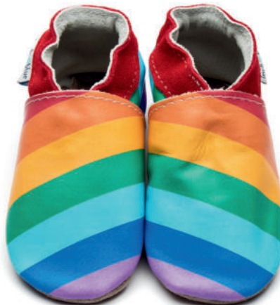
Rainbow Stripes Colour: Multi ID: 3932