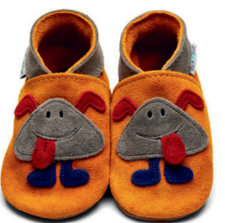
Little Monster Colour: Tangerine Suede ID: 4367