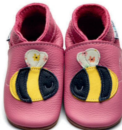
Buzzy Colour: Rose Pink ID: 4373