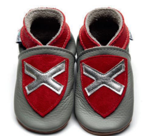
Shield Colour: Grey ID: 4365