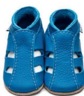
Colour: Blue Plain: 0704 Milky Way: 2618 Moccasin: 1737 Sandal: 3488