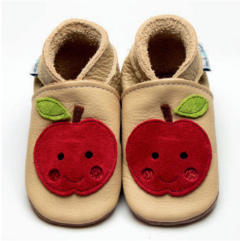
Apple Cheeks Colour: Cream ID: 4364