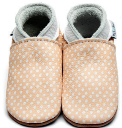
Polka Dot Colour: Taupe ID: 4395