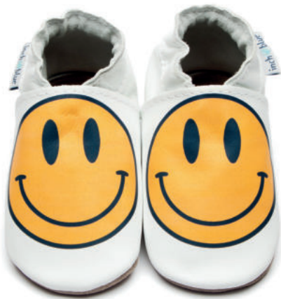
Smiley Colour: White ID: 4077