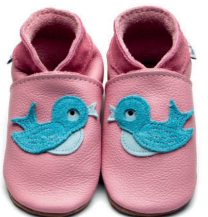
Bluebird Colour: Baby Pink ID: 4368