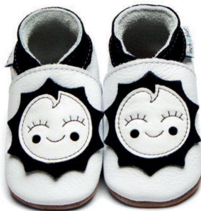
Ray Colour: Monochrome ID: 4387