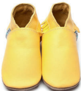
Colour: Yellow Plain: 3183 Milky Way: 3342 Moccasin: 3341 Sandal: 3482