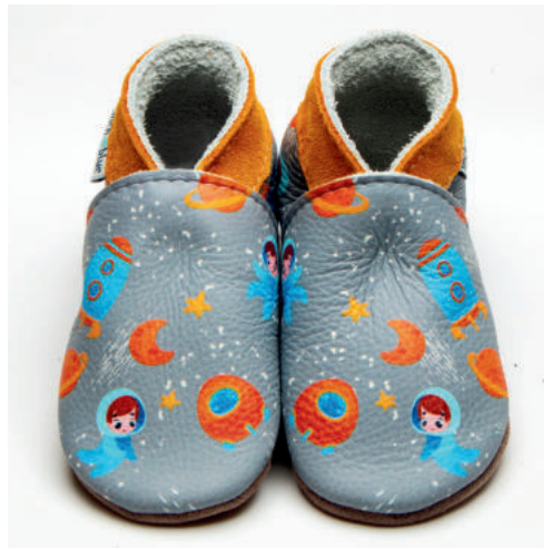
Space Adventurer Colour: Grey ID: 3786