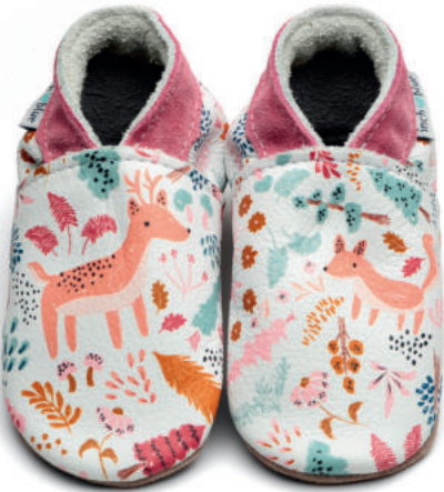
Wild Wood Colour: White ID: 4322