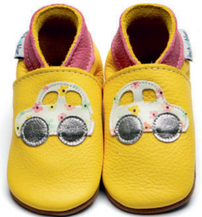
Car Colour: Yellow ID: 4392