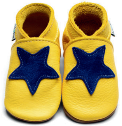
Starry Colour: Yellow ID: 4375