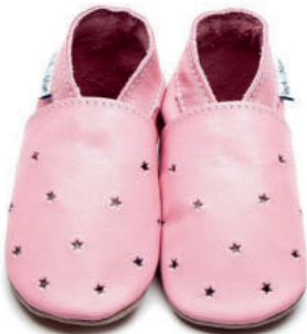
Colour: Baby Pink Plain: 0068 Milky Way: 0166 Moccasin: 1754 Sandal: 3487