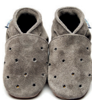
Colour: Grey Suede Plain: 4245 Milky Way: 4242 Moccasin: 4248 Sandal: 4406