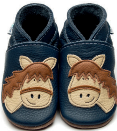
Horse Colour: Navy ID: 3150