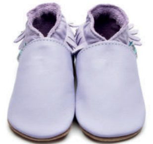
Colour: Lilac Plain: 0286 Milky Way: 0299 Moccasin: 2680 Sandal: 4409