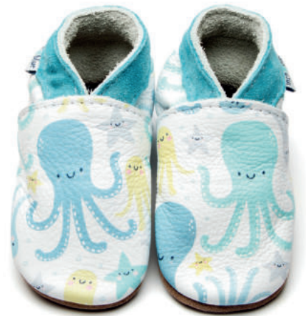
Octavius Colour: White ID: 4058