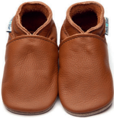
Colour: Caramel Plain: 3181 Milky Way: 3291 Moccasin: 4064 Sandal: 3483