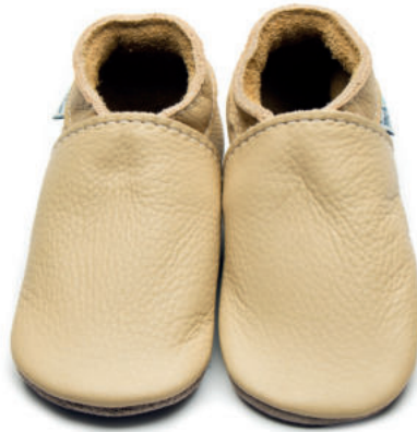
Colour: Cream Plain: 0061 Milky Way: 0287 Moccasin: 1736 Sandal: 3930