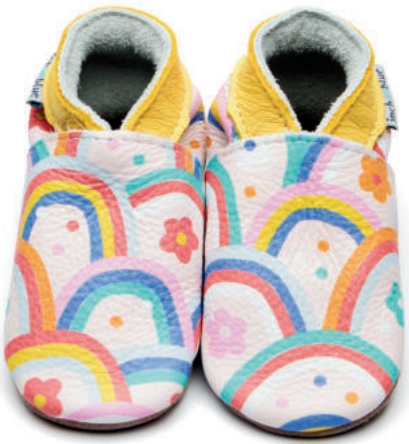
Iris Colour: Pink ID: 4063