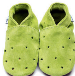
Colour: Citrus Green Suede Plain: 4244 Milky Way: 4241 Moccasin: 4247 Sandal: 4411