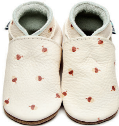
Little Acorn Colour: Off White ID: 3764