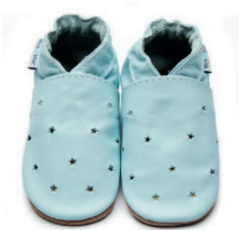
Colour: Baby Blue Plain: 0072 Milky Way: 0165 Moccasin: 1758 Sandal: 4405