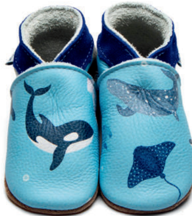
Sea Spirit Colour: Blue ID: 4396