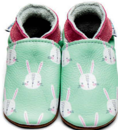
Bella Bunny Colour: Mint ID: 4393