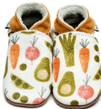
Sweet Peas Colour: White ID: 4117