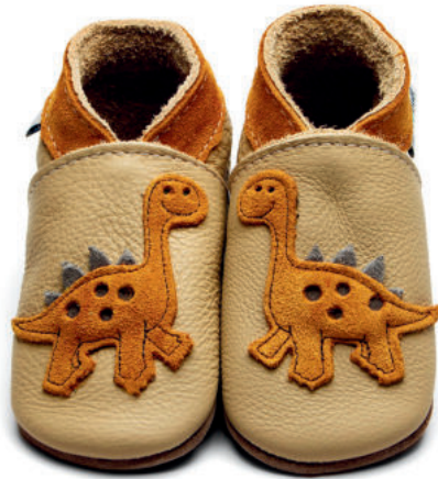
Dino Colour: Cream/Tan ID: 4369