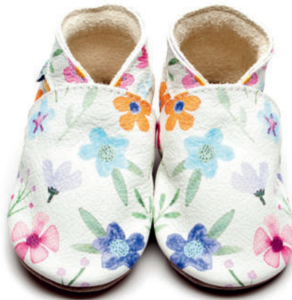
Posy Colour: White ID: 3467