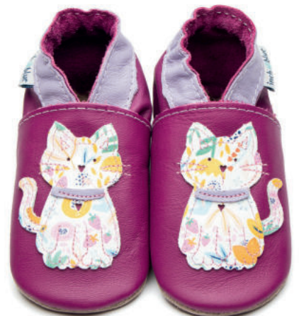
Meeow Colour: Grape ID: 4183