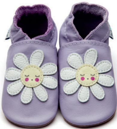
Dozy Daisy Colour: Lilac ID: 4070