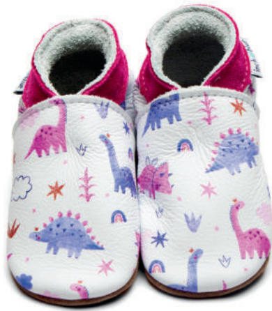
Sweet Dino Colour: White ID: 4403