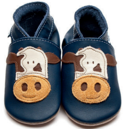
Cow Colour: Navy ID: 3460