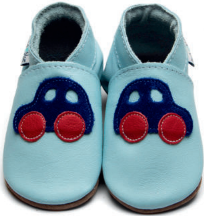
Car Colour: Baby Blue ID: 4391