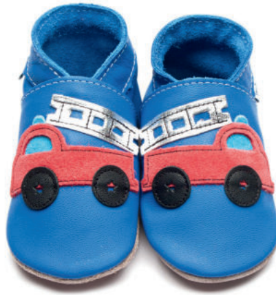
Firetruck Colour: Blue ID: 1367