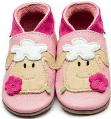
Sheep Colour: Baby Pink ID: 1491