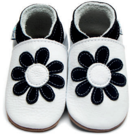
Gerbera Colour: Monochrome ID: 4386