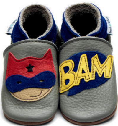
Superhero Colour: Grey ID: 3271