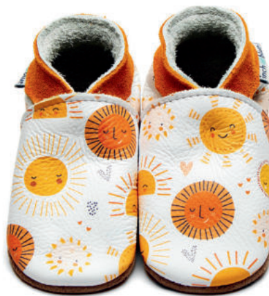
Sunshine Colour: White ID: 4402