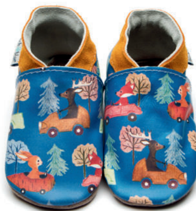
Road Trip Colour: Blue ID: 4104