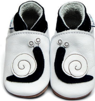
Sammy Snail Colour: Monochrome ID: 4381