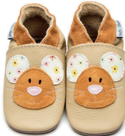
Squeak Colour: Cream ID: 4184