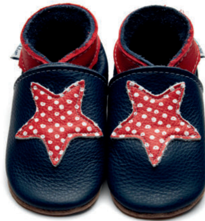
Starry Colour: Navy/Red Spot ID: 4363