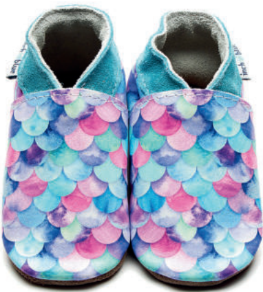
Little Mermaid Colour: Multi ID: 4211