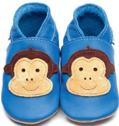
Cheeky Monkey Colour: Blue ID: 0937