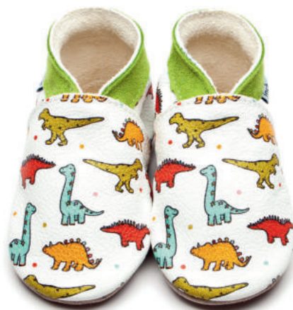
Jurassic Colour: White ID: 3463