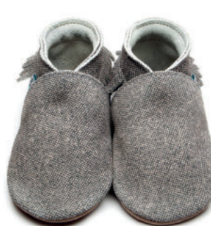
Colour: Denim Plain: 2519 Milky Way: 3453 Moccasin: 2678 Sandal: 4407