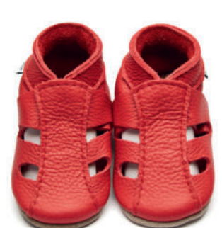
Colour: Red Plain: 0005 Milky Way: 0829 Moccasin: 1753 Sandal: 3480