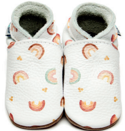
Rainbow Love Colour: White ID: 3771