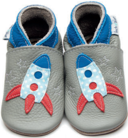
Zoom Colour: Grey ID: 4181