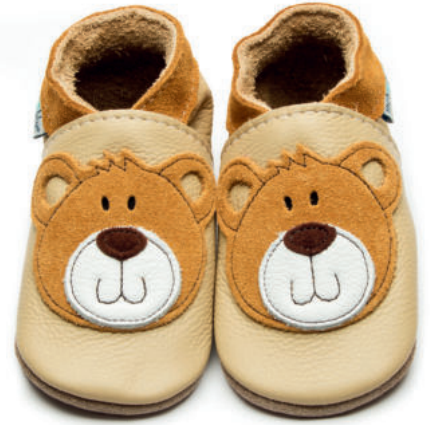
Teddy Colour: Cream ID: 3304