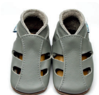
Colour: Grey Plain: 2011 Milky Way: 1867 Moccasin: 2496 Sandal: 3485