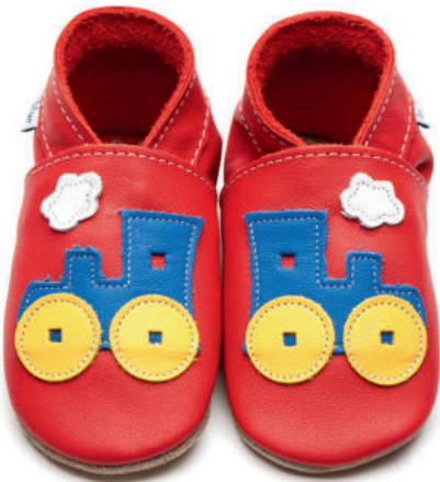
Toot Train Colour: Red ID: 3319