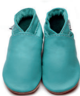
Colour: Turquoise Plain: 0438 Milky Way: 2619 Moccasin: 2679 Sandal: 3486