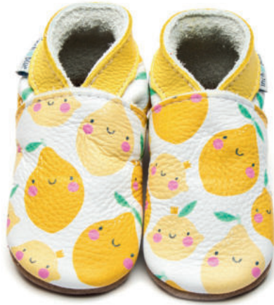
The Lemons Colour: White ID: 4059