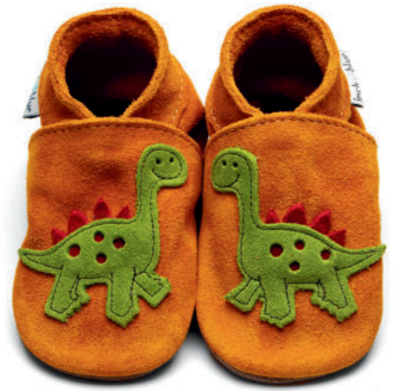
Dino Colour: Tangerine Suede ID: 4370