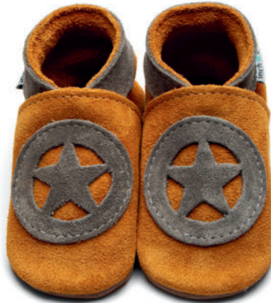
Sheriff Colour: Tan Suede ID: 4389