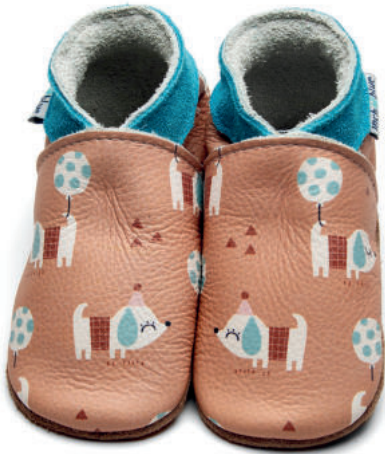
Woof Colour: Beige ID: 4399