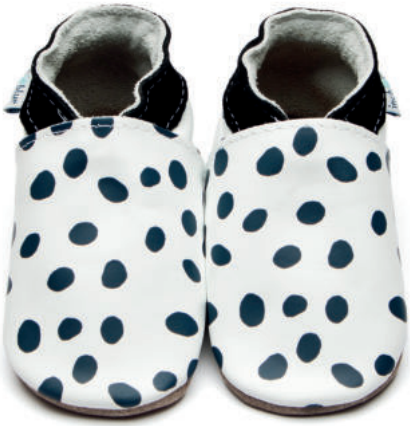
Dalmatian Colour: White ID: 3531