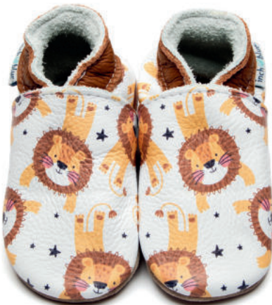
Roar Colour: White ID: 3787