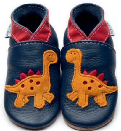
Dino Colour: Navy ID: 2490