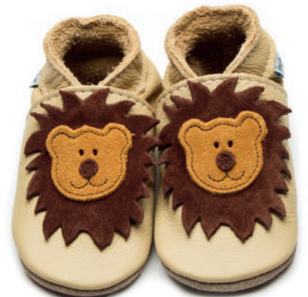
Leo Colour: Cream ID: 2622