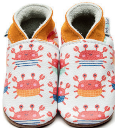
Mr Claws Colour: White ID: 3785