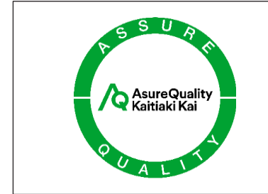
Assure Quality Certificate