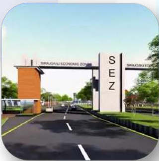
Sirajganj Economic Zone (SEZ)