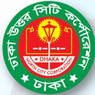
Dhaka North City Corporation