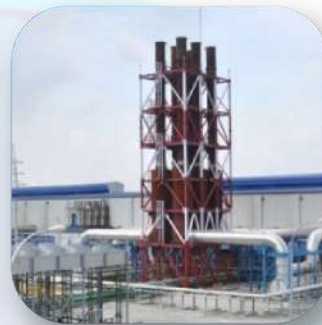
Orion Power Plant