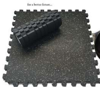
EPDM/SBR Rubber Mat