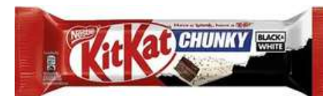
KIT KAT BLACK&WHITE 42G 24/8184