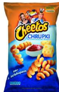
CHEETOS SPIRALS 145G