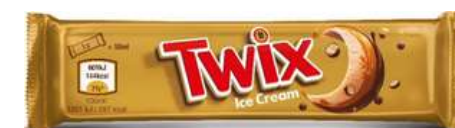
TWIX SINGLE ICE BAR 51ML 24/9600