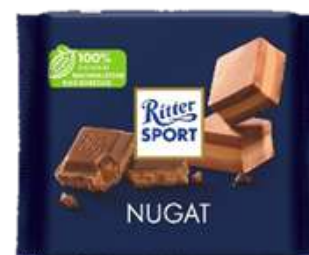
RITTER SPORT PRALINE 100G 13/5200