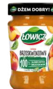
ŁOWICZ JAM PEACH 280G 8/1920