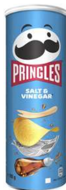
PRINGLES SALT&VINEGAR 165G 19/1368