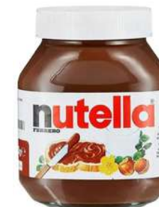
NUTELLA 750G 6/768