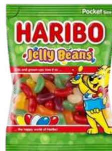
HARIBO JELLY BEANS 85G 30/4200