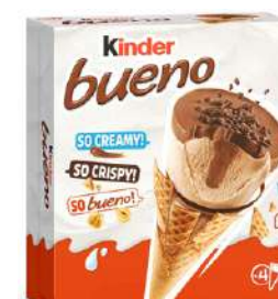
KINDER BUENO ICE CREAM 90ML 30/4800