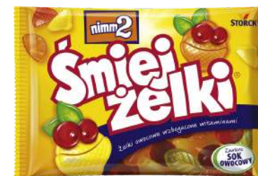
NIMM2 ŚMIEJŻELKI 100G