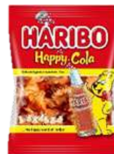
HARIBO HAPPY COLA 100G