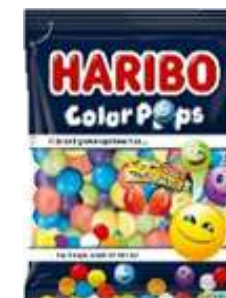
HARIBO COLOR POPS 80G 30/4200