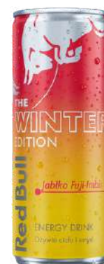
RED BULL WINTER EDITION 250ML 24/2592