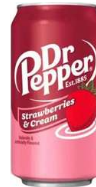
DR PEPPER STRAWBERRIE CREAM 355ML