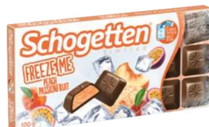
SCHOGETTEN FREEZE ME - PEACH PASSIONFRUIT 100G