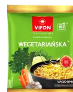
VIFON INSTANT SOUP VEGETARIAN 70G 24/4320