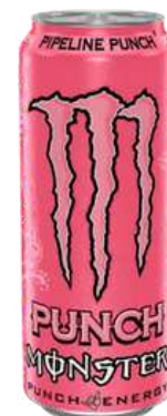
MONSTER JUICED PIPELINE PUNCH 500ML 12/1440