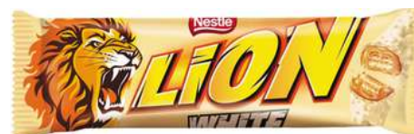
LION WHITE 42G 24/5760