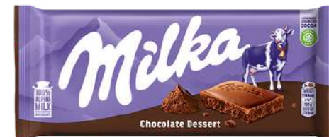
MILKA CHOCO DESSERT 100G 22/6600