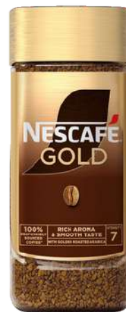
NESCAFE GOLD 200G