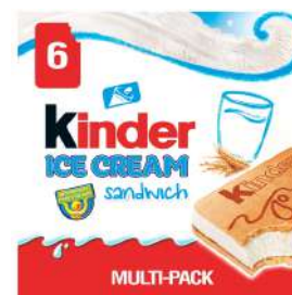
KINDER ICE CREAM SANDWICH 60ML 48/480