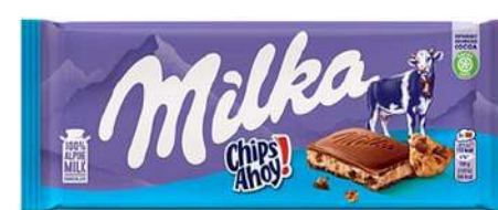
MILKA CHIPS AHOY 100G 22/6600