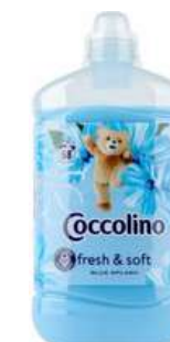
COCCOLINO FRESH SOFT 1,7L 6/360