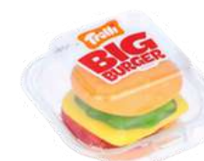
TROLLI HAMBURGER 12X50G