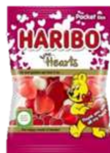
HARIBO LOVE HEARTS 100G