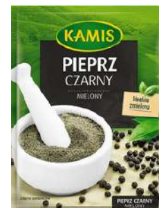
KAMIS SEASONING BLACK PEPPER 20G 22/9680