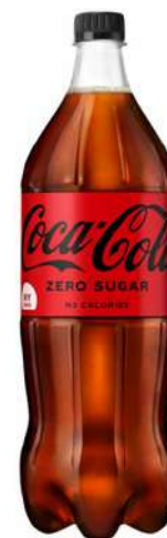
COCA COLA ZERO 1,5L