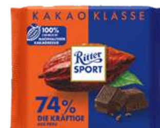
RITTER SPORT CACAO 74% PERU 100G 12/4800