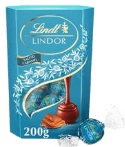
LINDT LINDOR SALTED CARMEL 200G