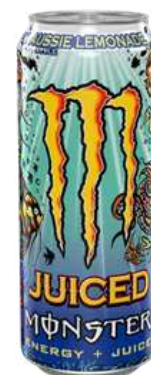
MONSTER JUICED AUSSIE LEMONADE 500ML 12/1440