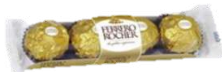
FERRERO ROCHER T4 50G 16/3136