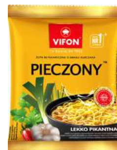
VIFON INSTANT SOUP ROAST CHICKEN 70G 24/4320