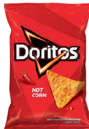
DORITOS HOT CORN SANTITAS 100G 28/1120