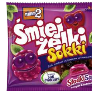
NIMM2 ŚMIEJŻELKI SOKKI SŁODKI SAD 90G 24/2592