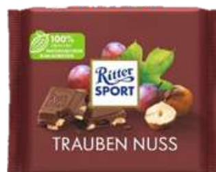
RITTER SPORT RAISINS HAZELNUTS 100G 12/4800