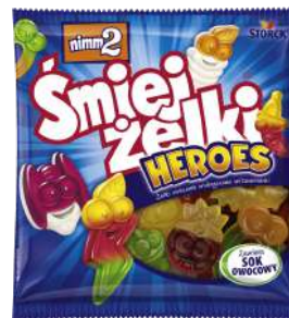
NIMM2 ŚMIEJŻELKI HEROS 90G 24/2016