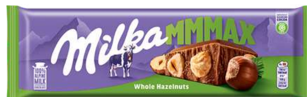
MILKA MMAX WHOLE HAZELNUT 250G 12/2304