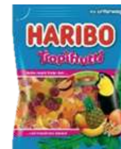
HARIBO TROPIFRUTTI 100G