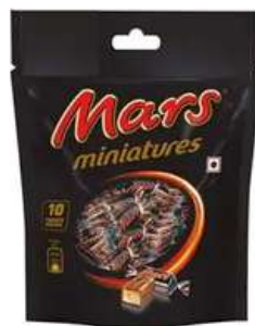
MARS MINIATURES 100G