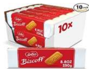
LOTUS BISCUITS 250G