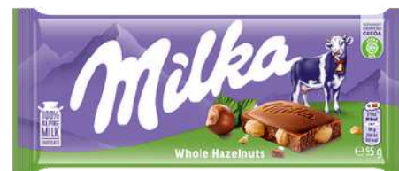
MILKA WHOLE HAZELNUTS 95G 17/5100