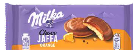
MILKA CHOCO JAFFA ORANGE 147G