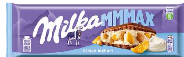
MILKA MMAX CRISPY YOGHURT 300G 12/1728