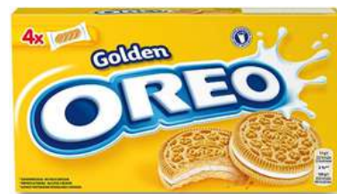
OREO GOLDEN 176G 12/1056