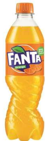
FANTA ORIGINAL 12/1296 500ML 12/1296