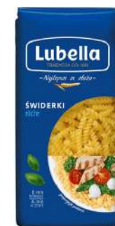
LUBELLA PASTA SWIDERKI 400G 18/1152