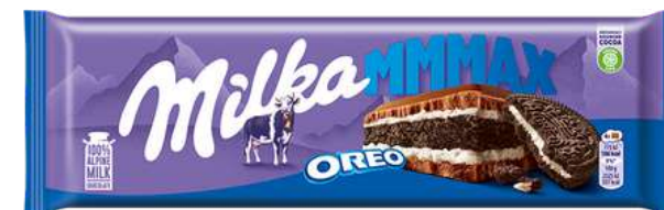
MILKA MMAX OREO 300G 12/1728