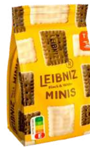
LEIBNIZ MINIS BLACK'N WHITE 125G