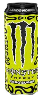
MONSTER LANDO NORRIS ZERO SUGAR 500ML 12/1440