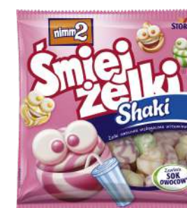
NIMM2 ŚMIEJŻELKI SHAKI 90G