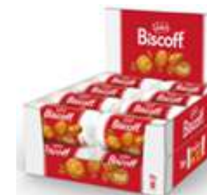
LOTUS CREAM BISCOFF 50G