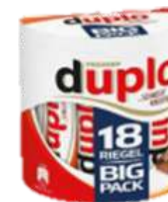
DUPLO T18 327G