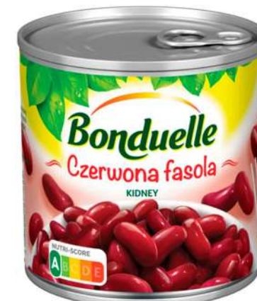
BONDUELLE BEANS 400G 12/1728