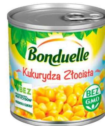
BONDUELLE GOLD CORN 340G 12/1728