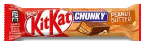
KIT KAT CHUNKY PEANUT 42G 24/8184