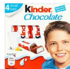
KINDER CHOCOLATE T4 50G 20/160