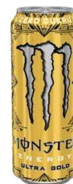
MONSTER ENERGY ULTRA GOLD ZERO 500ML 12/1440