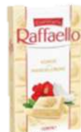
RAFFAELLO TAFEL 90G