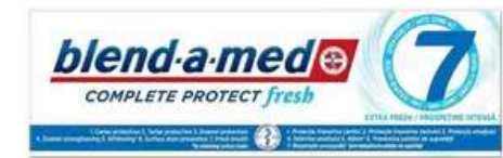
BLEND-A-MED TOOTHPASTE COMPLETE EXTRA FRESH 75ML 24/3264