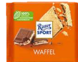
RITTER SPORT WAFFLE 100G 10/4000