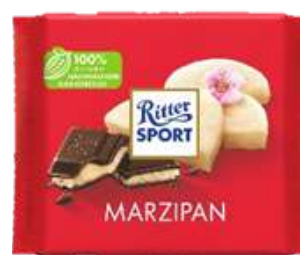
RITTER SPORT MARZIPAN 100G 12/4800