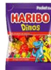
HARIBO DINOS 100G