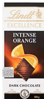
LINDT EXCELLENCE DARK ORANGE 100G 18/3600