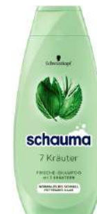
SCHAUMA SHAMPOO HERBS