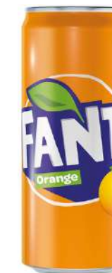
FANTA ORIGINAL 330ML 24/2640