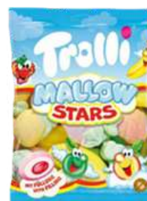
TROLLI MARSHMALLOWS MALLOW STAR 100G