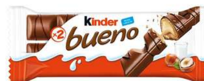
KINDER BUENO T2 43G 30/7020