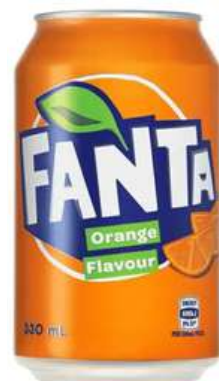
FANTA ORIGINAL 330ML