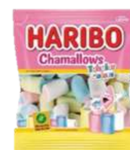
HARIBO CHAMALLOWS TUBULAR COLOR 90G 30/2160