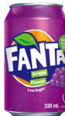
FANTA GRAPE 330ML