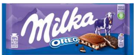
MILKA OREO 100G 22/6600