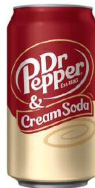
DR PEPPER CREAM SODA 355ML