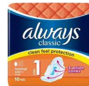
ALWAYS HYGIENE PADS CLASSIC NROMAL