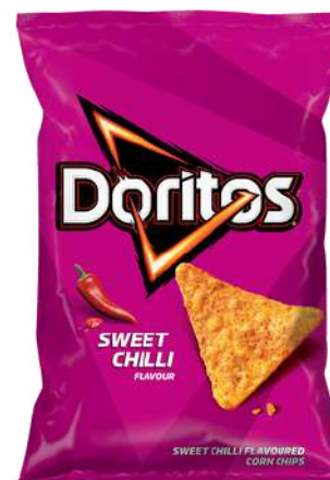
DORITOS SWEET CHILI SANTITAS 100G 28/1120