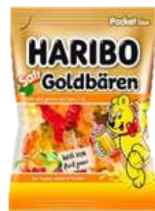
HARIBO SAFT GOLDBAREN 85G 30/3600