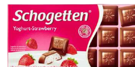
SCHOGETTEN YOGHURT- STRAWBERRY 100G 15/3960