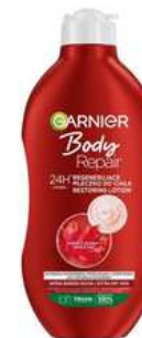
GARNIER BODY MILK 400ML