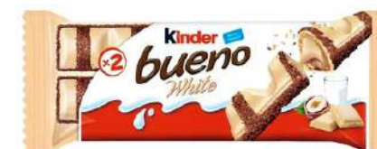
KINDER BUENO T2 39G 30/7020