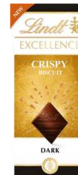
LINDT EXCELLENCE DARK CRISPY BISCUIT 100G 20/3600