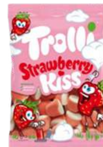
TROLLI STRAWBERRY KISS 100G 22/1584