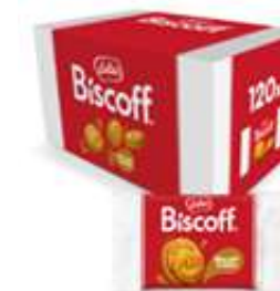
LOTUS BISCOFF CREAM 10G