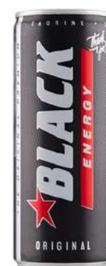
BLACK ENERGY 250ML