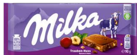
MILKA RAISIN & NUT 90G 23/6900