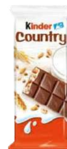
KINDER COUNTRY T1 23,5G 80/13440