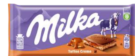
MILKA TOFFEE CREME 100G 23/6900