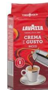
LAVAZZA CREMA E GUSTO RICCO 250G 20/1200