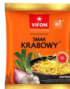
VIFON INSTANT SOUP CRAB 70G 24/4320