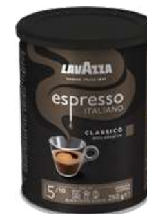
LAVAZZA TIN ESPRESSO ITALIANO 250G 12/1080