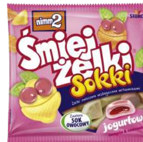
NIMM2 ŚMIEJŻELKI SOKKI JOGURT 90G 24/2592