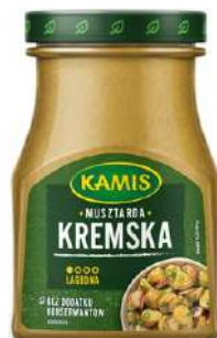
KAMIS MUSTARD KREMSKA 185G 8/2240