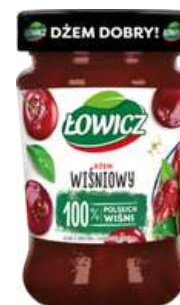
ŁOWICZ JAM CHERRY 280G 8/1920