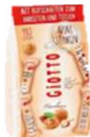
GIOTTO 116G 10/480