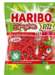
HARIBO SPAGHETTI FIZZ STRAWBERRY 75G 20/2600