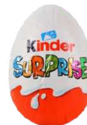
KINDER SURPRISE EGG 20G 72/9216