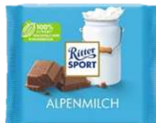
RITTER SPORT ALPINE MILK CHOCOLATE 30% COCOA 100G 12/4800