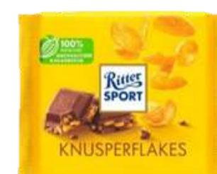
RITTER SPORT CORNFLAKES 100G 10/4000