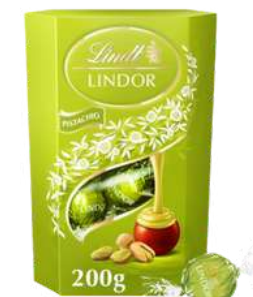
LINDT LINDOR PISTACHIO 200G