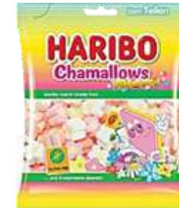
HARIBO CHAMALLOWS FLOWERS 100G 30/2160