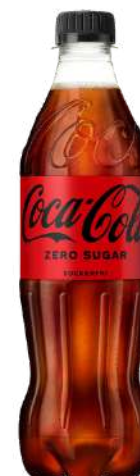
COCA COLA ZERO 500ML