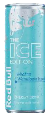
RED BULL ICE EDITION 250ML 24/2592