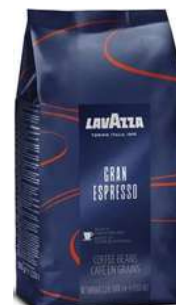
LAVAZZA GRAN ESPRESSO 1KG