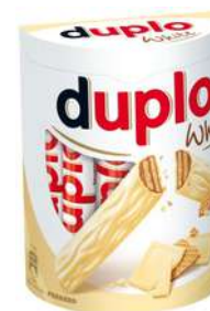
DUPLO WHITE T10 182G