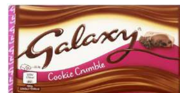
GALAXY SMOOTH MILK 110G 12/5760