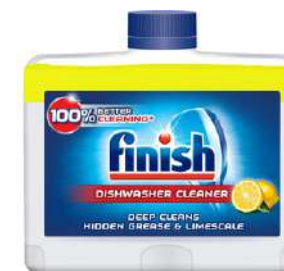
FINISH CLEANER 250ML