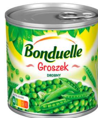
BONDUELLE PEANS 200G 12/3240