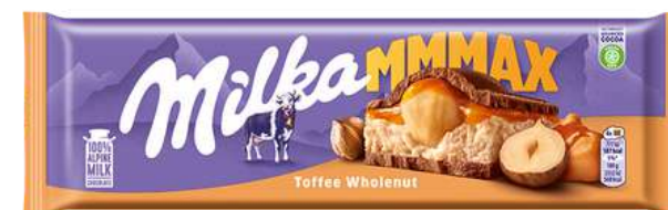
MILKA MMAX TOFFEE WHOLENUT 300G 12/1728