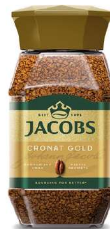
JACOBS CRONAT GOLD 200G