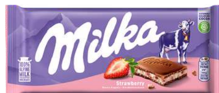
MILKA STRAWBERRY 100G 22/6600