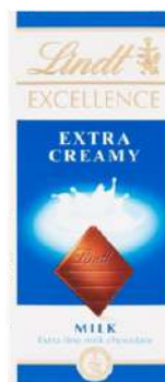
LINDT EXCELLENCE EXTRA CREAMY 100G 20/3600