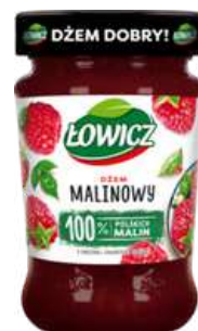
ŁOWICZ JAM RASPBERRY 280G 8/1920