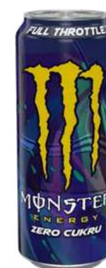
MONSTER FULL THROTTLE ZERO 500ML