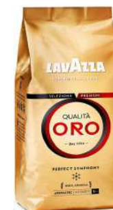
LAVAZZA QUALITA ORO 1KG