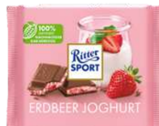
RITTER SPORT STRAWBERRY YOGURT 100G 12/4800