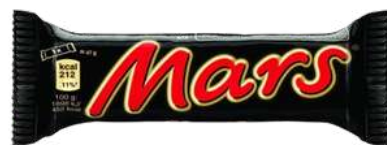
MARS 51G 40/11760