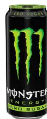
MONSTER GREEN ZERO SUGER 500ML