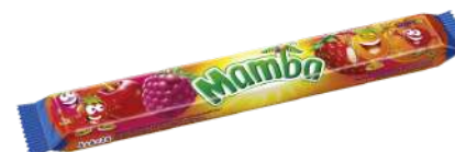
MAMBA GUM 4X26,5G