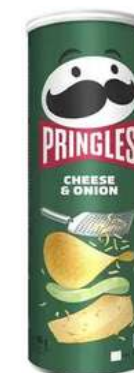
PRINGLES CHEESE&ONION 165G