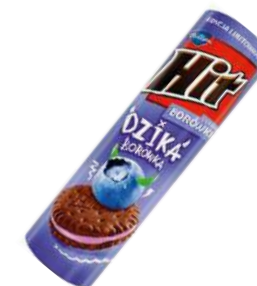
BAHLESEN HIT BLUEBERRIES 220G 24/1296