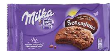
MILKA SENSATIONS SOFT INSIDE 156G 12/900