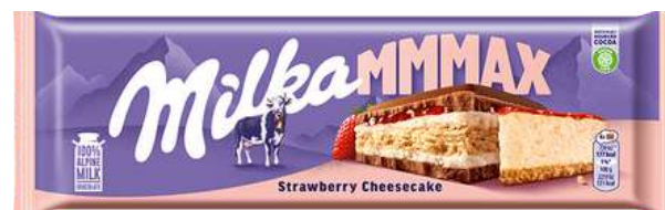
MILKA MMAX STRAWBERRY CHEESECAKE 300G 12/1728