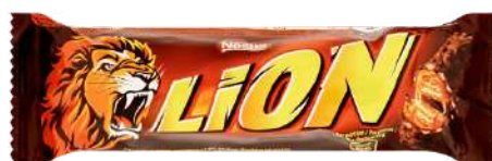
LION STANDARD 42G 24/5760