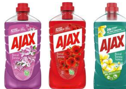
AJAX CLEANER RANGE OF FLAVORS 1L 12/600