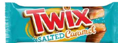
TWIX SALTED CARAMEL 50G 30/12600