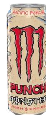
MONSTER JUICED PACIFIC PUNCH 500ML 12/1728