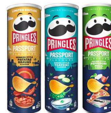
PRINGLES PASSPORT EDITION