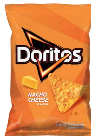
DORITOS NACHO SANTITAS 100G 28/1120