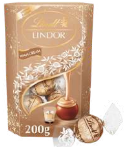
LINDT LINDOR IRISH CREAM 200G