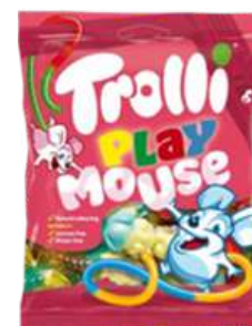
TROLI PLAYMOUSE 1000G