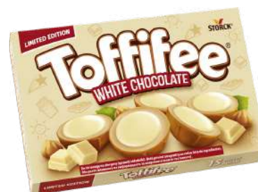
TOFFIFEE WHITE 125G