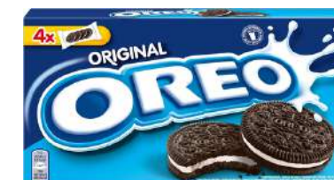
OREO ORIGINAL 176G 12/1056