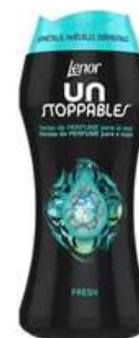
LENOR UNSTOPPABLE SCENTED PEARLS FRESH