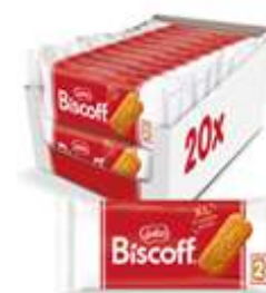
LOTUS BISCUITS TWIN 25G