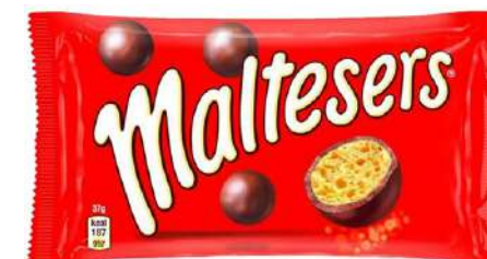
MALTESERS DRALING 37G