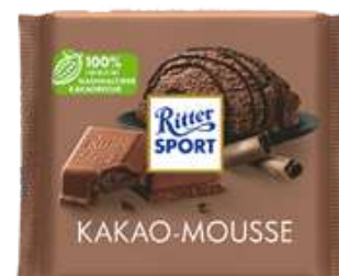
RITTER SPORT CACAO MOUSSE 100G 11/4400