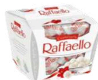
RAFFAELLO T15 150G 64/840