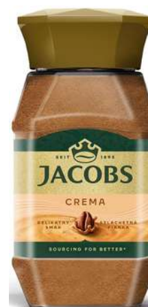
JACOBS CREMA 200G