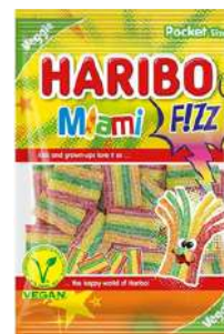
HARIBO MIAMI FIZZ 85G 30/3750