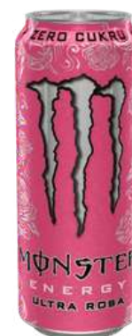
MONSTER ULTRA ROSÁ ZERO 500ML 12/1728