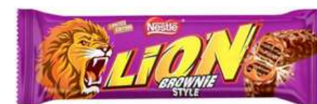
LION BROWNIE STYLE 40G 40/6400