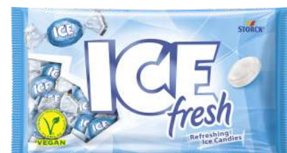
ICE FRESH CANDIES 125G