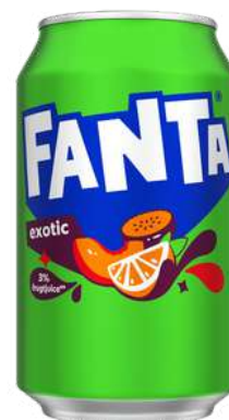
FANTA EXOTIC 330ML