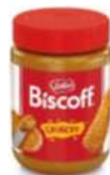
LOTUS BISCOFF CRUNCHY SPREAD 380G