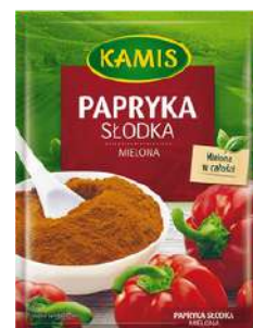
KAMIS SEASONING SWEET PAPRIKA 20G 22/9680