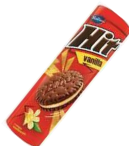
BAHLESEN HIT VANILLA 220G 24/1296