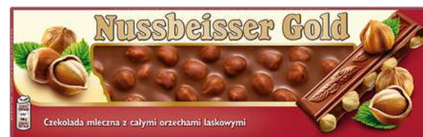
NUSSBEISSER GOLD 220G 10/2600