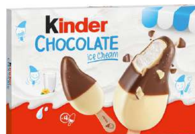
KINDER ICE CREAM CHOCOLATE T4 55ML 7/1260