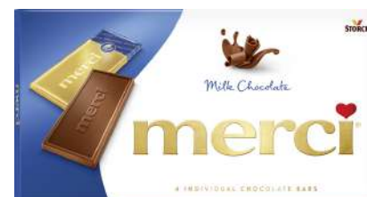
MERCI CHOCOLATE MILK 100G