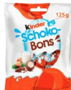
KINDER SCHOKO-BONS 125G 16/1728