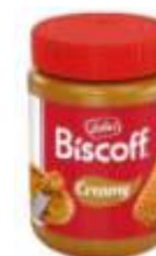
LOTUS BISCOFF SPREAD 400G