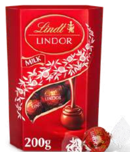
LINDT LINDOR MILK 200G