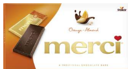
MERCI CHOCOLATE ORANGE ALMOND 100G