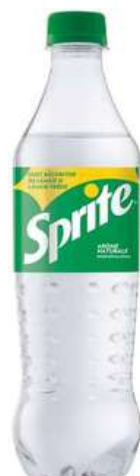
SPRITE ORIGINAL TASTE 500ML 12/1296