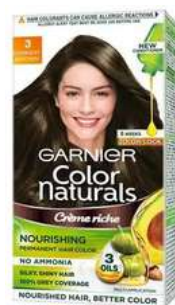
GARNIER COLOR NATURALS 12/1920