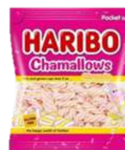
HARIBO CHAMALLOWS GIRONDO 90G 30/2160