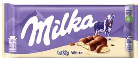
MILKA BUBBLY MILK&WHITE 95G 15/4500