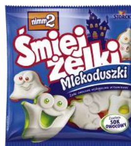
NIMM2 ŚMIEJŻELKI MLEKODUSZKI 90G