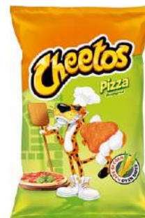
CHEETOS PIZZERINI 160G