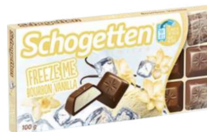
SCHOGETTEN FREEZE ME - BOURBON VANILLA 100G