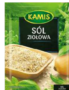
KAMIS SEASONING HERBAL SALT 20G 22/9680