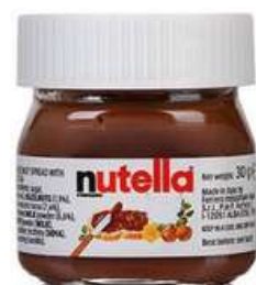
NUTELLA 25G 64/9216