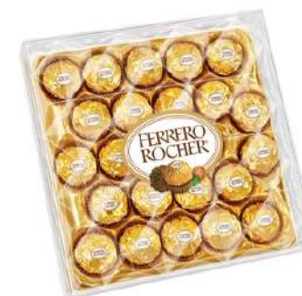
FERRERO ROCHER T24 300G 4/504