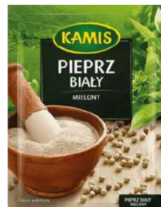
KAMIS SEASONING WHITE PEPPER 20G 22/9680