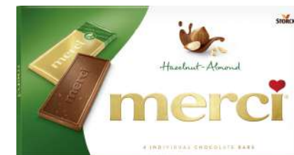
MERCI CHOCOLATE HAZELNUT 100G