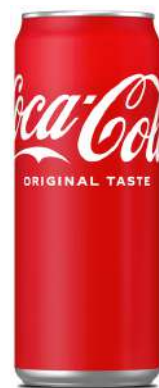
COCA COLA ORIGINAL TASTE 330ML 24/2640