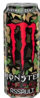
MONSTER ENERGY ASSAULT 500ML 12/1440