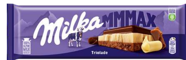
MILKA MMAX TRIOLADE 280G 15/2160