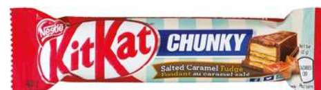
KIT KAT SALTED CARAMEL 42G 24/7440