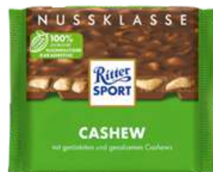
RITTER SPORT CASHEW 100G 12/4800