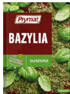
PRYMAT SEASONING BASIL 10G 20/7600