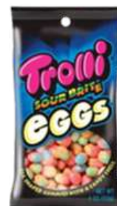
TROLI FILLED EGG 80X18G