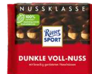
RITTER SPORT DARK WHOLE NUT 100G 10/4000