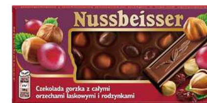
NUSSBEISSER DARK NUTS AND RAISINS 100G 20/5760