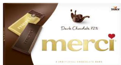
MERCI CHOCOLATE DARK 72% 100G