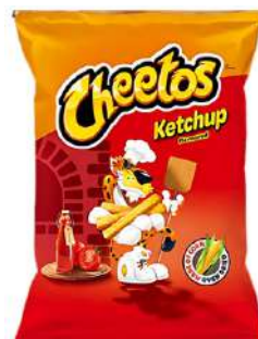
CHEETOS KETCHUP 165G