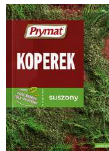
PRYMAT SEASONING DILL 6G 25/9500