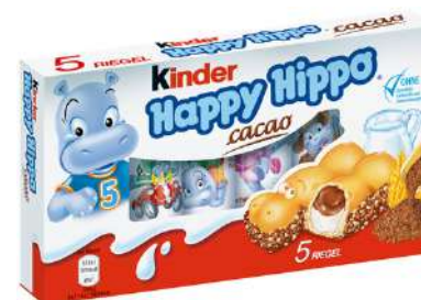
KINDER HAPPY HIPPO T5 CACAO 104G 10/2250