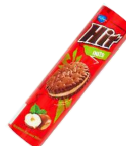
BAHLESEN HIT NUTS 220G 24/1296