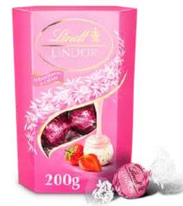
LINDT LINDOR STRAWBERRY CREAM 200G