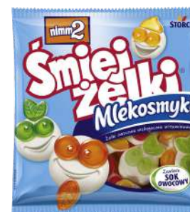
NIMM2 ŚMIEJŻELKI MLEKOSMYKI 90G