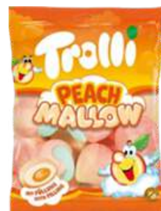
TROLLI MARSHMALLOWS PEACH 150G