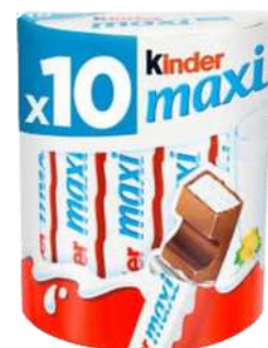
KINDER MAXI T10 210G 28/1792