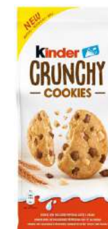
KINDER CRUNCHY COOKIES 136G 15/960