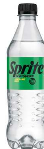
SPRITE ZERO 500ML