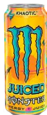
MONSTER JUICED KHAOTIC 500ML 12/1440