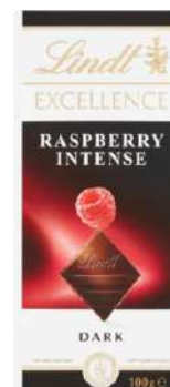
LINDT EXCELLENCE DARK RASPBERRY 100G 20/3600