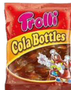
TROLLIE COLA BOTTLES 100G 24/1728