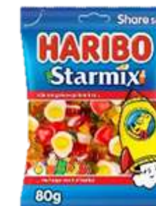
HARIBO STARMIX 80G 30/4200