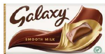
GALAXY COOKIE CRUMBLE 96G 12/5760