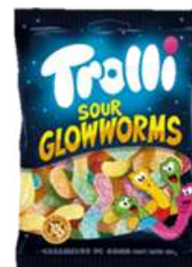
TROLLI SOUR WURRLI 100G 24/1728