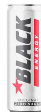
BLACK ENERGY ZERO 250ML