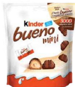
KINDER BUENO MINI T20 108G 16/1024