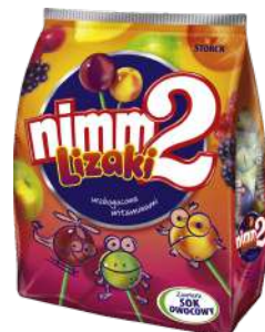
NIMM2 LOLLIPOP 80G