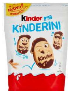
KINDER KINDERINI T20 250G 10/640