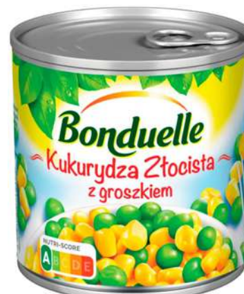
BONDUELLE GOLD CORN AND PEANS 340G 12/1728