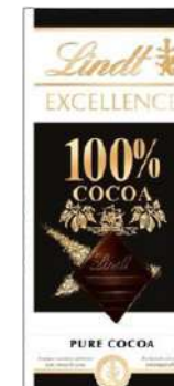
LINDT EXCELLENCE 100% COCOA 50G 18/3600