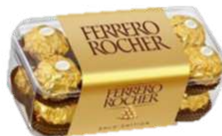
FERRERO ROCHER T16 200G 8/1280