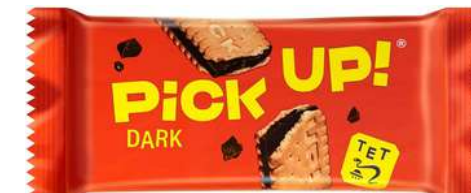
LEIBNIZ PICK UP DARK 28G 24/10032