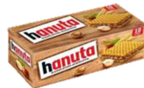
HANUTA T10 220G 24/960