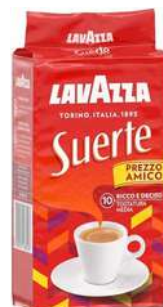
LAVAZZA SUERTE 250G