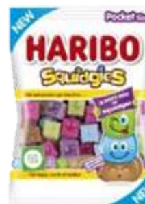
HARIBO SQUIDGIES 80G 26/3640