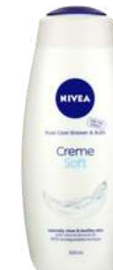
NIVEA SHOWER GEL 500ML