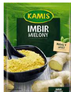
KAMIS SEASONING GINGER 20G 22/9680