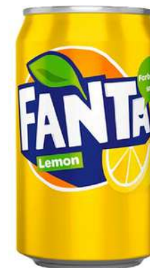
FANTA LEMON 330ML