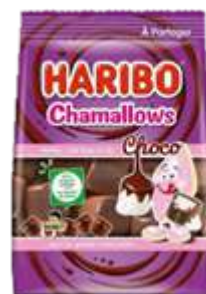
HARIBO CHAMALLOWS CHOCO 160G 14/1120