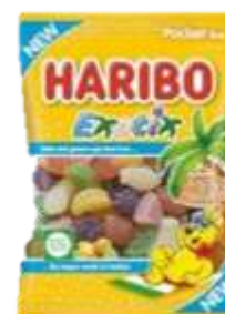
HARIBO EXOTIX 100G 26/3640