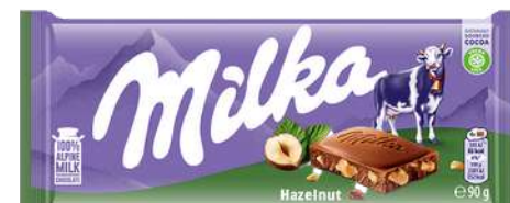
MILKA HAZELNUTS 90G 24/5280