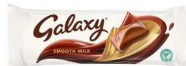
GALAXY 20G 32/49152