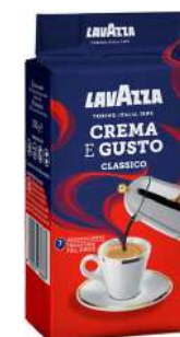
LAVAZZA CREMA E GUSTO CLASSICO 250G 20/1200