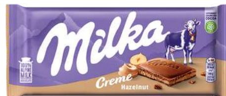
MILKA HAZELNUT CREME 85G 22/7920