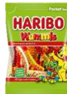
HARIBO WUMMIS 100G 30/4200