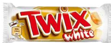
TWIX WHITE 50G 32/9600