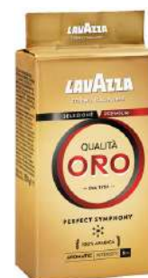
LAVAZZA QUALITA ORO 250G 20/1200