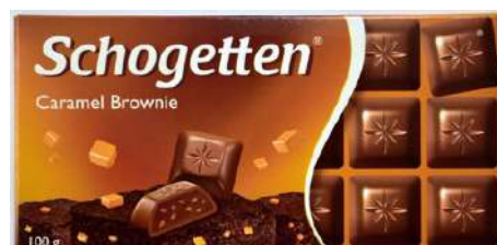
SCHOGETTEN CARAMEL BROWNIE 100G 15/3960