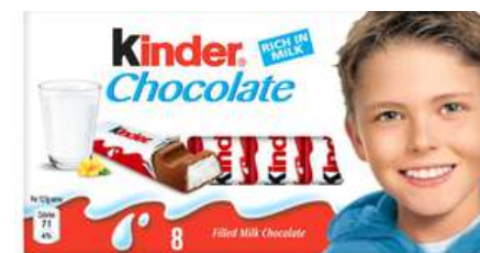
KINDER CHOCOLATE T8 100G 10/6000