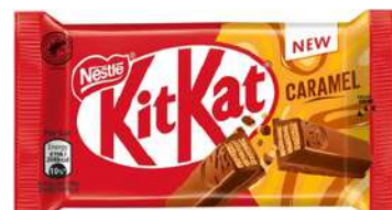
KIT KAT 4 FINGERS CARAMEL 41,5G 24/6720