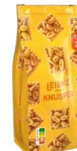
LEIBNIZ KNUSPER SNACK ERDNUSS 175G