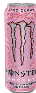
ULTRA STRAWBERRY DREAMS 500ML 12/1728