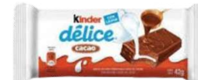
KINDER DELICE TI 39G 20/8100