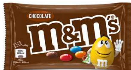
M&M'S CHOCO 45G