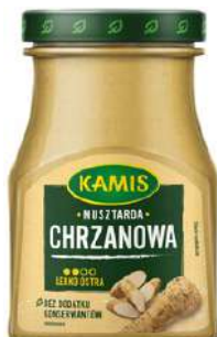
KAMIS MUSTARD CHRZANOWA 185G 8/2240