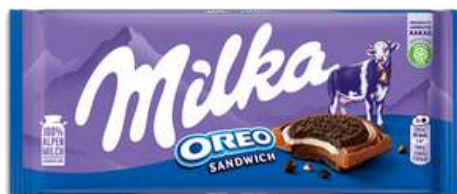
MILKA OREO 92G 16/4800