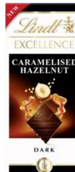
LINDT EXCELLENCE CARAMELIZED HAZELNUT 100G