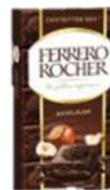
FERRERO ROCHER DARK TAFEL 90G