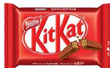
KIT KAT 4 FINGERS CLASSIC 41,5G 24/7560