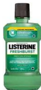
LISTERINE FRESHBURST 250ML