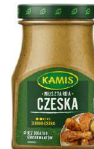
KAMIS MUSTARD CZESKA 180G 8/2240