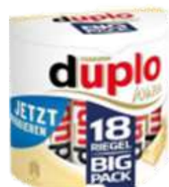
DUPLO WHITE T18 327G