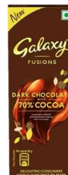
GALAXY DARK CHOCOLATE WITH 70% COCOA 56G 8/7776