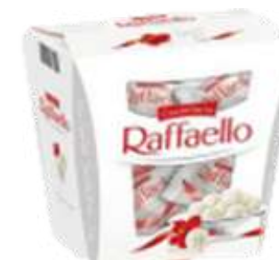
RAFFAELLO T23 230G 8/576