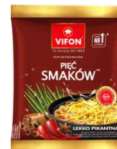
VIFON INSTANT SOUP FIVE FLAVOURS 70G 24/4320