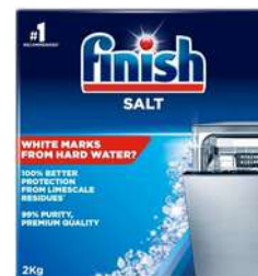
FINISH SALT 2KG