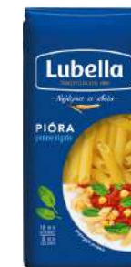
LUBELLA PASTA PIORA 400G 18/1152