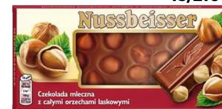
NUSSBEISSER 100G 20/5760