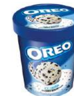
OREO ICE CREAM 480ML 6/1344