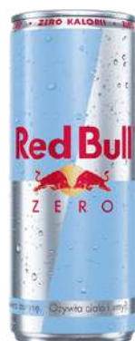
RED BULL ZERO 250ML 24/2592