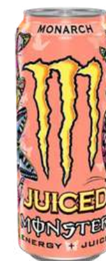
MONSTER JUICED MONARCH 500ML 12/1728