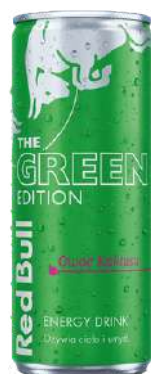
RED BULL GREEN EDITION 250ML 24/2592