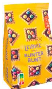
LEIBNIZ KUNTERBUNT 150G