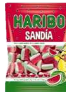
HARIBO SANDIA 90G 30/3780