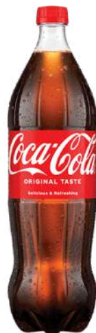
COCA COLA ORIGINAL TASTE 1,5L