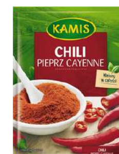
KAMIS SEASONING CHILLI 20G 22/9680