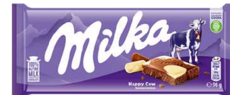
MILKA HAPPY COW 90G 24/7200