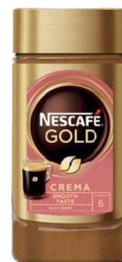
NESCAFE GOLD CREMA 100G