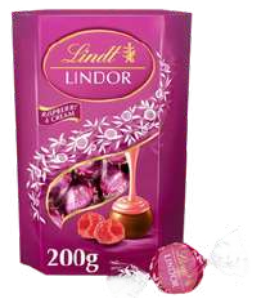
LINDT LINDOR RASPBERRY CREAM 200G