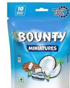
BOUNTY MINIATURES 100G