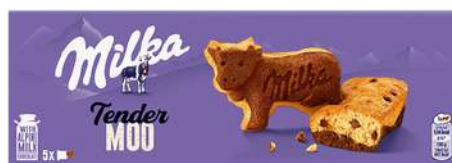
MILKA TENDET MOO 140G 8/560