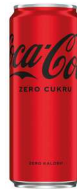
COCA COLA ZERO 330ML 24/2640