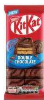
KITKAT CHOCOLATE SHARING BLOCK 99G 15/4260