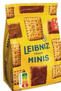
LEIBNIZ MINI CHOCO 125G