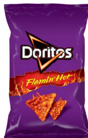
DORITOS NACHO FLEMIN HOT 100G 28/1120