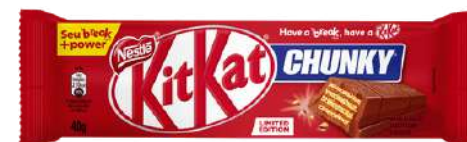
KIT KAT CHUNKY CLASSIC 40G 24/9672