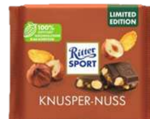
RITTER SPORT CRISPY NUT - LIMITED EDITION 100G 10/4000