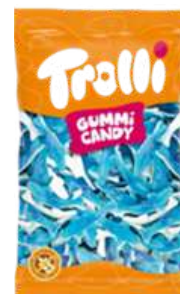
TROLI SHARK 1000G