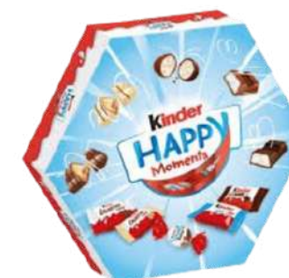
KINDER HAPPY MOMENTS 161G 12/840