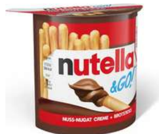
NUTELLA&GO 52G 12/3420