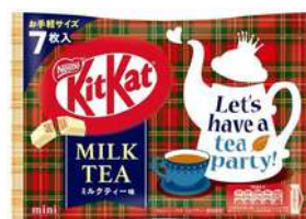
KITKAT - WAFER MILK TEA 85G