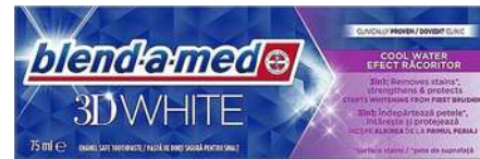
BLEND-A-MED TOOTHPASTE 3D WHITE 75ML 24/3264