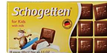
SCHOGETTEN FOR KIDS 100G 15/3960