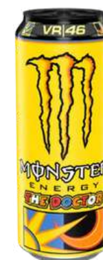
MONSTER THE DOCTOR 500ML