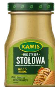
KAMIS MUSTARD STOŁOWA 185G 8/2240