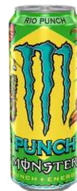
JUICED MONSTER RIO PUNCH 500ML