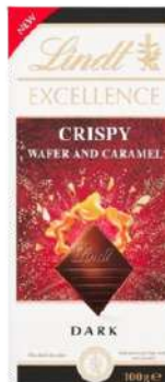
LINDT EXCELLENCE DARK CRISPY WAFER & CARAMEL 100G 20/3600