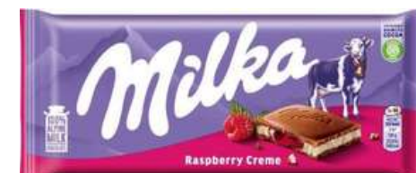
MILKA RASPBERRY CREAM 100G 22/7920