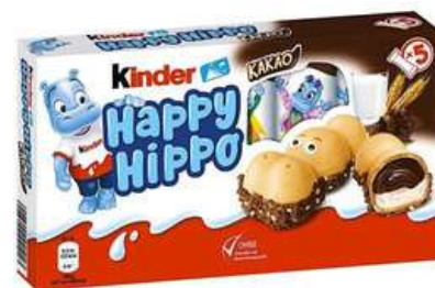
KINDER HAPPY HIPPO T5 HAZELNUT 104G 10/2250