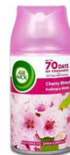
AIR WICK REFILL SPRAY 250ML