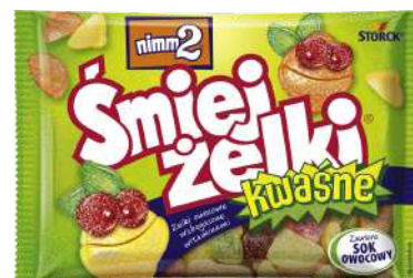
NIMM2 ŚMIEJŻELKI SOUR 100G