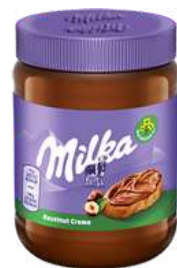
MILKA SPREAD 350G 12/1296