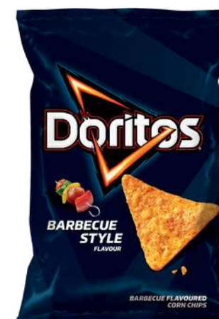
DORITOS BBQ SANTITAS 100G 28/1120