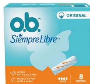
OB TAMPONS ORIGINAL SUPER 8