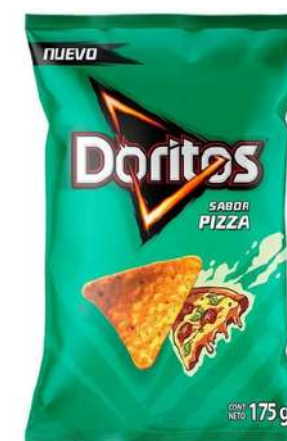
DORITOS PIZZA SANTITAS 100G 28/1120