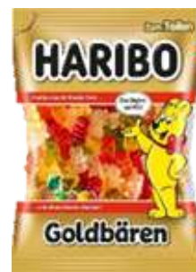
HARIBO GOLD BEARS 100G