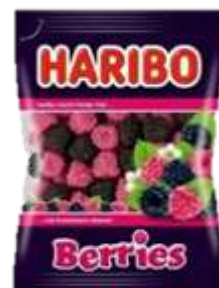
HARIBO BERRIES 100G 24/3360