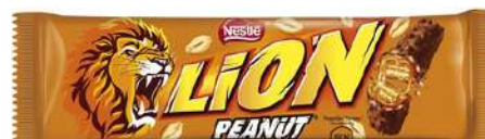
LION PEANUT 41G 40/6400