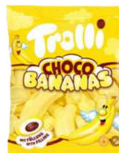
TROLLI MARSHMALLOWS BANNA 150G