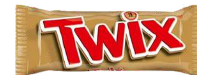
TWIX 50G 30/9240