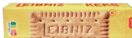
LEIBNIZ BUTTERKEKS 200G