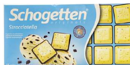
SCHOGETTEN STRACCIATELLA 100G 15/3960