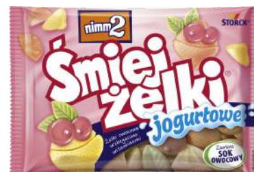
NIMM2 ŚMIEJŻELKI JOGURT 100G