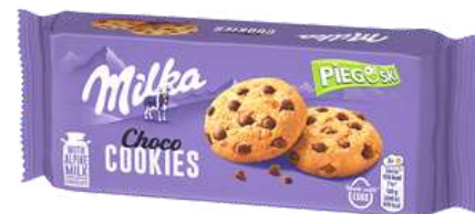
MILKA CHOCO COOKIES 135G 24/1440