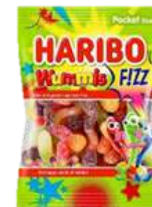
HARIBO WUMMIS FIZZ 100G 30/4200