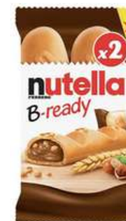
NUTELLA B-READY T2 44G 24/2592