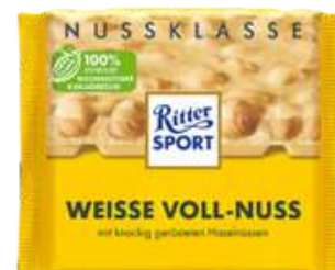
RITTER SPORT WHITE WHOLE NUT 100G 10/4000