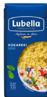
LUBELLA PASTA KOKARDA 400G 12/1008