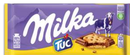
MILKA & TUC 87G 18/5400