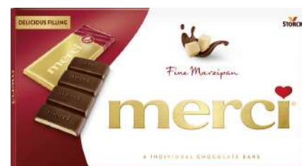
MERCI CHOCOLATE MARZIPAN 112G