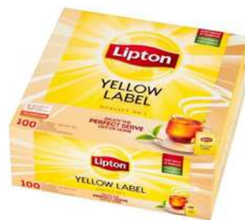
LIPTON YELLOW LABEL 100X2G