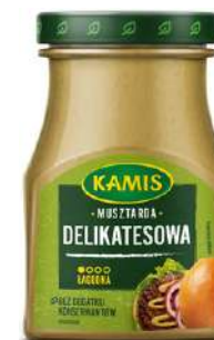
KAMIS MUSTARD DELIKATESOWA 185G 8/2240