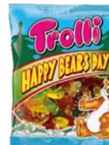
TROLLI CLASSIC BEARS 100G 24/1728