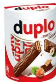
DUPLO T10 182G