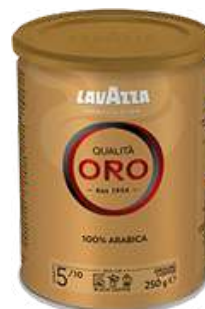
LAVAZZA TIN QUALITA ORO 250G 12/1080