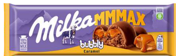
MILKA MMAX BUBBLY CARAMEL 250G 10/1920