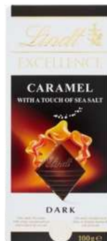
LINDT EXCELLENCE SEA SALT CARAMEL 100G 20/3600