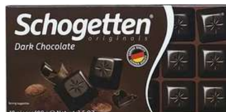
SCHOGETTEN DARK CHOCOLATE 100G 15/3960