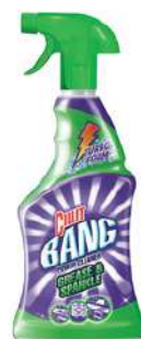
CILIIT BANG SPRAY 750ML