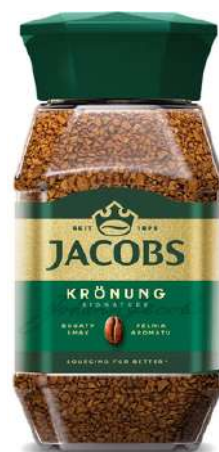
JACOBS KRÖNUNG 200G