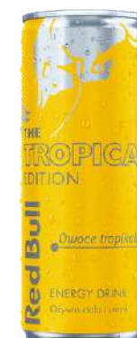
RED BULL TROPICAL EDITION 250ML 24/2592