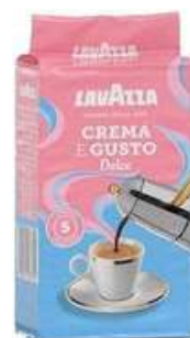
LAVAZZA CREMA E GUSTO DOLCE 250G 20/1200