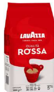
LAVAZZA QUALITA ROSSA 1KG