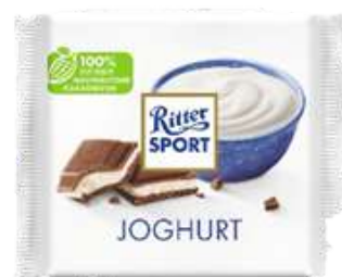
RITTER SPORT YOGURT 100G 12/4800