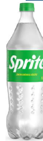
SPRITE ORIGINAL TASTE 1,5L