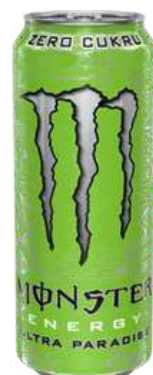
MONSTER ULTRA PARADISE ZERO 500ML 12/1728