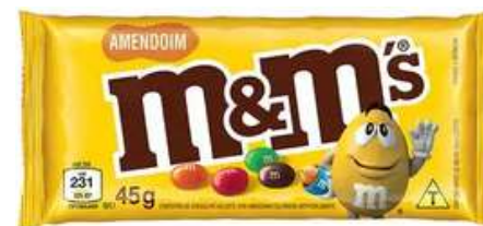
M&M'S PEANUT 45G