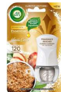
AIR WICK 19ML