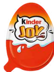
KINDER JOY T1 20G 72/6048