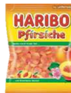
HARIBO PFIRSICHE 100G