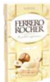
FERRERO ROCHER WEISS TAFEL 90G 8/3360