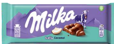
BUBBLY COCONUT 97G 15/4500