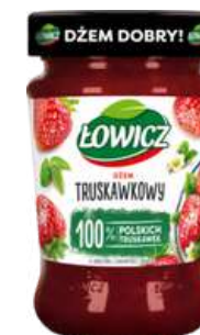
ŁOWICZ JAM STREWBARRY 280G 8/1920