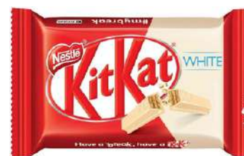
KIT KAT 4 FINGERS WHITE 41,5G 24/6720