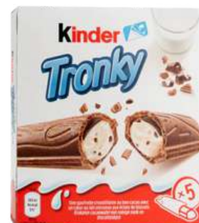
KINDER TRONKY T5 90G 20/3080