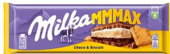
MILKA MMAX CHOCO BISCUIT 300G 12/1728