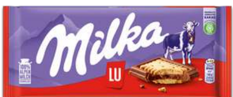
MILKA & LU 87G 18/5400