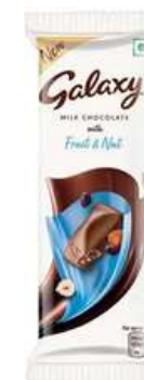
GALAXY FRUIT & NUT 52G 12/14256