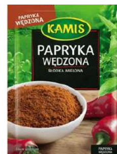
KAMIS SEASONING PAPRIKA 20G 22/9680