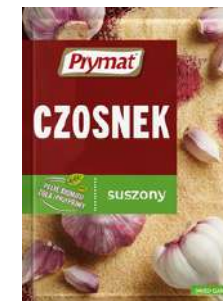
PRYMAT SEASONING GARLIC 20G 30/11400