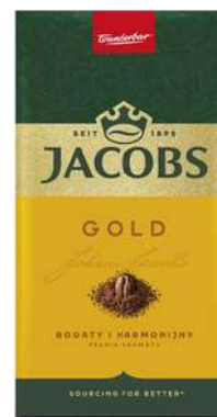
JACOBS GOLD 250G