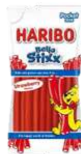
HARIBO BALLA STIXX STRAWBERRY 80G 24/3120