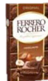
FERRERO ROCHER ORIGINAL TAFEL 90G