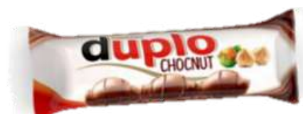
DUPLO CHOCNUT T1 26G