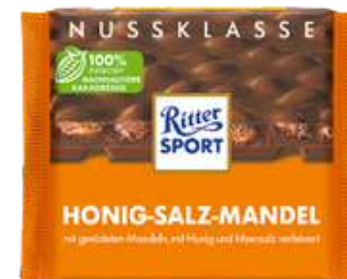
RITTER SPORT HONEY SALT ALMONDS 100G 11/4400