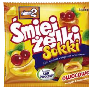
NIMM2 ŚMIEJŻELKI SOKKI 90G 24/2592