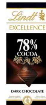
LINDT EXCELLENCE 78% 100G 20/3600