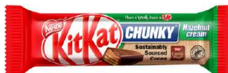
KIT KAT HAZELNUT 42G 24/7488