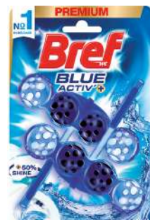
BREF BALLS 2X50G