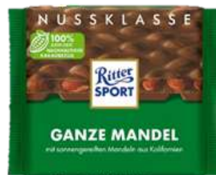
RITTER SPORT WHOLE ALMONDS 100G 11/4400