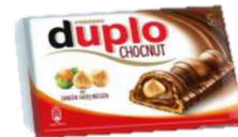
DUPLO CHCONU T5 130G