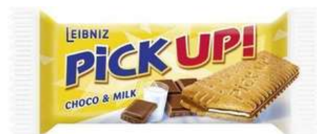
LEIBNIZ PICK UP CHOCO & MILK T10 28G 10/1100