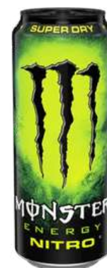
MONSTER NITRO SUPER DRY 500ML