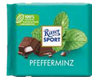
RITTER SPORT PEPPERMINT 100G 12/4800