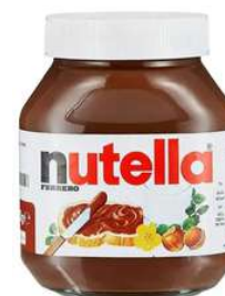
NUTELLA 450G 15/1350