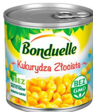
BONDUELLE GOLD CORN 170G 12/3240