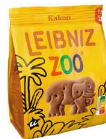
LEIBNIZ ZOO KAKAO 125G 12/576