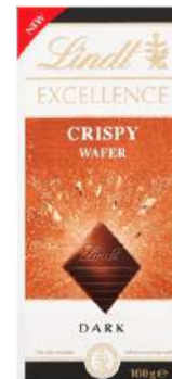
LINDT EXCELLENCE DARK CRISPY WAFER 100G 20/3600