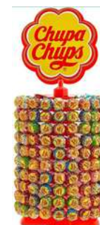
CHUPA CHUPS CAROUSEL 200PCS 1/75