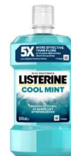
LISTERINE COOLMINT 500ML