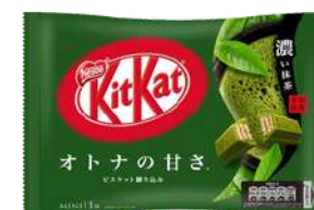
KITKAT - WAFER OTONA NO AMASA RICH MATCHA 124G