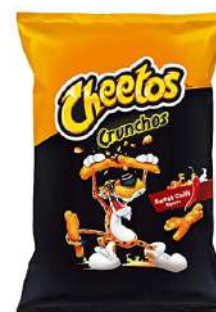
CHEETOS SWEET CHILLI CRUNCHY 165G