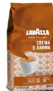
LAVAZZA CREMA E AROMO 1KG