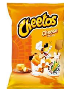
CHEETOS CHEESE 165G