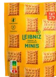
LEIBNIZ MINIS GLUTENFREI 100G