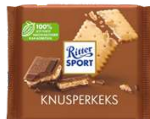
RITTER SPORT WAFLE BUTTER BISCUITS 100G 11/4400