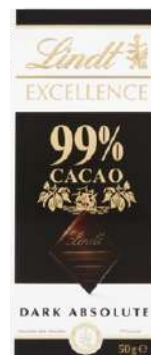
LINDT EXCELLENCE 99% COCOA 50G 18/3600