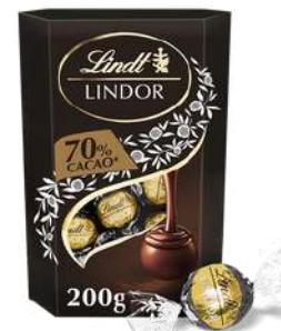
LINDT LINDOR 70% DARK 200G