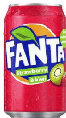
FANTA STRAWBERRY&KIWI 330ML