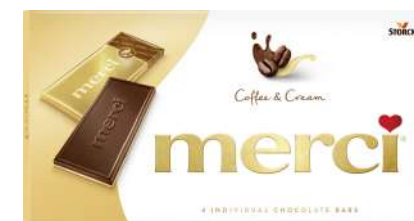
MERCI CHOCOLATE COCOA CREAM 100G