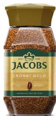
JACOBS CRONAT GOLD 100G