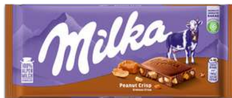
MILKA PEANUT CRISPY CARAMEL 90G 24/7200