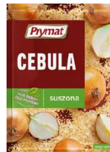
PRYMAT SEASONING ONION 15G 25/9500