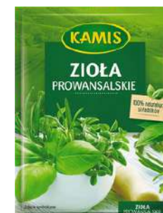
KAMIS SEASONING MIXED HERBS 20G 22/9680