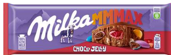
MILKA MMAX CHOCO JELLY 250G 15/2160