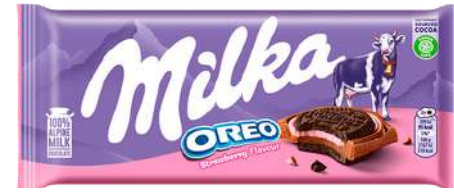
MILKA OREO STRAWBERRY 100G 22/6600