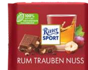
RITTER SPORT RUM RAISINS HAZELNUTS 100G 12/4800