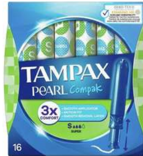
TAMPAX TAMPONS COMPAK PEARL SUPER 16PCS 6/1680