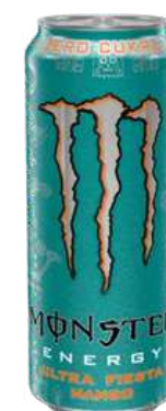
MONSTER ULTRA FIESTA MANGO ZERO 500ML 12/1440