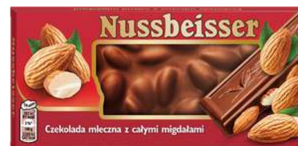
NUSSBEISSER ALMOND 100G 20/5760