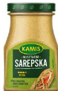
KAMIS MUSTARD SAREPSKA 185G 8/2240