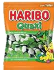
HARIBO QUAXI 100G 30/4200