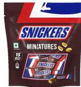
SNICKERS MINIATURES 108G