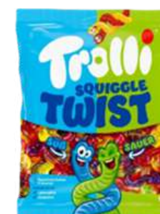
TROLLI SQUIGGLE TWIST 100G 24/1728