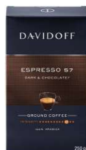
DAVIDOFF ESPRESSO 57 250G 12/1920