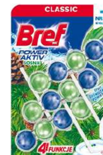
BREF BALLS 3X50G