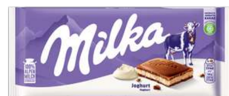
MILKA YOGHURT 100G 23/6900