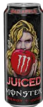
MONSTER JUICED BAD APPLE 500ML