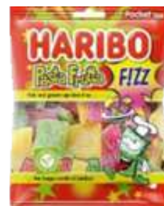
HARIBO PASTA FRUTTA 70G 24/3360