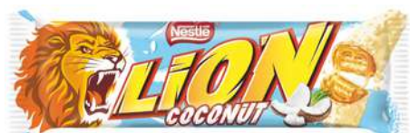
LION COCONUT 40G 40/6400