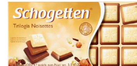
SCHOGETTEN TRILOGIA NOISETTES 100G 15/3960