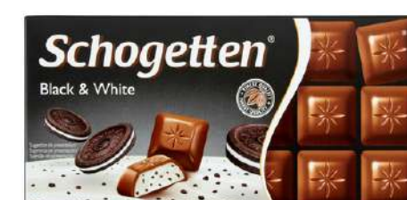
SCHOGETTEN DARK CHOCOLATE WITH HAZELNUTS 100G 15/3960