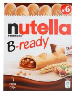
NUTELLA B-READY T6 132G 8/1080