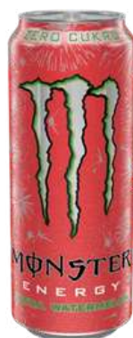
MONSTER ENERGY ULTRA WATERMELON 500ML 12/1440