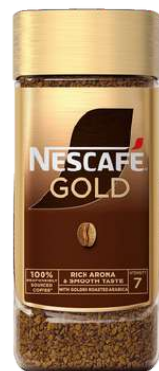
NESCAFE GOLD 100G