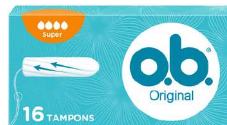
OB TAMPONS ORIGINAL 16