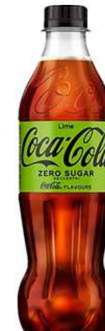
COCA COLA ZERO LIME 12/1296 500ML 12/1296