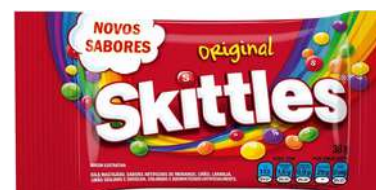
SKITTLES RANGE OF FLAVOURS 38G 14/11704