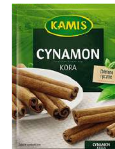
KAMIS SEASONING CINNAMON 20G 22/9680