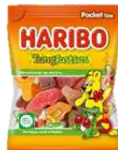
HARIBO TANGFASTICS 100G 24/3360