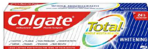
COLGATE TOOTHPASTE TOTAL WHITENING 75ML 48/2592