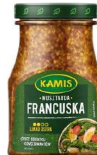
KAMIS MUSTARD FRANCUSKA 185G 8/2240