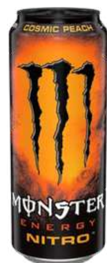
MONSTER NITRO COSMIC PEACH 500ML