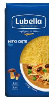
LUBELLA PASTA NITKA CIETA 400G 18/1152