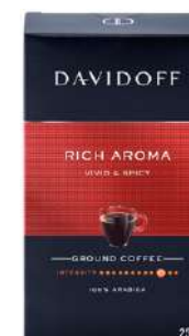
DAVIDOFF RICH AROMA 250G 12/1920