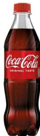
COCA COLA ORIGINAL TASTE 500ML 12/1296