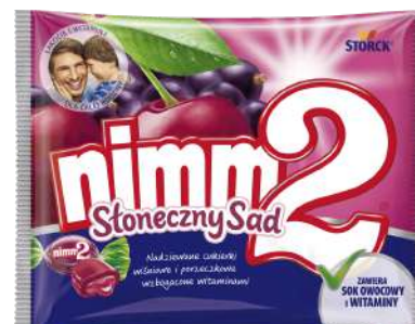
NIMM2 CANDIES SŁONECZNY SAD 90G