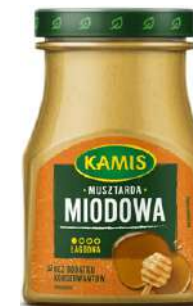
KAMIS MUSTARD MIODOWA 185G 8/2240