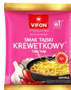
VIFON INSTANT SOUP TOM YUM 70G 24/4320