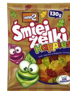
NIMM2 ŚMIEJŻELKI HAPPIES 130G 24/1296