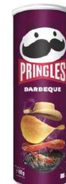
PRINGELS BBQ 165G