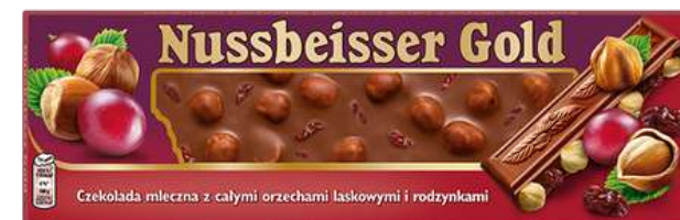
NUSSBEISSER MILK WHOLENUT & RAISIN 220G 10/2600