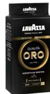
LAVAZZA QUALITA ORO RICCO 250G 20/1200