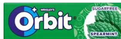
ORBIT RENG OF FLAVOURS 14G 600/43200