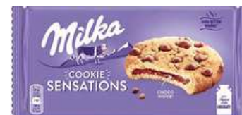
MILKA SENSATIONS CHOCO INS 156G 12/900