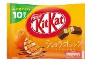
KITKAT - WAFER CHOCOLATE ORANGE 85G