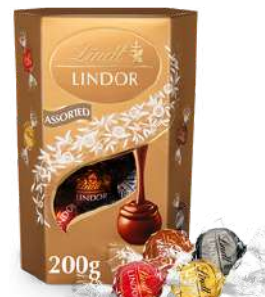
LINDT LINDOR ASSORTED 200G