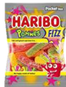
HARIBO POMMES FIZZ 100G