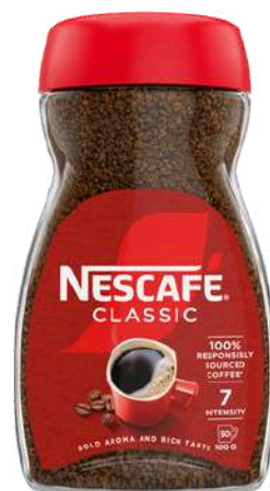
NESCAFE CLASSIC 200G