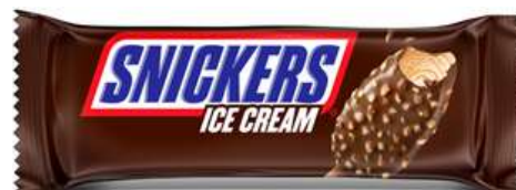
SNICKERS SINGLE ICE STICK 91ML 20/4560