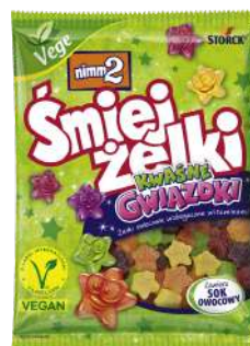
NIMM2 ŚMIEJŻELKI SOUR STARS 90G 24/2304