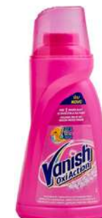
VANISH LIQUID 1L