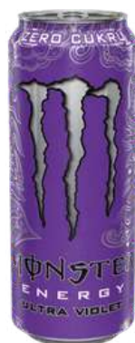
MONSTER ULTRA VIOLET ZERO 500ML 12/1440