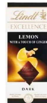
LINDT EXCELLENCE LEMON GINGER 100G 20/3600