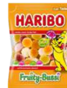
HARIBO FRUITY-BUSSI 100G 24/3360