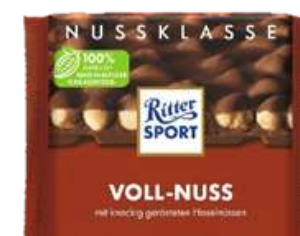
RITTER SPORT WHOLE NUT 100G 10/4000