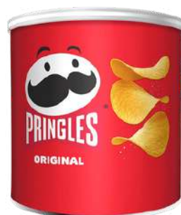
PRINGLES RANGEO OF FLAVOURS 40G 12/1728