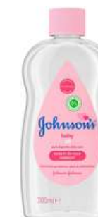
JOHNSON BABY REGULAR OLI 300ML