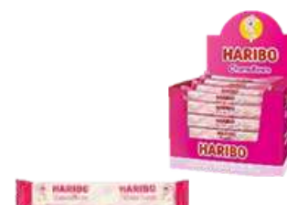
HARIBO CHAMALLOWS GIRODND0 11,6G 60/19200