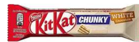
KIT KAT CHUNKY WHITE 40G 24/9672