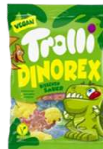
TROLLI DINOREX 100G 24/1728