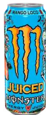
MONSTER JUICED MANGO LOCO 500ML 12/1728