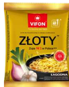
VIFON INSTANT SOUP GOLDEN CHICKEN 70G 24/4320