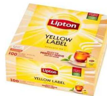
LIPTON YELLOW LABEL 100X1,5G