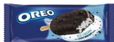
OREO ICE CREAM 90ML 20/3780