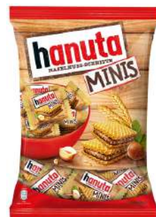
HANUTA MINIS 200G 12/504