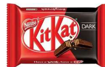
KIT KAT 4 FINGERS DARK 70% 41,5G 24/6720