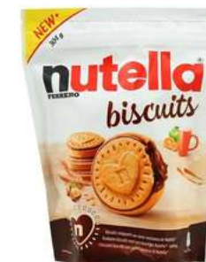
NUTELLA BISCUITS 304G 10/640