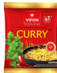
VIFON INSTANT SOUP CURRY CHICKEN 70G 24/4320