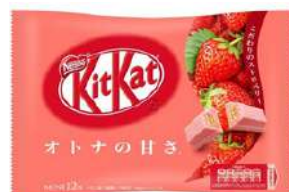
KITKAT - WAFER OTONA NO AMASA STRAWBERRY 124G