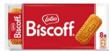
LOTUS BISCUITS 124G