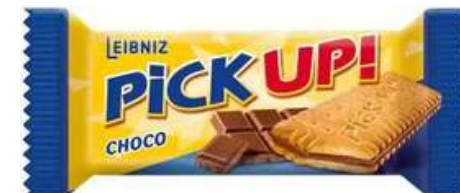
LEIBNIZ PICK UP CHOCO T10 28G 10/1100