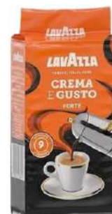
LAVAZZA CREMA E GUSTO FORTE 250G