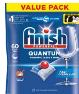
FINISH QUANTUM ALL IN 1 60PCS