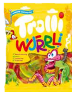
TROLLI WURRLI 100G 24/1728