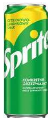
SPRITE ORIGINAL TASTE 330ML 24/2640