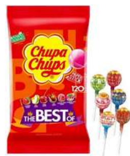
CHUPA CHUPS THE BEST OF 120PCS 6/288