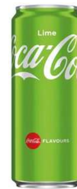
COCA COLA LIME 330ML 24/2640