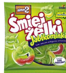
NIMM2 ŚMIEJŻELKI JABŁKOMINIKI 24/2016