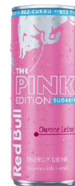
RED BULL THE PINK EDITION SUGARFREE 250ML 335ML