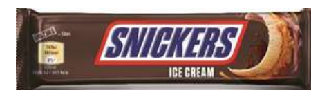
SNICKERS SINGLE INCE BAR 53ML 24/12600