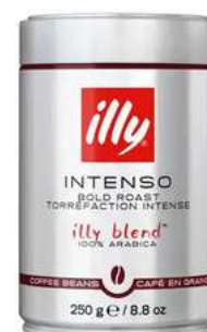
ILLY INTENSO WHOLE BEANS 250G