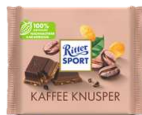
RITTER SPORT COFFEE CREAM & CORN FLAKES 100G 11/4400