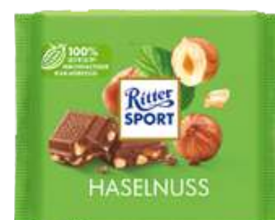
RITTER SPORT HAZELNUT 100G 12/4800