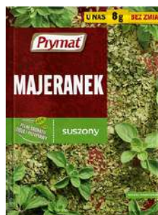
PRYMAT SEASONING MARJORAM 8G 20/4800