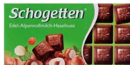
SCHOGETTEN MILK HAZELNUTS 100G 15/3960