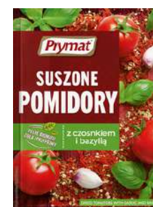
PRYMAT SEASONING SUN- DRIED TOMATOES 15G 25/9500