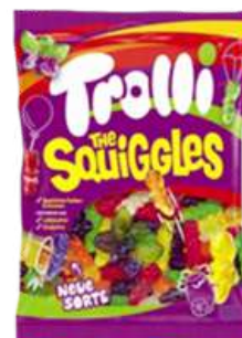
TROLLI SQUIGGLES 100G 30/2160