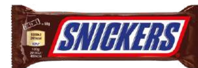
SNICKERS 50G 40/11760