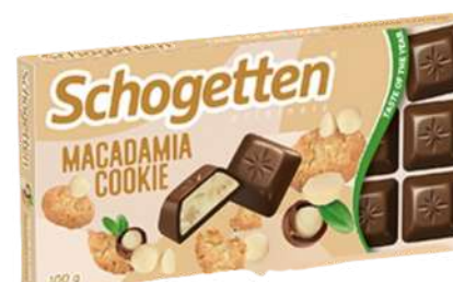
SCHOGETTEN MACADAMIA COOKIE 100G