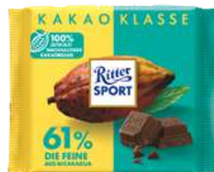
RITTER SPORT CACAO 61% NICARAGUA 100G 12/4800