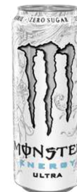
MONSTER ZERO ULTRA 500ML 12/1728