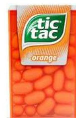
TIC TAC 18G 288/27648