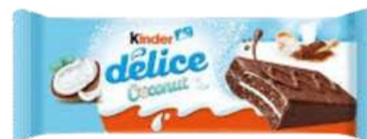
KINDER DELICE COCONUT TI 37G 20/8100