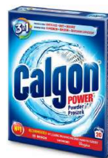
CALGON POWDER 500G