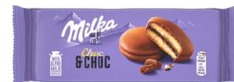
MILKA COOKIES CHOCO WAFER 150G 14/1008