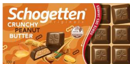
SCHOGETTEN CRUNCHY PEANUT BUTTER 100G 15/3960