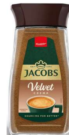
JACOBS VELVET 200G