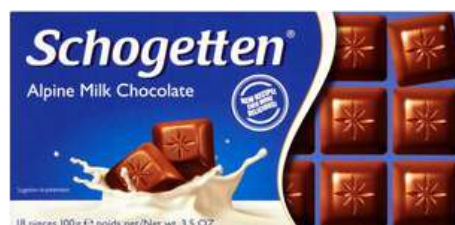
SCHOGETTEN ALPINE MILK CHOCOLATE 100G 15/3960