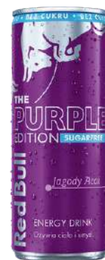
RED BULL PURPLE EDITION SUGARFREE 250ML 335ML