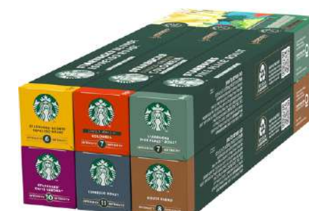
STARBUCKS RANGE OF FLAVOURS