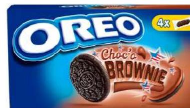
OREO BROWNIE 176G 12/1056