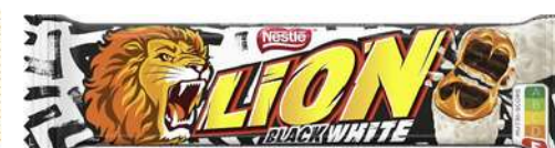
LION WHITE & BLACK 42G 40/5760