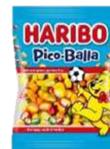
HARIBO PICO-BALLA 85G 30/3780