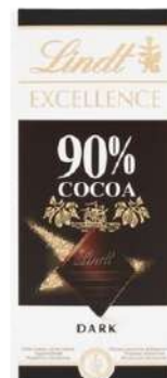
LINDT EXCELLENCE 90% COCOA 100G 20/3600