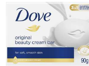
DOVE SOAP CREAM 90G 12/1440