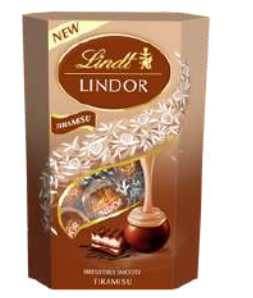
LINDT LINDOR TIRAMISU 200G