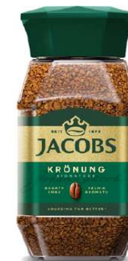
JACOBS KRÖNUNG 100G