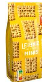
LEIBNIZ MINIS -30% SUGER 125G