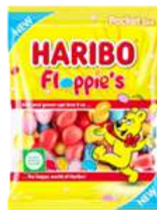
HARIBO FLOPPIES 80G 24/3360