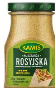
KAMIS MUSTARD ROSYJSKA 180G 8/2240