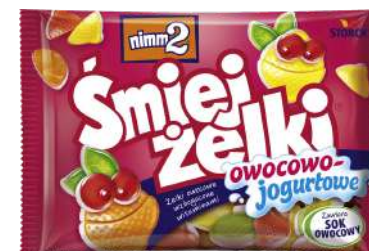
NIMM2 ŚMIEJŻELKI JOGURT FRUIT 100G