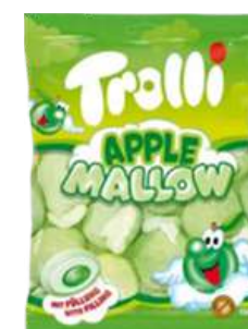
TROLLI MARSHMALLOWS APPLE 150G