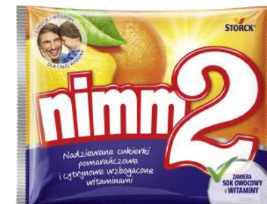
NIMM2 CANDIES 90G