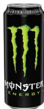
MONSTER ORIGINAL 500ML