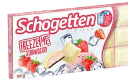
SCHOGETTEN FREEZE ME - STRAWBERRY 100G