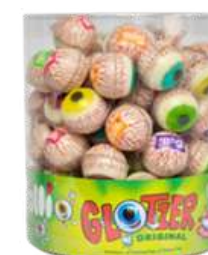
TROLLI FILLED EYEBALLS 80X18G