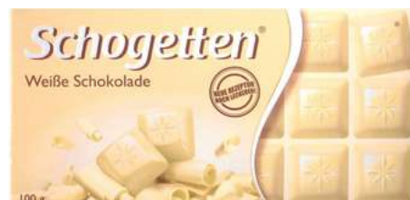
SCHOGETTEN WHITE CHOCOLATE 100G 15/3960