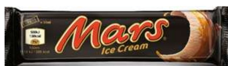
MARS SINGLE ICE BAR 51ML 24/12600