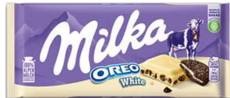
MILKA OREO WHITE 100G 22/6600