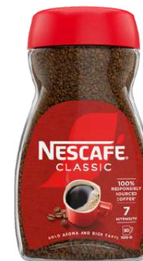
NESCAFE CLASSIC 100G