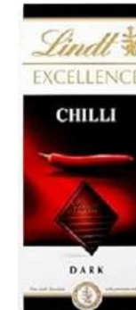
LINDT EXCELLENCE CHILI 100G 20/3600