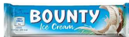
BOUNTY SINGLE ICE BAR 50,1ML 24/10800