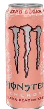
MONSTER ULTRA PEACHY KEEN ZERO 500ML 12/1440