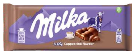
BUBBLY CAPPUCINO 97G 15/4500