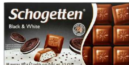
SCHOGETTEN BLACK & WHITE 100G 15/3960