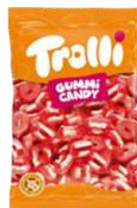
TROLI DRACULA 1000G