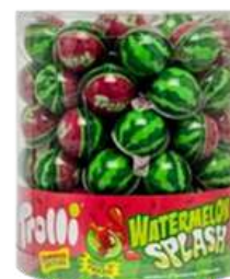
TROLLI FILLED WATERMELON 80X18G