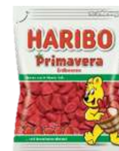
HARIBO PRIMAVERA 100G