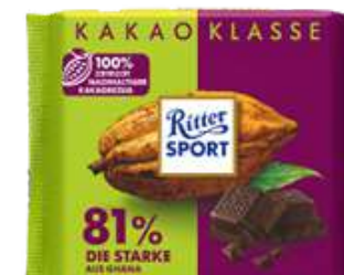
RITTER SPORT CACAO 81% GHANA 100G 12/4800