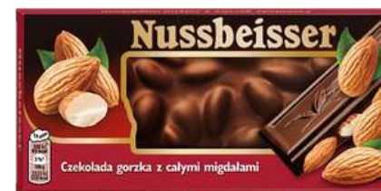
NUSSBEISSER DARK ALMOND 100G 20/5760