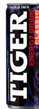
TIGER CLASSIC 250ML