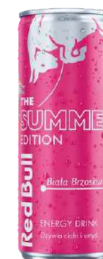
RED BULL SUMMER EDITION 250ML 24/2592