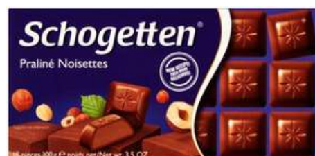
SCHOGETTEN PRALINÉ NOISETTES 100G 15/3960