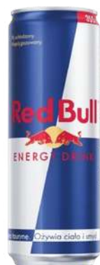
RED BULL ENERGY DRINK 250ML 335ML 473ML 24/2592