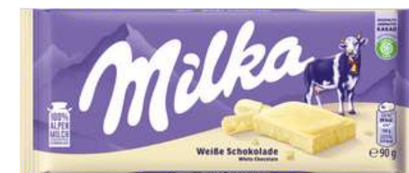
MILKA WHITE 90G 25/6600