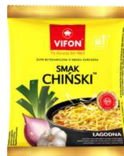
VIFON INSTANT SOUP CHINESE CHICKEN 70G 24/4320