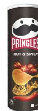
PRINGLES HOT&SPICY 165G