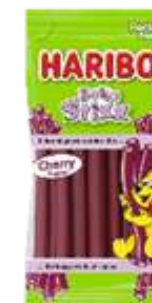
HARIBO BALLA STIXX CHERRY 80G 24/3120