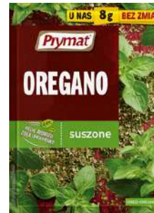
PRYMAT SEASONING OREGANO 8G 20/7600