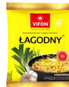
VIFON INSTANT SOUP MILD 70G 24/4320