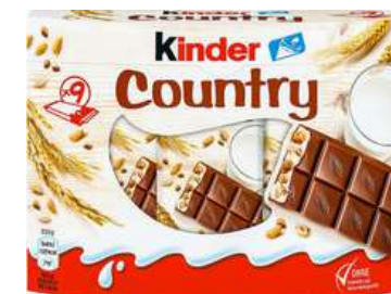
KINDER COUNTRY T9 211,5G 18/1440