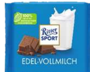
RITTER SPORT EDEL-FINE MILK CHOCOLATE 35% COCOA 100G 12/4800