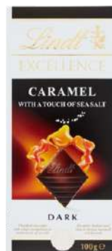
LINDT EXCELLENCE CARAMEL SEA SALT CEE 100G 20/3600