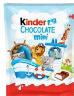
KINDER CHOCOLATE MINI 120G 16/896