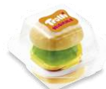
TROLLI HAMBURGER 60X10G