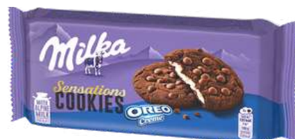
MILKA SENSATIONS OREO 156G 12/900