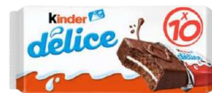
KINDER DELICE T10 390G 14/784