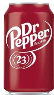
DR PEPPER CLASSIC 355ML