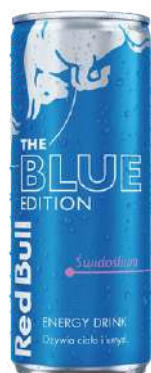
RED BULL BLUE EDITION 250ML 24/2592