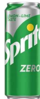
SPRITE ZERO 330ML 24/2640