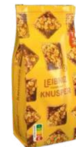
LEIBNIZ KNUSPER SNACK CORNFLAKES 150G