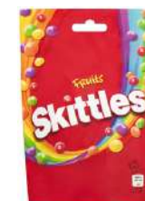
SKITTLES RANGE OF FLAVOURS 92G 18/4860