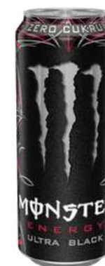
MONSTER ULTRA BLACK ZERO 500ML 12/1728