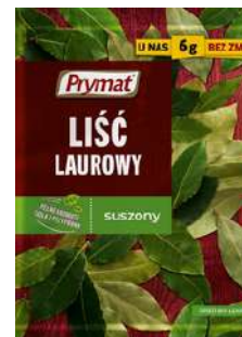
PRYMAT SEASONING BAY LEAF 6G 20/4800