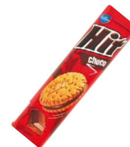
BAHLESEN HIT CHOCO 220G 24/1296