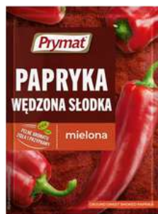
PRYMAT SEASONING PAPRIKA 20G 25/9500