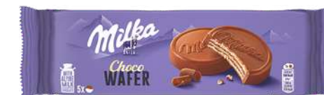
MILKA YOGHURT 100G 23/6900