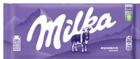
MILKA ALPINE MILK 90G 25/7500