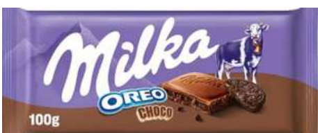
MILKA OREO CHOCO 100G 22/6600