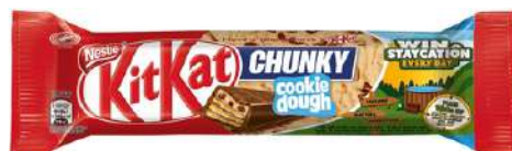
KIT KAT CHUNKY COOKIE 42G 24/8184