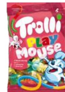
TROLLI PLAYMOUSE 100G 22/1584