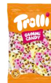
TROLI MILK COW 1000G