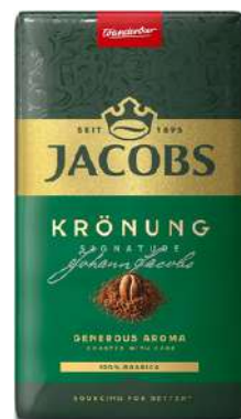
JACOBS KRONUNG 250G