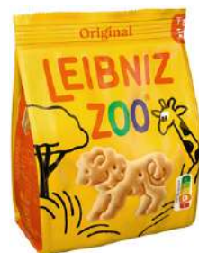
LEIBNIZ ZOO ORIGINAL 125G 12/576