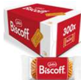
LOTUS BISCUITS 50X6,25G 312,5G