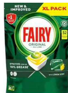
FAIRY DISHWASHER CAPS PLATINUM LEMON