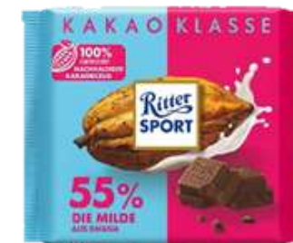
RITTER SPORT CACAO 55% GHANA 100G 12/4800