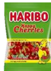
HARIBO HAPPY CHERRIES 100G