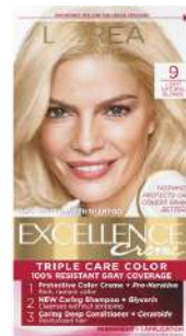
L'OREAL EXCELLANCE NATURAL COLORS