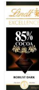
LINDT EXCELLENCE 85% COCOA 100G 20/3600