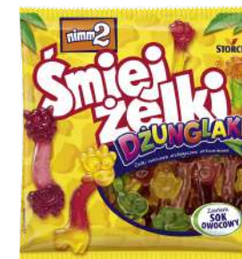
NIMM2 ŚMIEJŻELKI DŻUNGLAKI 90G 24/2592