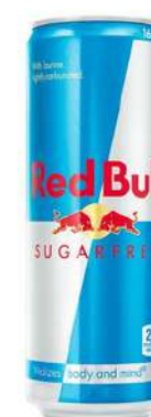
RED BULL SUGARFREE 250ML 335ML 24/2112