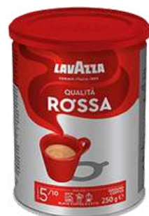
LAVAZZA TIN QUALITA ROSSA 250G 12/1080