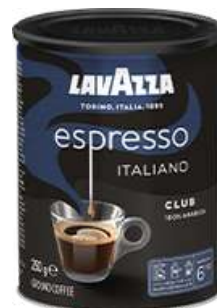
LAVAZZA TIN ESPRESSO ITALIANO CLUB 250G 12/1080