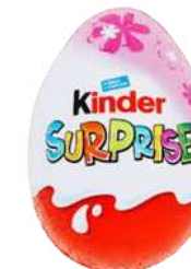
KINDER SURPRISE EGG PINK 20G 72/9216