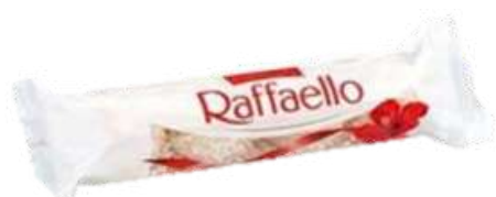
RAFFAELLO T4 40G 64/5120