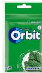
ORBIT BAG RENG OF FLAVOURS 22G 22/6776