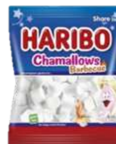
HARIBO CHAMALLOWS BARBECUE 100G 30/2160