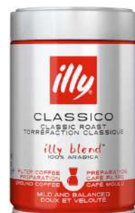
ILLY CLASSICO FILTER GROUND 250G