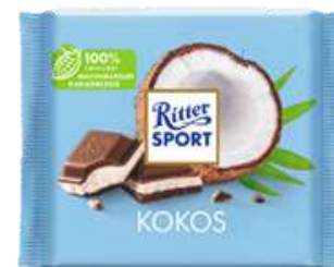
RITTER SPORT COCONUT 100G 12/4800