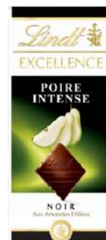
LINDT EXCELLENCE PEAR INTENSE 100G 20/3600