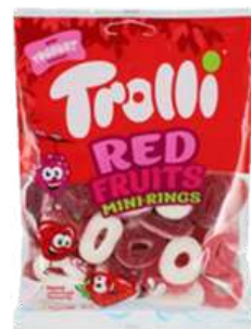
TROLLI RED FRUITS 200G