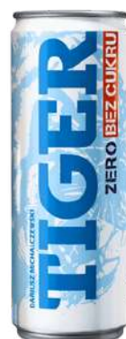
TIGER ZERO 250ML