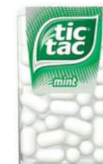
TIC TAC 49G 24/9216