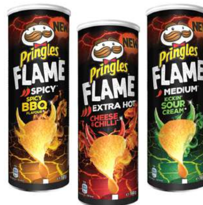
PRINGLES FLAME EDITION