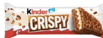
KINDER CRISPY TI 34G 14/3080