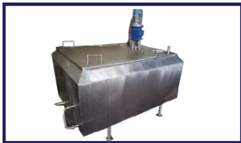
HORIZONTAL MILK STORAGE TANK