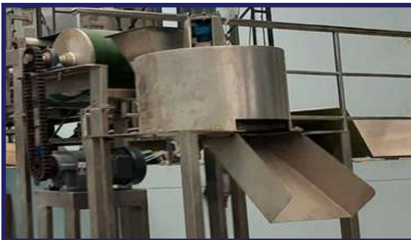
COCONUT KERNEL SLICER