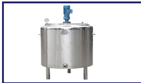
TANK WITH AGITATOR