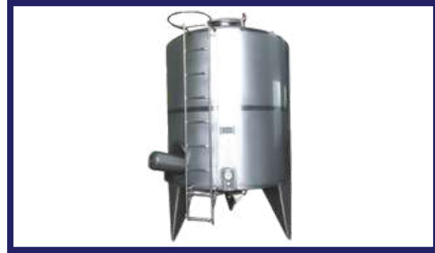
VERTICAL STORAGE TANKS