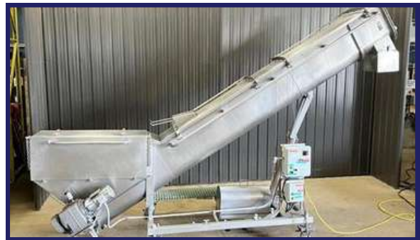
SCREW CONVEYOR WITH WASHING ARRANGEMENT