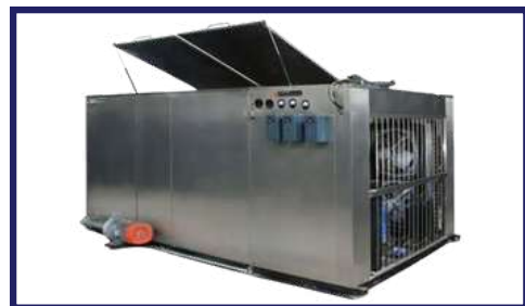
ICE BANK TANK (IBT)