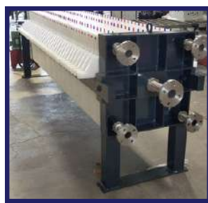
FILTER PRESS WITH FOOD GRADE PP PLATES