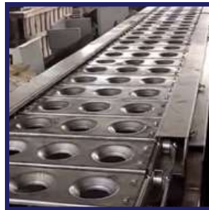
COCONUT WATER EXTRACTION CONVEYOR