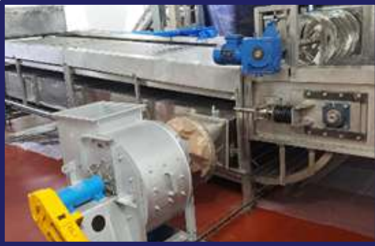
MESH BELT COOLER