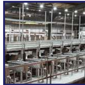
COCONUT DRILLING UNIT