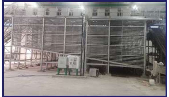
NUTS STORAGE BIN