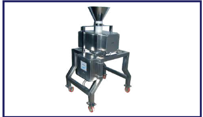
GRAVITY FEED METAL DETECTION SYSTEM FOR DRY POWDER