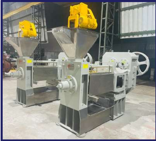
VCO OIL EXPELLER HIGH CAPACITY