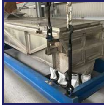
NOVATEX (HIGH CAPACITY) SORTING MACHINE