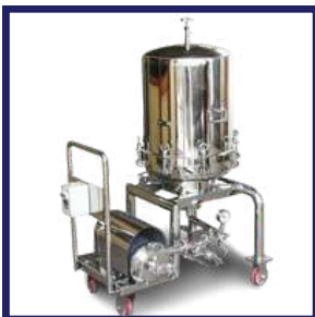
SPARKLER FILTER (POLISH FILTER)