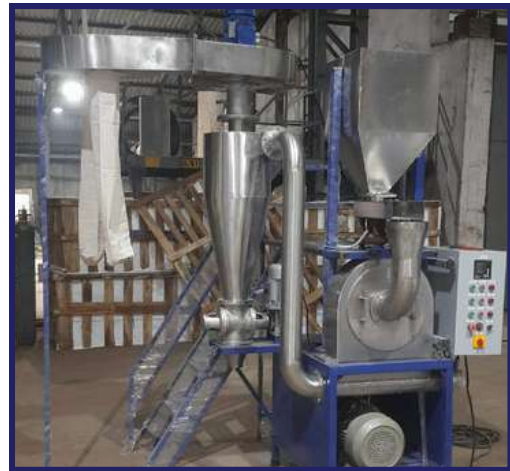
COCONUT FLOUR GRINDING MACHINE