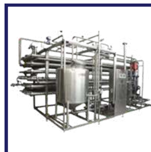
ASEPTIC WATER PLANT