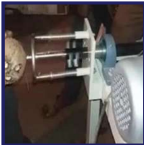
COCONUT WATER DRILLING MACHINE