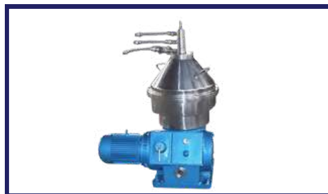
CENTRIFUGE FOR CREAM