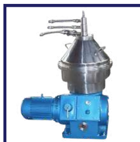
CENTRIFUGE FOR VIRGIN COCONUT OIL