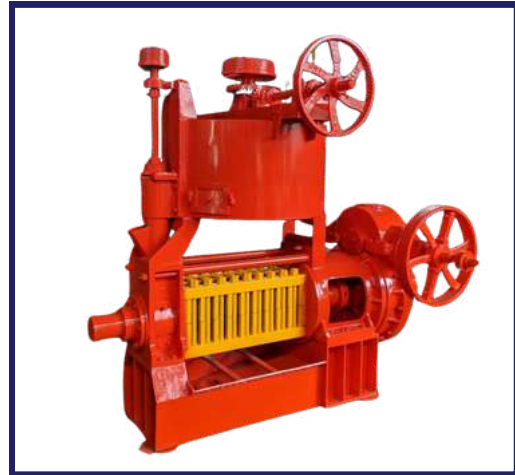
PARING OIL EXPELLER