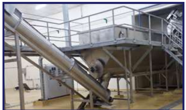
STORAGE TANK (MEAT TANK)