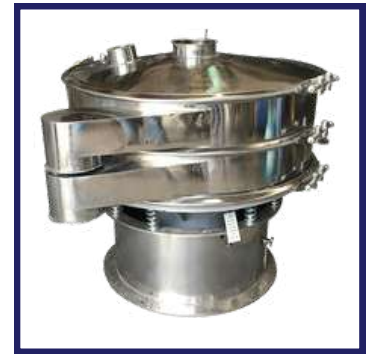
VIBROSCREEN GRADING MACHINE