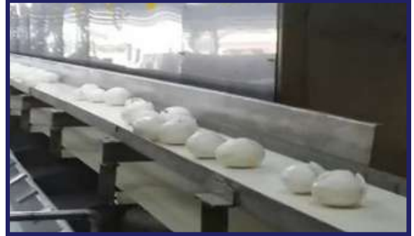
KERNEL CARRYING CONVEYOR