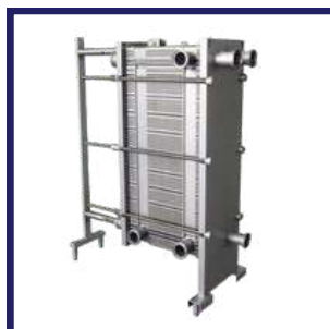
CHILLING PHE FOR COCONUT WATER