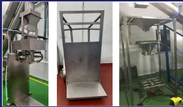
AUTOMATIC BATCH WEIGHER