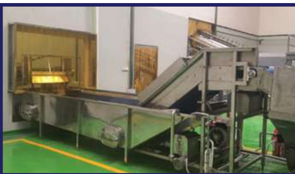
COCONUT BUBBLE WASHER