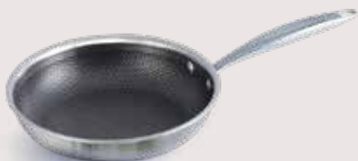
Frypan without Glass Lid