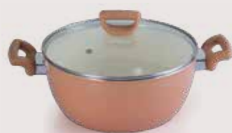
Belly Casserole with Glass Lid