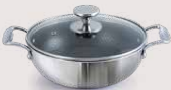
Karai with Glass Lid