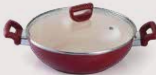
Karai with Glass Lid