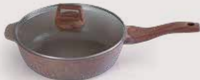
Deep Frypan with Glass Lid