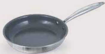
Frypan without Glass Lid