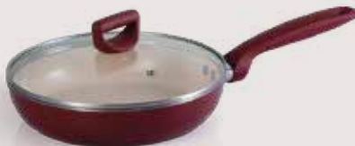
Frypan with Glass Lid