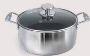
Straight Casserole with Glass Lid