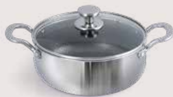
Belly Casserole with Glass Lid