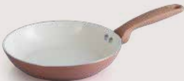
Frypan without Glass Lid