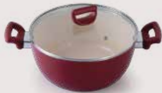
Belly Casserole with Glass Lid