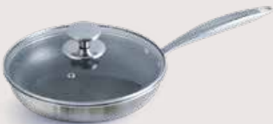
Frypan with Glass Lid