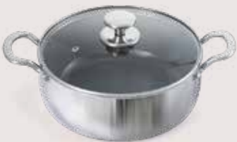
Belly Casserole with Glass Lid