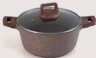
Casserole with Glass Lid