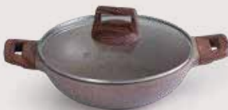
Karai with Glass Lid