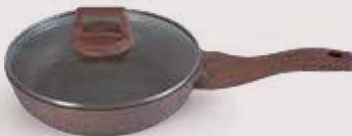
Frypan with Glass Lid