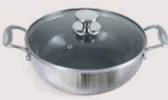
Karai with Glass Lid