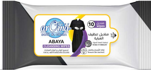
Width 16cm x Height 8cm Capacity 10 Sheets