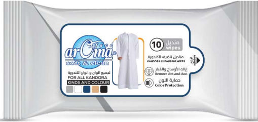
Width 16cm x Height 8cm Capacity 10 Sheets