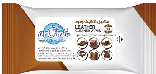
Width 16cm x Height 8cm Capacity 10 Sheets