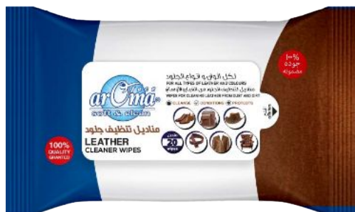
Width 16cm x Height 8cm Capacity 20 Sheets