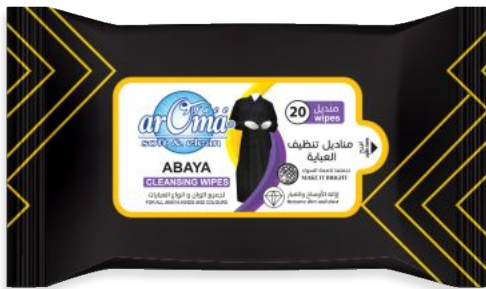
Width 16cm x Height 8cm Capacity 20 Sheets