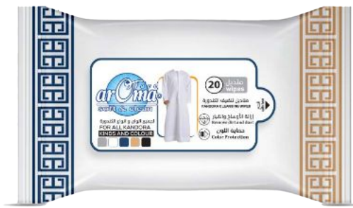
Width 16cm x Height 8cm Capacity 20 Sheets