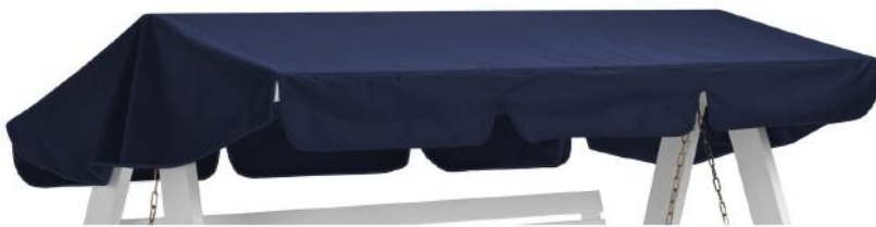
EW 0954-9 (3 seater)