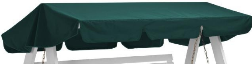
EW 0955-11 (2 seater)

Deluxe deckswing canopy in durable polyester fabric from Eden Wood PU-coated for enhanced water resistance.