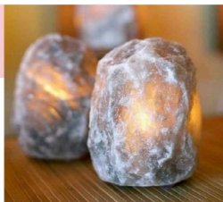
Gray Natural Salt Lamp