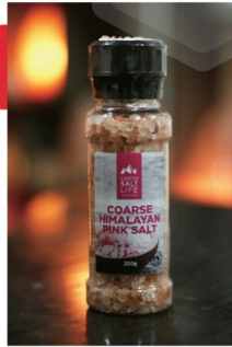
200 – 225g Grinder with Plastic Top