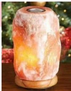
Natural Salt Lamp with Aroma Diffuser Cup