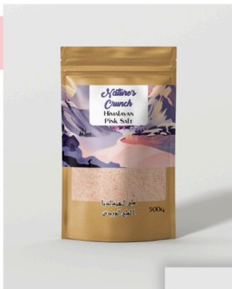
500g Paper Bag