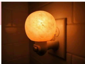
Salt Night Light