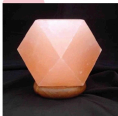
Geometrical Salt Lamp in Different Shapes