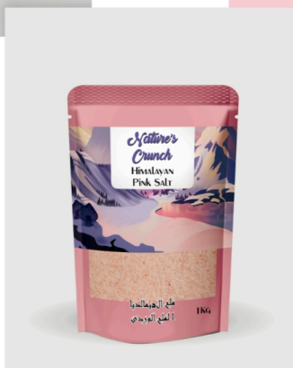
1 Kg Standup Pouch