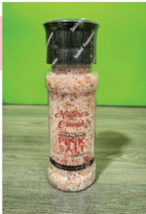
200 – 225g Grinder with Ceramic Top