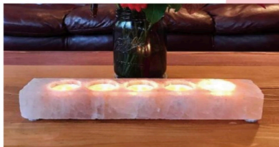
Salt Slab with 5 Linear Tealights for Ambience