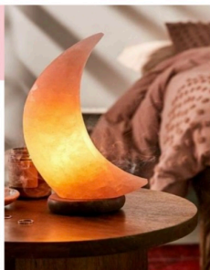
Moon Salt Lamp for Bedside