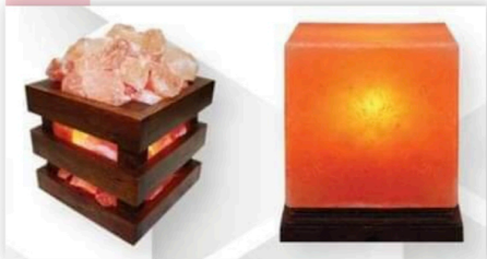
Cube Salt Lamp and Wooden Case Salt Lamp with Chunks