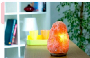
Mini Natural Salt Lamp