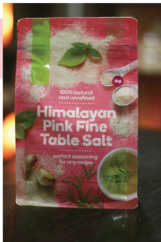
1 kg Pouch