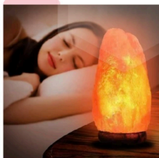
Natural Salt Lamp 4 ~ 5kg