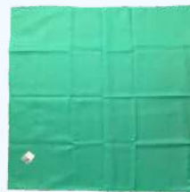
Plain Sheet Code : OTLINEN - 045