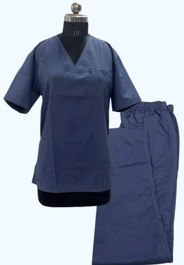
ROYAL BLUE Code : SSTTROYALBLUE - 106