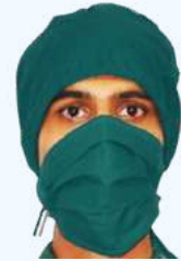
Cap & Mask Code : OTLINEN - 047