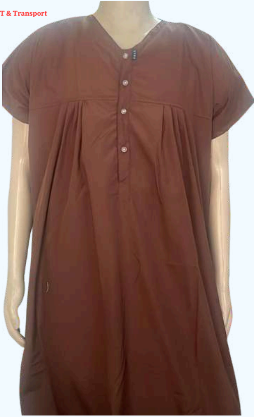
Mother Gown Code : PGMthr - 027