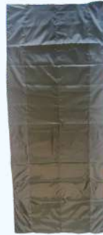
OT Table Sheet Code : OTLINEN - 050