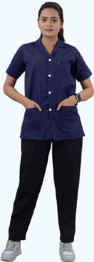
Apron Yogi Half Sleeves - Navy Blue Code : ApronHSYogi05NBlue - 020