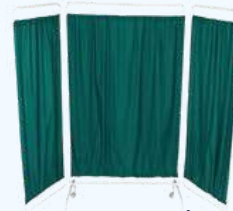
Screen Curtain Code : OTLINEN - 041