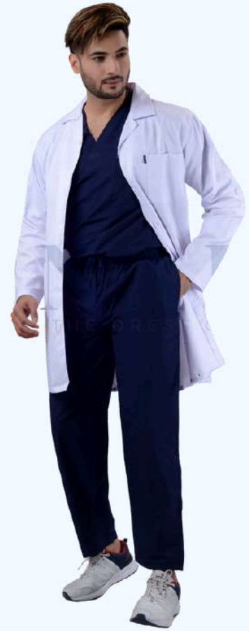
Lab Coat Knee length Full Sleeves Code : LCYogiFSKneelength - 019