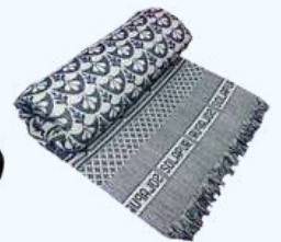
Code : Chorsa- 073