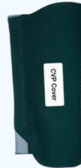
CVP Cover Code : OTLINEN - 051