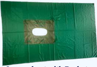
Lapro sheet with Pockets Code : OTLINEN - 039