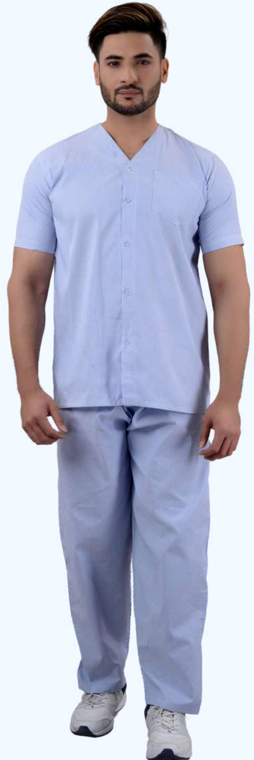
Patient Dress- set of Top & bottom Code : PDDBL - 026