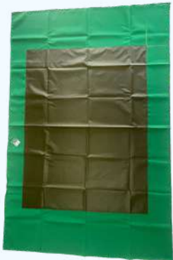
Trolley Cover Code : OTLINEN - 048