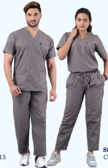
Steel Grey Code : SSTTSteelGrey - 016