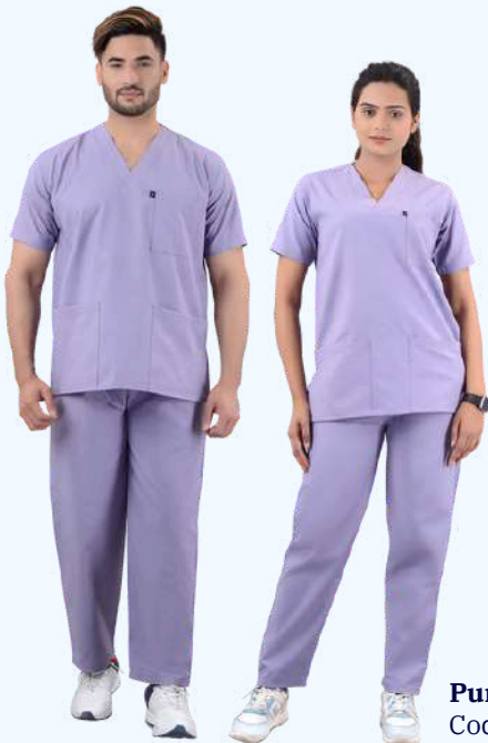
Purple Code : SSTTPurple - 013