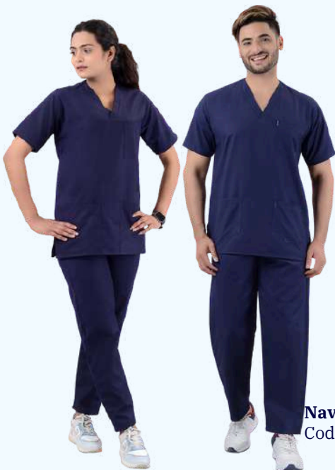
Navy Blue Code : SSTT05NBlue - 015