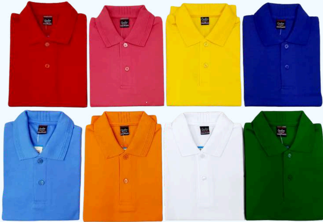
Polo T Shirt