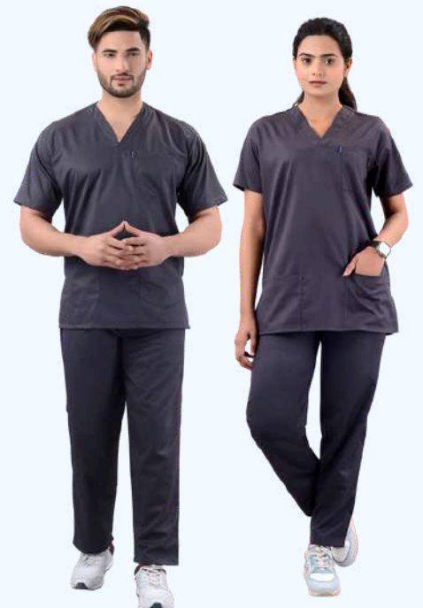
Dark Grey Lycra Code : SS2WDGL - 010