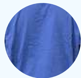
Code : Royal Blue 112