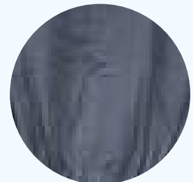
Code : Grey 111