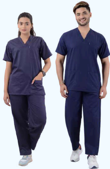
Navy Blue Lycra Code : SS2W05 - 009