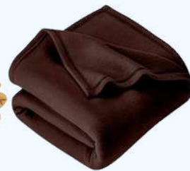
Code : Blanket- 072