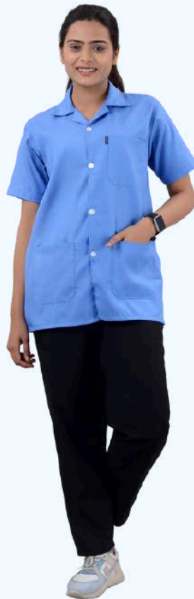
Apron Yogi Half Sleeves - Sky Blue Code : ApronHSYogi02SBlue - 021