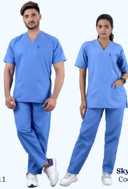
Sky Blue Code : SSTT02Skyblue - 012