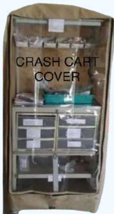
Crash Cart Code : OTLINEN - 053