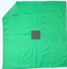
Hole Sheet Code : OTLINEN - 044