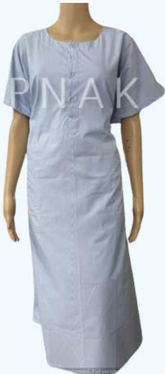
Front Open Code : PGFO- 025