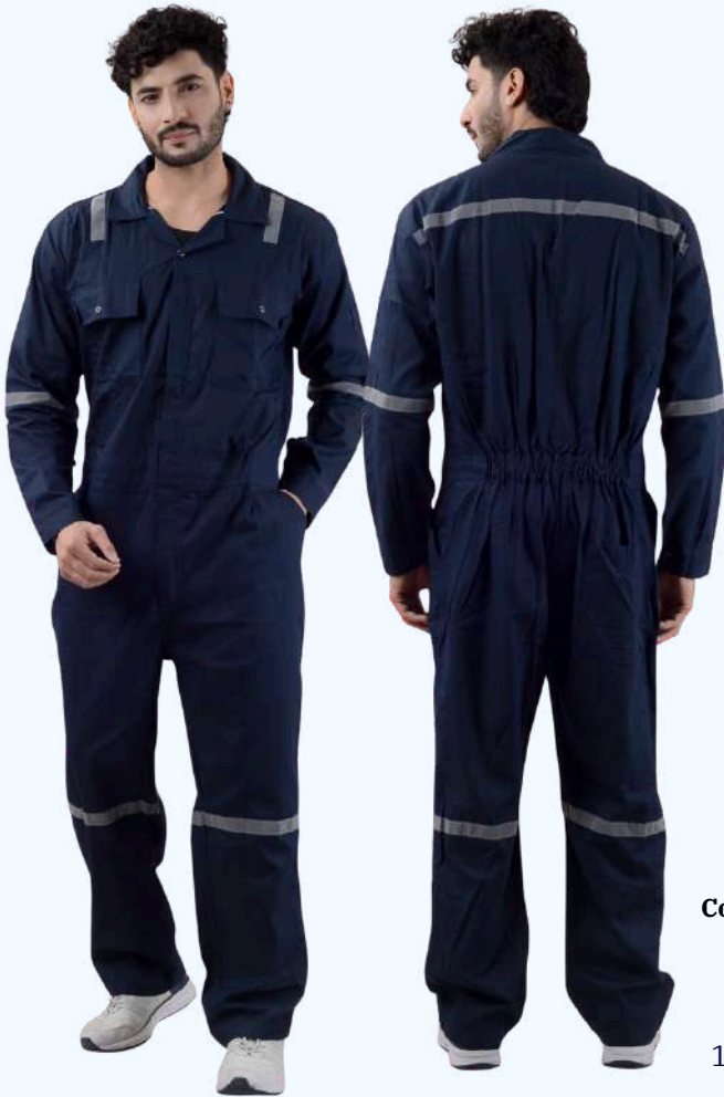
Code : Navy Blue 107