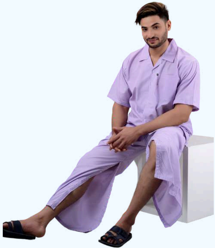
TKR Code : PDTKR - 030