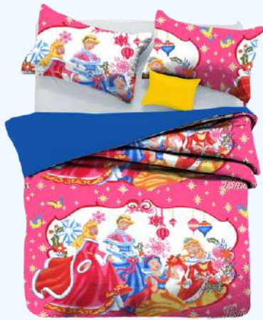
Code : PediaBedLinen- 066