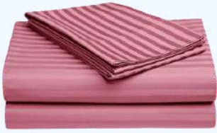
Code : BedLinen- 059