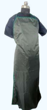
Procedure Apron Code : OTLINEN - 052