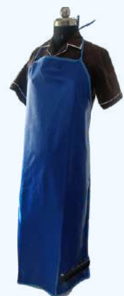
Procedure Apron - Raxin Code : OTLINEN - 058