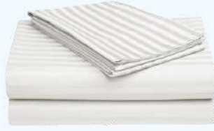
Code : BedLinen- 060