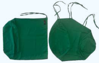
C Arm /IITV Cover Code : OTLINEN - 040