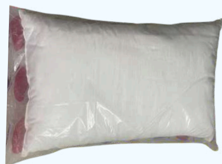
Pillow - Recron Code : Blanket- 075