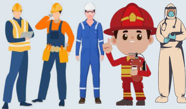
Industrial & Pharma