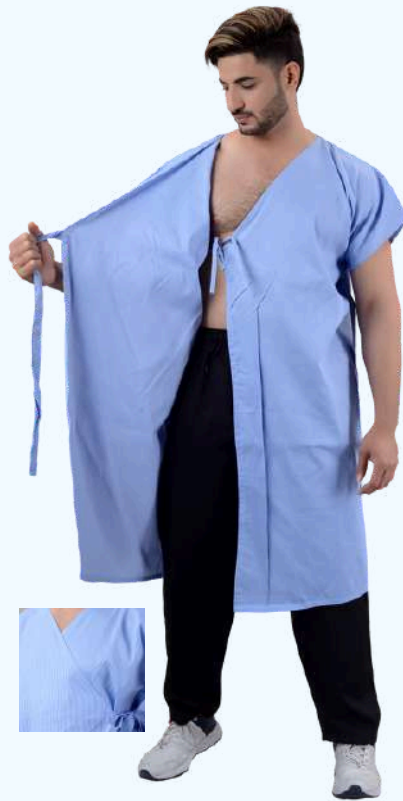
Bath Robe Code : PGBRDBL - 024