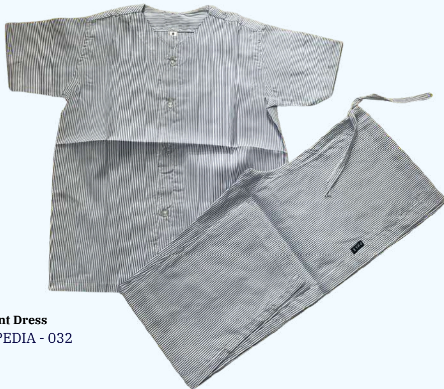
Pedia Patient Dress Code : PDPEDIA - 032