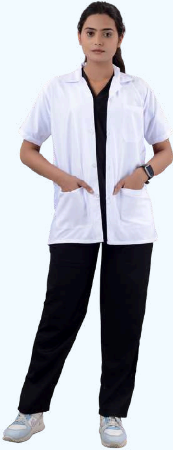
Apron Yogi Half Sleeves Code : ApronHSYogi - 017