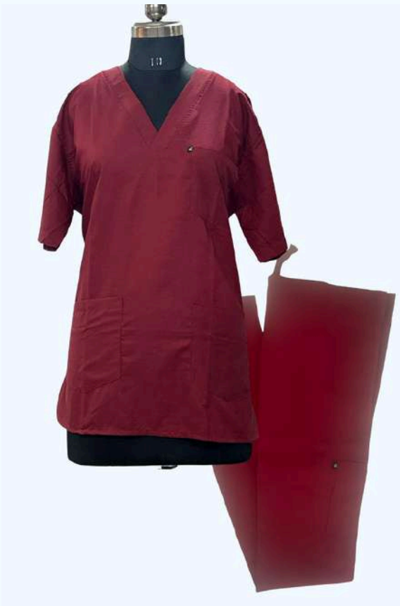
Maroon Code : SSTTMaroon - 103