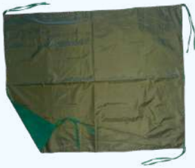
Draw sheet - Impervious Code : OTLINEN - 043