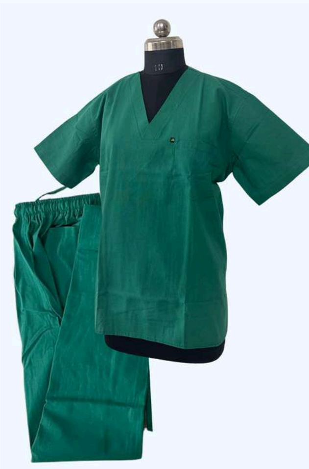
ROYAL BLUE Code : SSTTROYALBLUE - 105