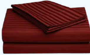
Code : BedLinen- 063