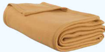
Code : Blanket- 071