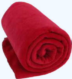
Code : Blanket- 069