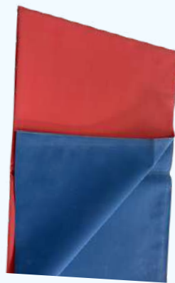
Mackintosh Code OTLINEN - 055