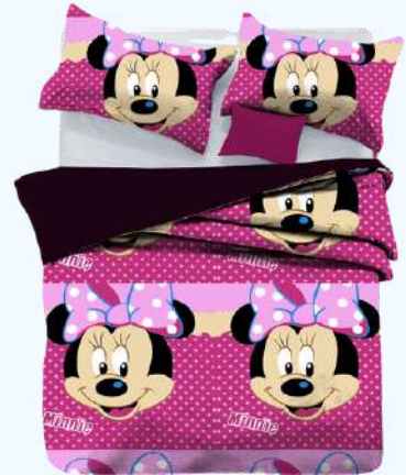
Code : PediaBedLinen- 068