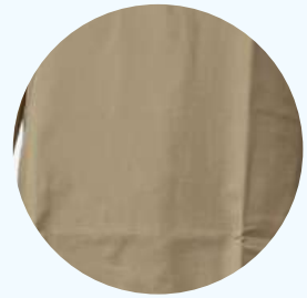
Code : Khakhi 109