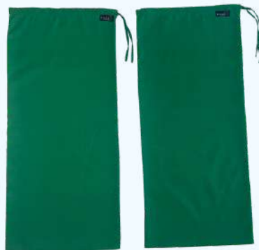
Leggins Code : OTLINEN - 054