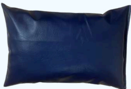
Pillow with Stiche Raxin Cover Code : Blanket- 074