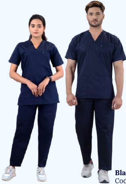
Black Code : SSTTBLACK - 011