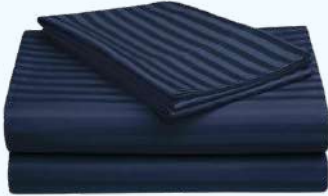
Code : BedLinen- 062