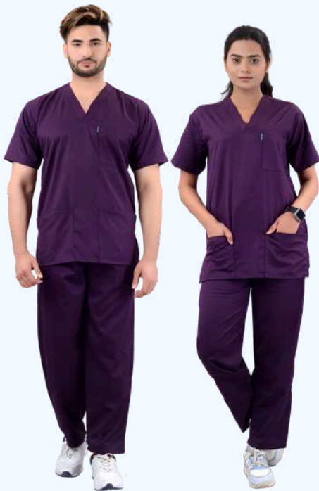
Wine Lycra Code : SS2WWine - 006