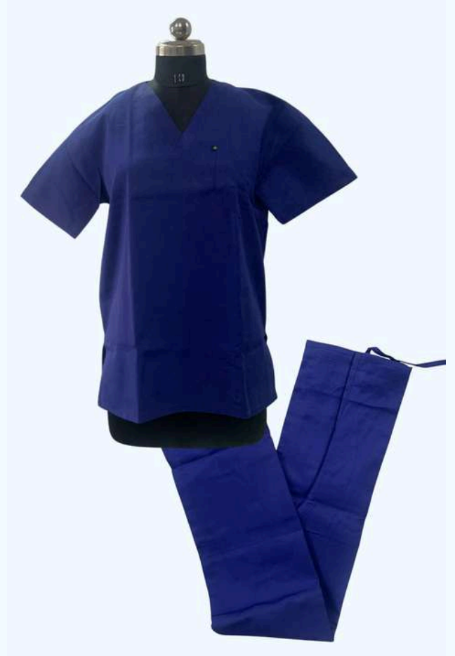
ROYAL BLUE Code : SSTTROYALBLUE - 104