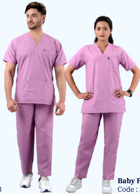
Baby Pink Code : SSTTBabypink - 014