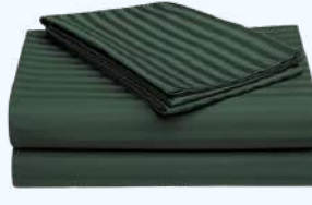
Code : BedLinen- 061