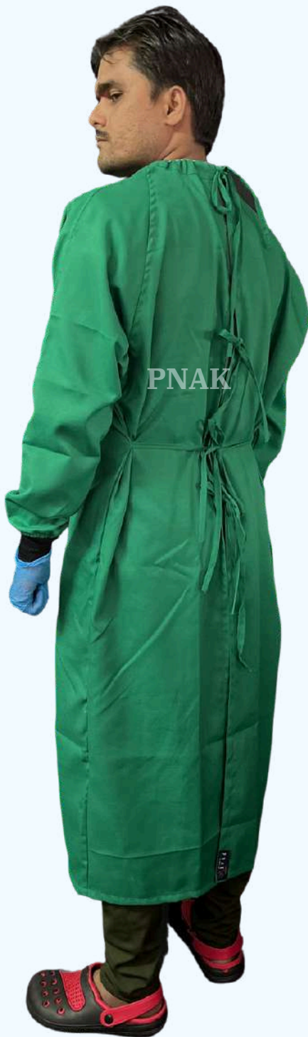
Surgeon Gown- Back Tie Code : SGPVAL - 036