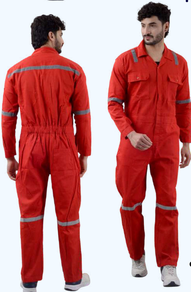
Code : Red 108