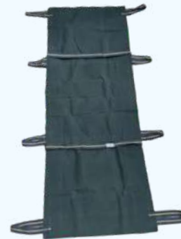
Stretcher Code : OTLINEN - 056 Code : OTLINEN - 057