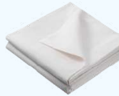
Cuffon Code : OTLINEN - 046