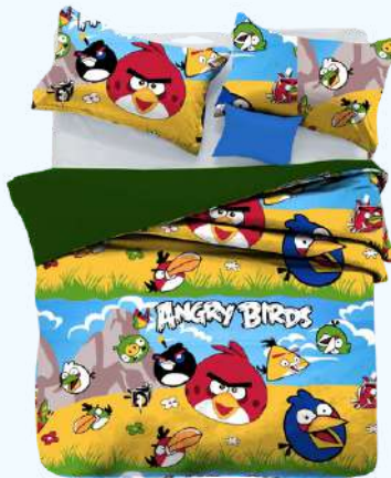
Code : PediaBedLinen- 067