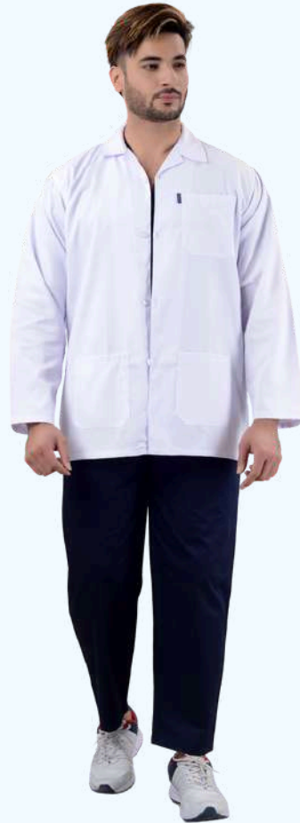
Apron Yogi Full Sleeves Code : ApronFSYogi - 018