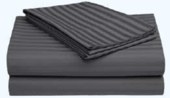
Code : BedLinen- 065