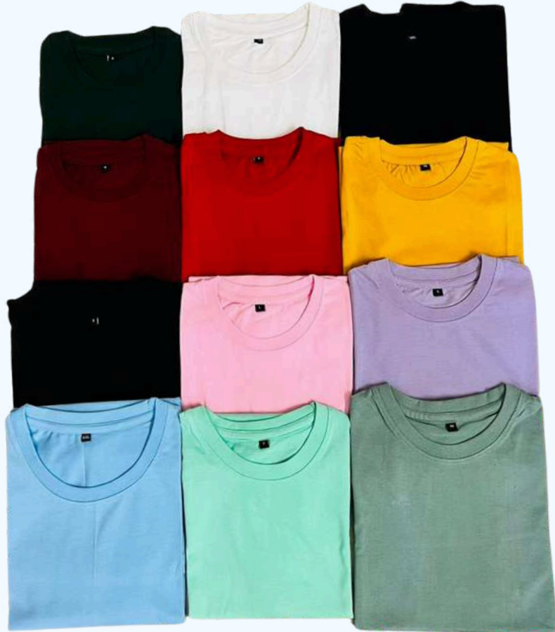
Round Neck - Eco