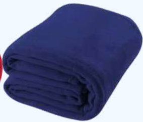
Code : Blanket- 070