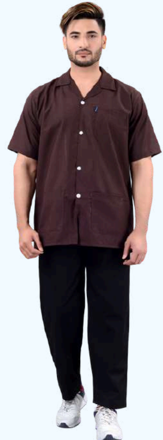
Apron Yogi Half Sleeves - Coffee Code : ApronHSYogiCoffee - 022