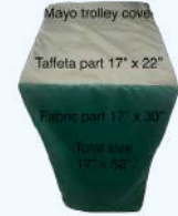
Mayo Trolley Cover Code : OTLINEN - 042