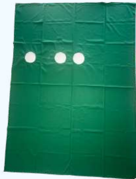
Cath Lab Hole Sheet Code : OTLINEN - 049