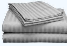
Code : BedLinen- 064