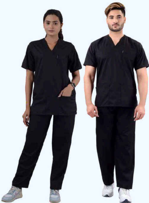
Black Lycra Code : SS2WBlack - 007