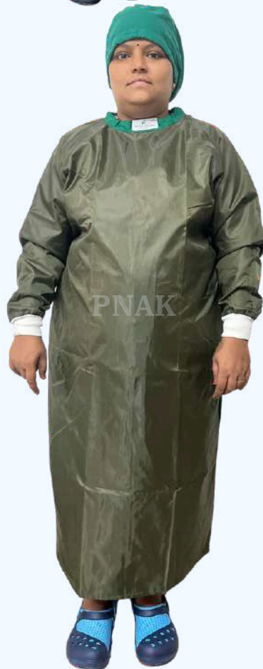
Impervious Surgeon Gown- Back Tie Code : ISGPVAL - 037