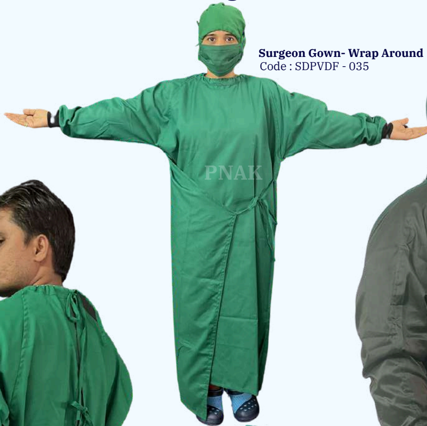
Surgeon Gown- Wrap Around Code : SDPVDF - 035