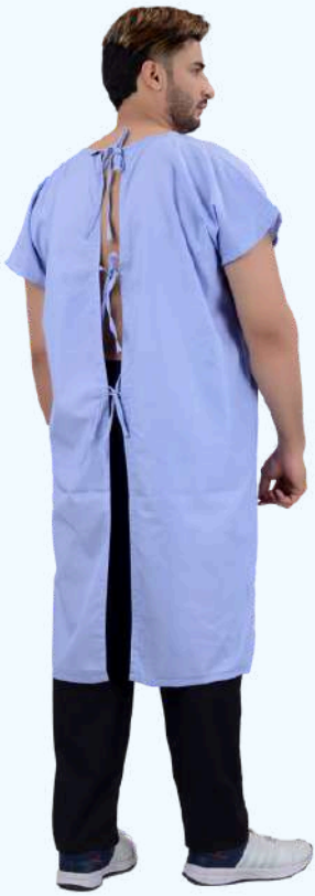
Back Tie Code : PGBDDL - 023