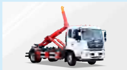
HOOK LOADER GARBAGE TRUCK