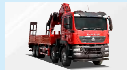
KNUCKLE BOOM CRANE