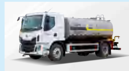
WATER SPRINKLER TRUCK