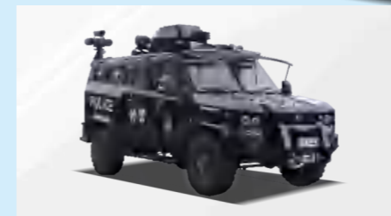
ARMORED RIOT CONTROL VEHICLE