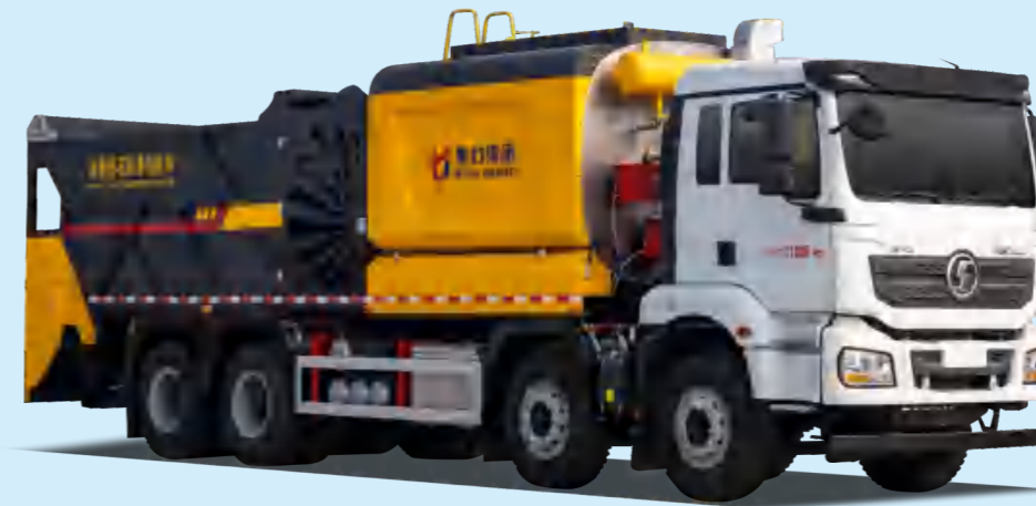
ASPHALT GRAVEL SYNCHRONOUS SEALING VEHICLE

Kailifeng road maintenance series covers cement slurry spreading truck, asphalt spreading truck, synchronous gravel sealing truck, hot recycled asphalt pavement maintenance truck, anti-collision buffer truck and other types of vehicles, which is used in the construction of cement pavement, asphalt pavement, bridge deck and safety protection of construction personnel.