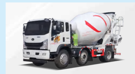
CONCRETE MIXER TRUCK