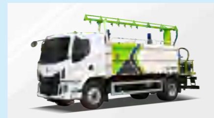
RAILWAY DUST SUPPRESSION TRUCK