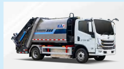
EV COMPACTOR GARBAGE TRUCK