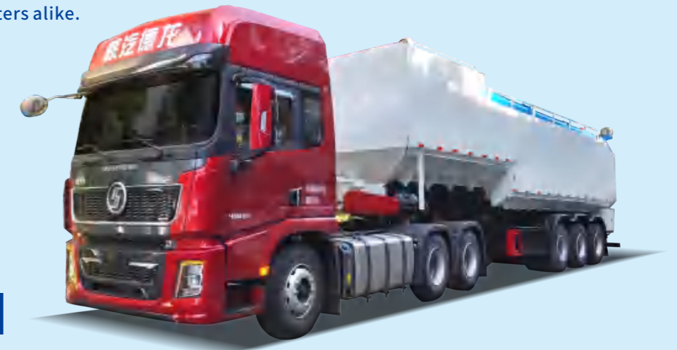
BULK FEED TRANSPORT TRUCK

KAILI's Livestock Trucks are engineered to ensure the safe and efficient transportation of animals. Designed with state-of-the-art features, these trucks provide optimal comfort and security for livestock during transit. Our vehicles are equipped with advanced ventilation systems, durable flooring, and easy-to-clean interiors to meet the highest standards of animal welfare and hygiene. With a focus on reliability and performance, KAILI Livestock Trucks support the seamless movement of livestock, enhancing operational efficiency for farmers and transporters alike.