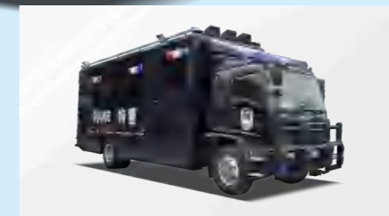
POLICE COMMUNICATIONS COMMAND VEHICLE