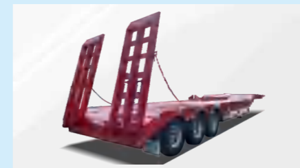
DROP DECK TOW TRUCK