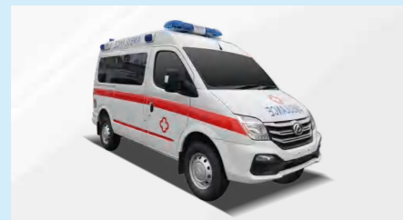
SHORT WHEELBASE TRANSFER AMBULANCE