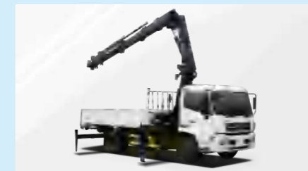
ARTICULATING TRUCK MOUNTED CRANE