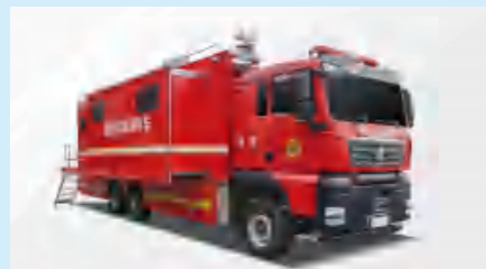
FIRE CHIEF TRUCK