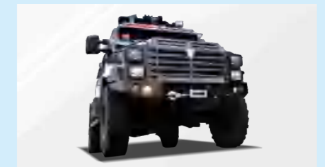
SABRETOOTH ARMORED EXPLOSION-PROOF VEHICLE