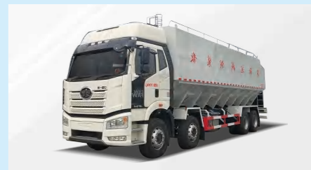
BULK FEED TRANSPORT TRUCK