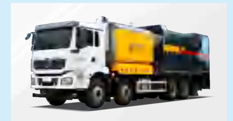
FIBER SYNCHRONOUS SEALING TRUCK