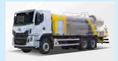
DUST SUPPRESSION TRUCK