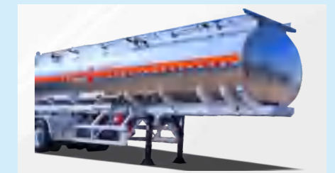
ALUMINUM TANK TRUCK