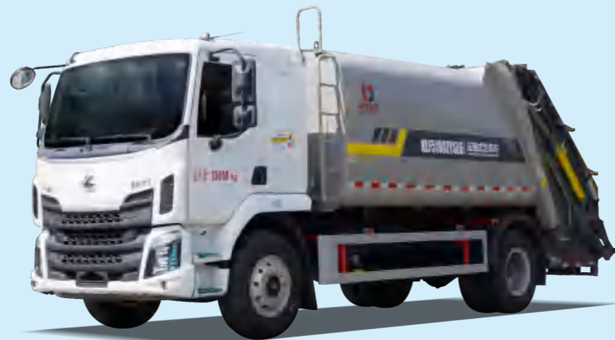
COMPACTOR GARBAGE TRUCK

KAILI Special Vehicles offers a range of advanced garbage trucks designed to meet the diverse needs of waste management. Our garbage trucks are engineered with cutting-edge technology to ensure reliability, efficiency, and durability in handling various types of waste.