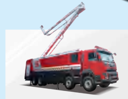
WATER TOWER FIRE TRUCK