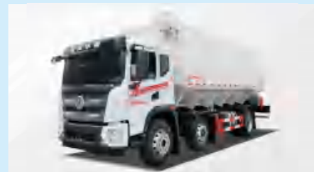
BULK FEED TRANSPORT TRUCK