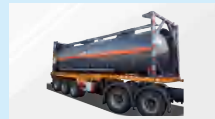
CARBON STEEL TANK TRUCK