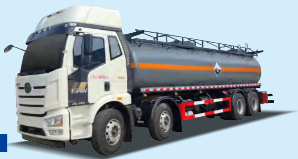
OIL TANK TRUCK

The Kaili Tanker Truck Series is a diverse and robust collection of vehicles designed to transport various types of liquids and gases safely and efficiently. These tanker trucks are engineered with precision, using high-quality materials and advanced technologies to ensure optimal performance and reliability in demanding conditions.