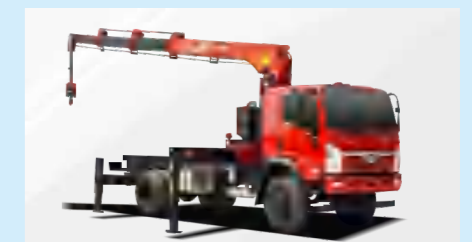
PALFINGER STIFF BOOM CRANE - PALFINGER