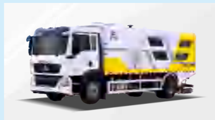
ROAD POLLUTION REMOVAL TRUCK