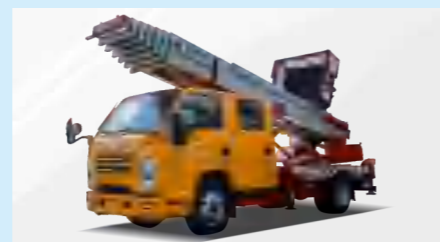
TELESCOPIC BOOM LIFT TRUCK