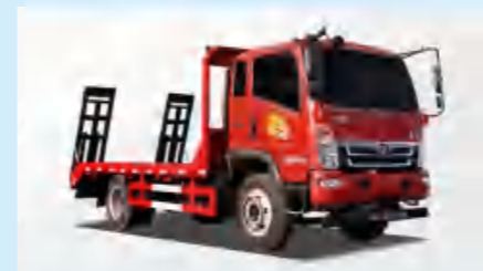
FLATBED TOW TRUCK