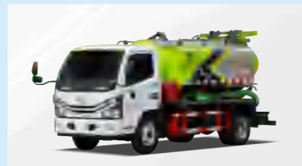
VACUUM SEWAGE TRUCK