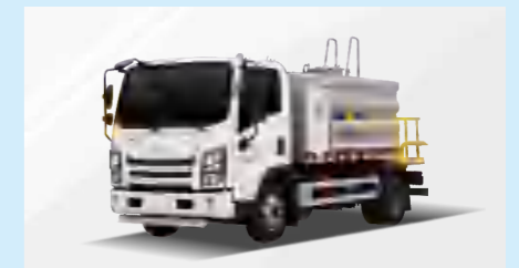
DUST SUPPRESSION TRUCK