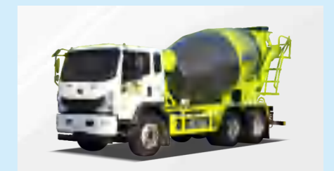
CONCRETE MIXER TRUCK