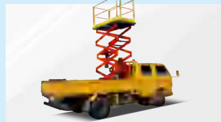
LADDER LIFT TRUCK