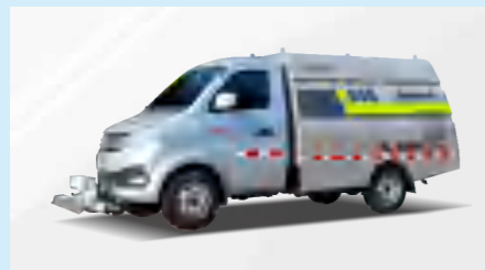
ROAD MAINTENANCE TRUCK