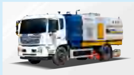
VACUUM CLEANER TRUCK