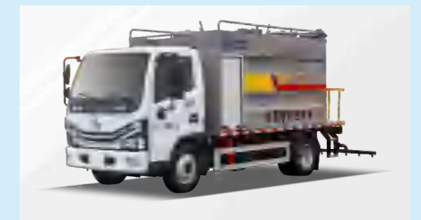
CEMENT SLURRY SPREADING TRUCK