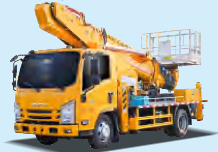
TELESCOPIC BUCKET TRUCK

The Kaili bucket truck is a specialized vehicle designed for reaching elevated areas safely and efficiently. It features an extendable boom with a bucket or platform at the end, which provides workers with a secure and stable working environment at height. These trucks are essential in various applications, such as maintaining and repairing electrical lines, installing signage, and performing construction tasks. Equipped with hydraulic systems for smooth operation, bucket trucks are vital tools for tasks that require access to difficult-to-reach locations.