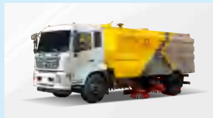
ROAD SWEEPER TRUCK