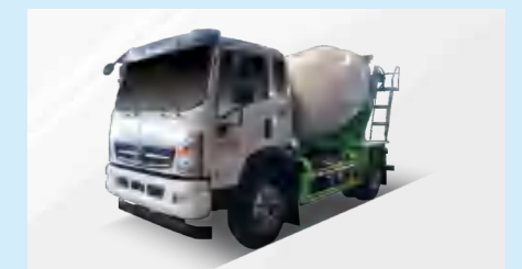
CONCRETE MIXER TRUCK