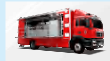
FOOD SUPPORT TRUCK