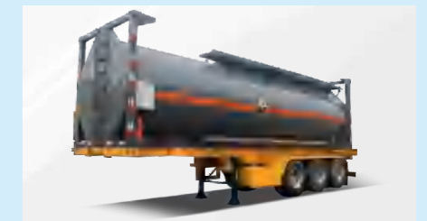
CORROSIVE TANK TRUCK