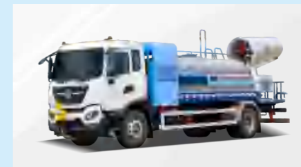
DUST SUPPRESSION TRUCK