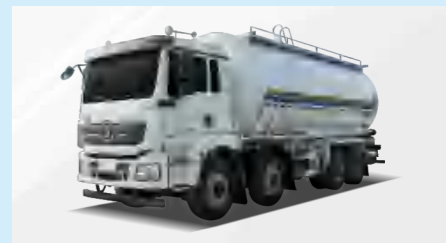
BULK CEMENT TRUCK