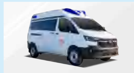
GASOLINE TRANSFER AMBULANCE