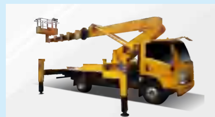
ARTICULATED TELESCOPIC BUCKET TRUCK