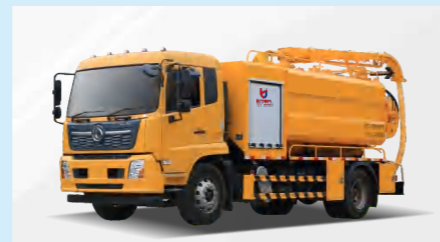
SEWAGE SEPTIC TRUCK