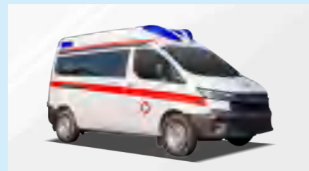
DIESEL TRANSFER AMBULANCE