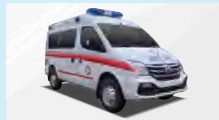
SHORT WHEELBASE GUARDIAN AMBULANCE