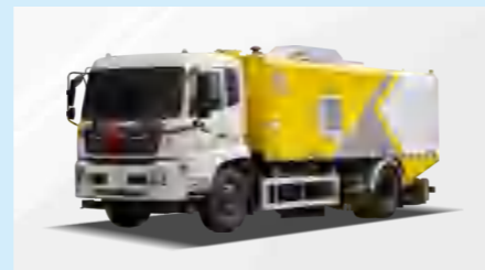
THE KING OF VACUUM CLEANER TRUCK