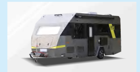
SEWAGE SEPTIC TRUCK