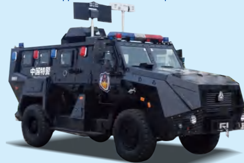
EXPLOSION-PROOF POLICE CAR

The KAILI Explosion-Proof Police Vehicle is specially designed for high-risk operations, providing superior protection in environments with potential explosive threats. The vehicle incorporates advanced explosion-proof materials and technology, combining durability with versatility. Whether for maintaining public safety, responding to emergencies, or handling special incidents, the KAILI Explosion-Proof Police Vehicle offers solid and reliable support for law enforcement personnel.