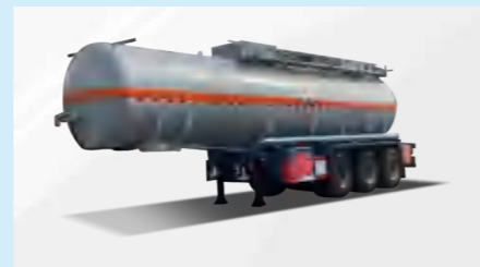
FUEL TANK TRUCK