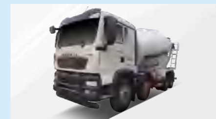
CONCRETE MIXER TRUCK