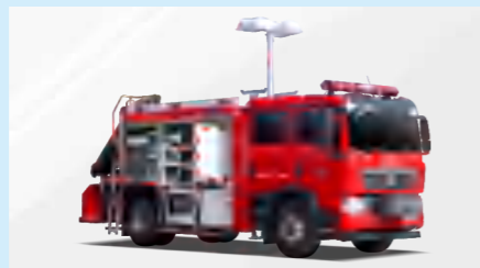
RESCUE FIRE TRUCK