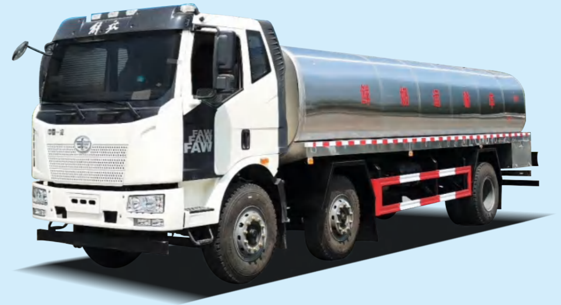
MILK TANK TRUCK