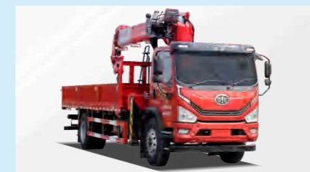
STRAIGHT BOOM CRANE