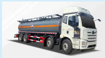
OIL TANK TRUCK