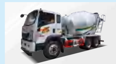
CONCRETE MIXER TRUCK