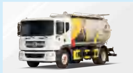
VACUUM SEWAGE TRUCK