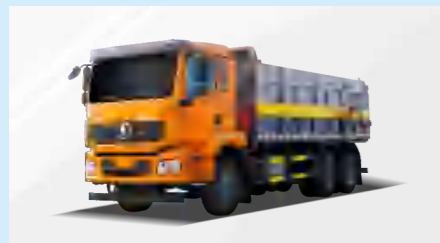
DUMP GARBAGE TRUCK