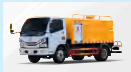
SEWAGE JETTING TRUCK