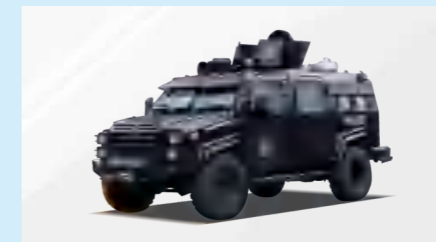
EXPLOSION-PROOF POLICE CAR