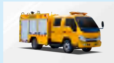
ENGINEERING RESCUE TRUCK