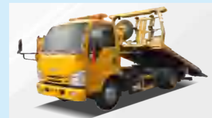
WRECKER TOW TRUCK