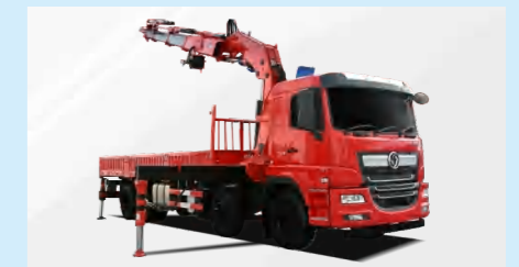
KNUCKLE BOOM TRUCK MOUNTED CRANE