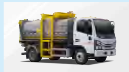
KITCHEN WASTE GARBAGE TRUCK