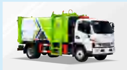
SIDE LOADER GARBAGE TRUCK