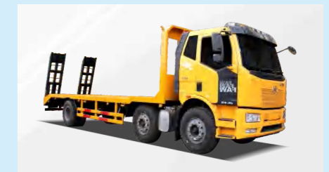
CRANE TOW TRUCK