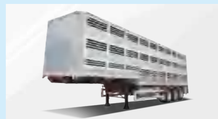
LIVESTOCK AND POULTRY TRANSPORT TRUCK