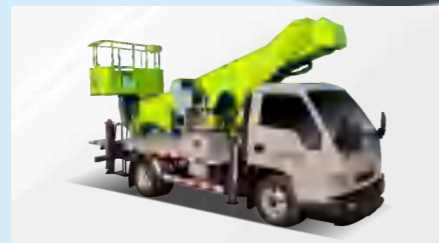
ARTICULATED BUCKET TRUCK