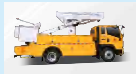
INSULATED BUCKET TRUCK