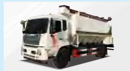
BULK FEED TRANSPORT TRUCK