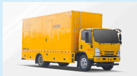
POWER SUPPLY TRUCK