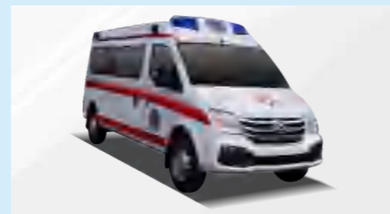
LONG WHEELBASE MID-ROOF GUARDIAN AMBULANCE