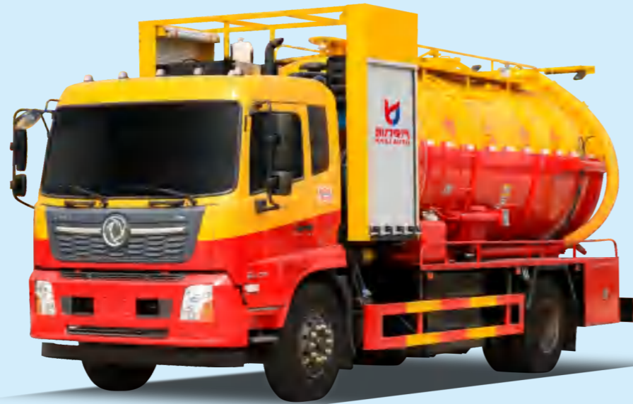
VACUUM SEWAGE TRUCK

KAILI Sewage Truck Series offers a comprehensive range of solutions for sewer and pipeline maintenance, designed to meet various operational needs. Our trucks are equipped with advanced technology for high-pressure jetting and powerful vacuum suction, ensuring efficient and effective cleaning of sewage systems.