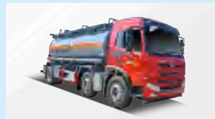
CHEMICAL TANK TRUCK