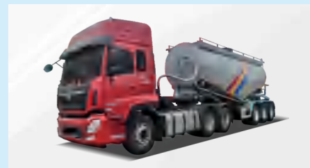
BULK CEMENT TRUCK