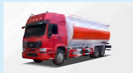
BULK CEMENT TRUCK