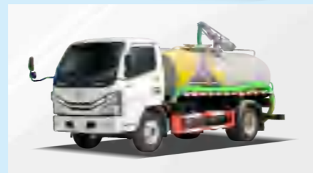
SEWAGE SEPTIC TRUCK