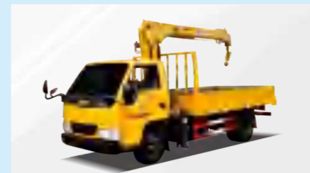
TOW TRUCK MOUNTED CRANE