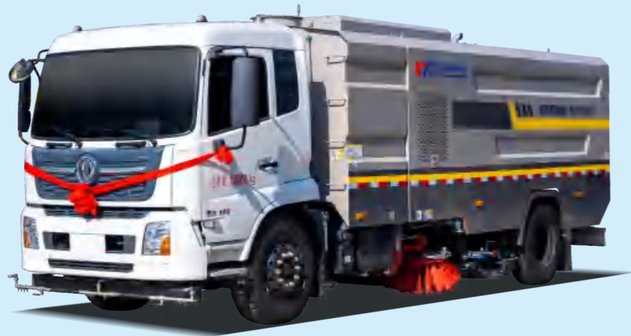
ROAD SWEEPER TRUCK

KAILI Road Cleaning Trucks are designed for efficient and effective street maintenance. Equipped with advanced sweeping technology, these trucks ensure thorough cleaning of roads, sidewalks, and other public spaces. They feature high-performance brushes and suction systems to remove dirt, debris, and litter, enhancing urban cleanliness and safety. Ideal for municipal and industrial use, KAILI's road cleaning trucks offer durability, reliability, and ease of operation, making them a valuable asset for maintaining clean and safe environments.