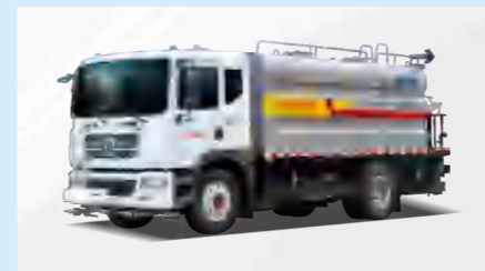
MULTIFUNCTIONAL CEMENT SLURRY SPREADING TRUCK