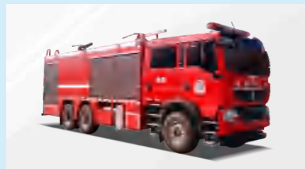
DRY POWDER FIRE TRUCK