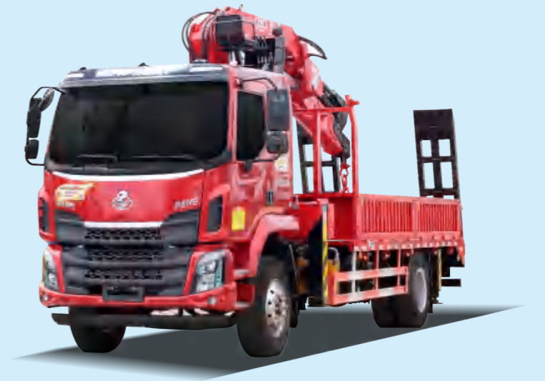
TRUCK WITH MOUNTED CRANE

The Kaili truck with crane is a versatile and powerful vehicle designed to handle heavy lifting and transportation tasks efficiently. This truck is equipped with an integrated crane that allows for easy loading and unloading of various materials, making it an essential tool for construction sites, logistics, and industrial applications. The Kaili truck with crane is engineered for stability and precision, featuring a robust chassis and advanced hydraulic systems to ensure smooth and safe operation. Its flexible design enables it to adapt to different lifting requirements, providing businesses with a reliable solution for their material handling needs.