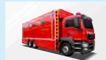
FIRE DEPARTMENT UTILITY TRUCK