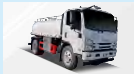
WATER TANK TRUCK