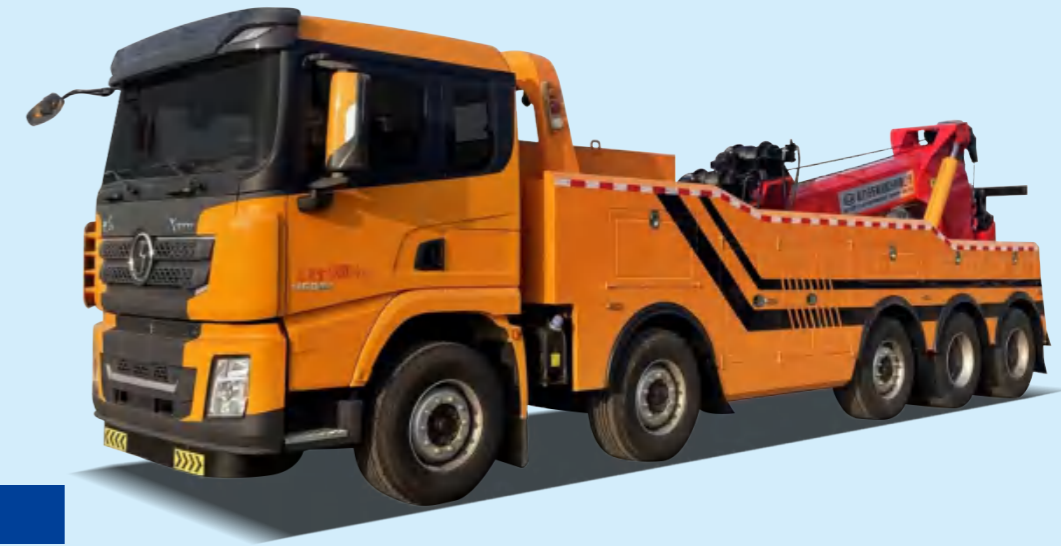
WRECKER TOW TRUCK

The Kaili Tow Truck Series is designed to provide superior roadside assistance and vehicle transport solutions. These tow trucks are known for their robust construction, advanced technology, and versatility, making them ideal for a variety of towing and recovery tasks.