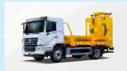
ANTI-COLLISION BUFFER TRUCK