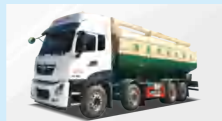
BULK FEED TRANSPORT TRUCK