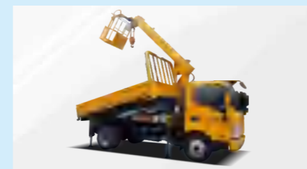
TELESCOPING TRUCK MOUNTED CRANE