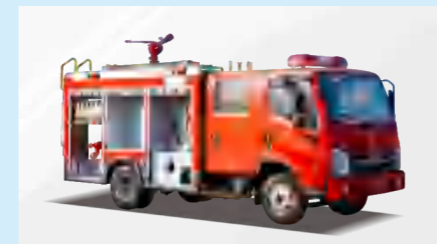
PUMPER FIRE TRUCK