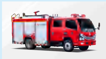
WATER FIRE TRUCK