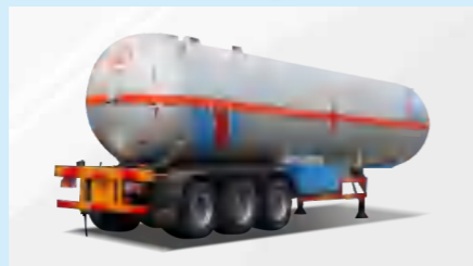
GAS TANK TRUCK