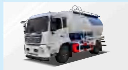
BULK CEMENT TRUCK