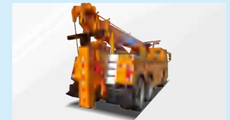
ROTATOR TOW TRUCK