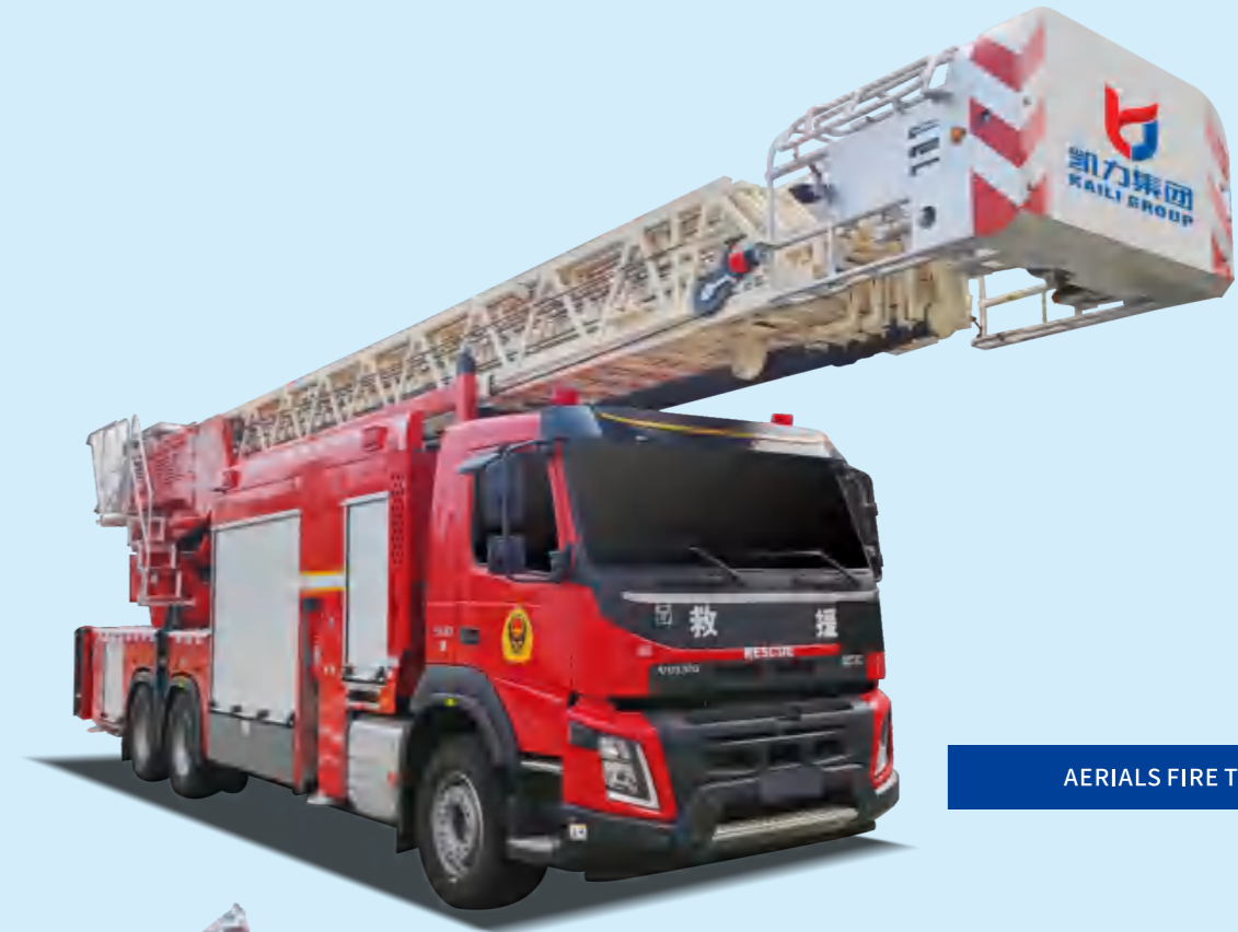
AERIALS FIRE TRUCK