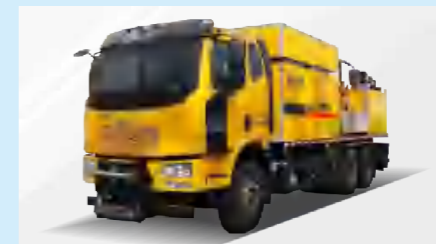
HOT RECYCLED ASPHALT PAVEMENT MAINTENANCE TRUCK