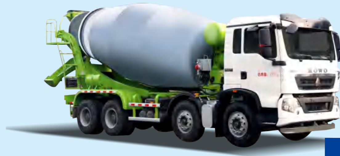
CONCRETE MIXER TRUCK

The KAILI Concrete Mixer Truck is built for efficient and reliable concrete mixing and transportation. Featuring a robust design and advanced mixing technology, it ensures uniformity and quality of concrete while on the move. Ideal for construction sites and large-scale projects, the KAILI Concrete Mixer Truck combines durability with high performance to meet the demands of modern construction.