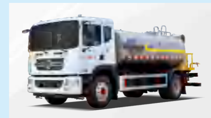
GREEN SPRAYING TRUCK