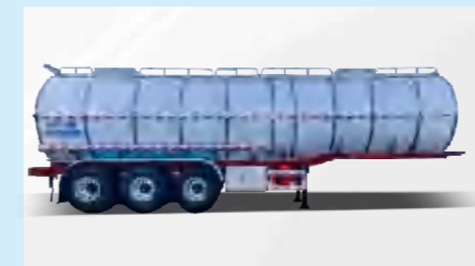
STAINLESS STEEL TANK TRUCK