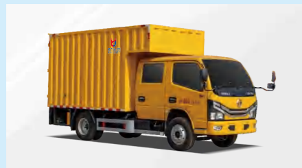
EMERGENCY REPAIR TRUCK