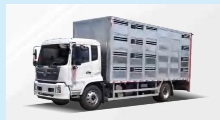
LIVESTOCK AND POULTRY TRANSPORT TRUCK