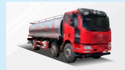
MILK TANK TRUCK