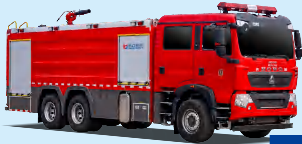
FOAM FIRE TRUCK

The Kaili Fire Truck Series embodies reliability, versatility, and efficiency, making it an indispensable asset for fire departments and emergency services worldwide. Each truck is designed to ensure the safety and effectiveness of firefighting personnel while responding to various types of emergencies.