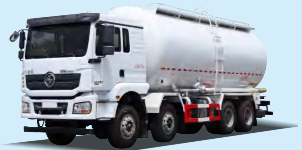
BULK CEMENT TRUCK

The KAILI Bulk Cement Truck is designed for efficient and precise bulk cement transportation. Featuring a high-capacity tank and advanced pneumatic systems, it ensures smooth and reliable delivery of cement to construction sites and industrial facilities. Built with durability in mind, the KAILI Bulk Cement Truck offers exceptional performance and operational ease, making it a key asset for large-scale construction and infrastructure projects.