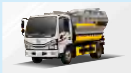
DUMPER PLACER GARBAGE TRUCK