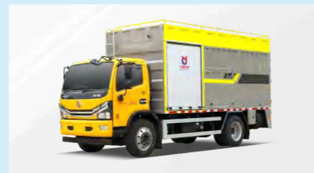
SEWAGE CLEANER TRUCK