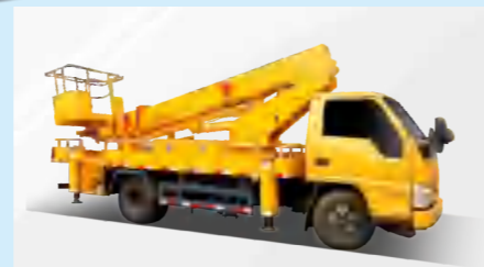
TELESCOPIC BUCKET TRUCK