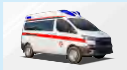
DIESEL ABS MOLD GUARDIAN AMBULANCE