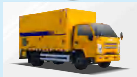
POWER SUPPLY TRUCK