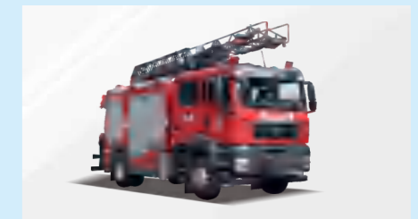
MULTIPURPOSE FIRE TRUCK