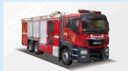
CHEMICAL FIRE TRUCK